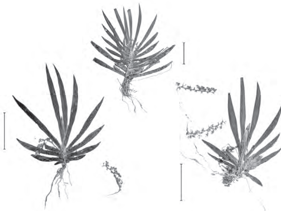
Figure 2. Ornithocephalus leslie-garayi , habit. Scale bars = 3 cm.

Taxonomic notes. O. leslie-garayi is similar to O. caveroi which was collected in southern Peru, in Puno province ca. 1500 km distant from the Colombian border. Both species share a similar lip form which is pandurate with epichile incurved towards the gynostemium, but the two species can be separated based on a series of morphological characters. O. caveroi has flowers about twice larger than in the new species and a different lip callus which consists of an ovoid central part and lateral erect-incurved, oblong calli. The epichile of O. caveroi is covered with hirsute hairs and its sepals and floral bracts are more bristle.