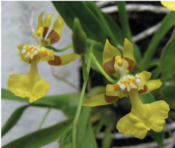
Figure 9. Neoruschia cogniauxiana (Schltr.) Cath. & V.P. Castro.

as synonyms of Alatiglossum . In another article, BARROS & RODRIGUES (2010b) created a new genus Nitidocidium to accommodate Oncidium gracile Lindl., previously treated as a member of Carenidium by Baptista (in DOCHA NETO et al. 2006), emphasizing the molecular results – placing O. gracile at the base of the Alatiglossum clade – and the absence of common morphological features between both entities.