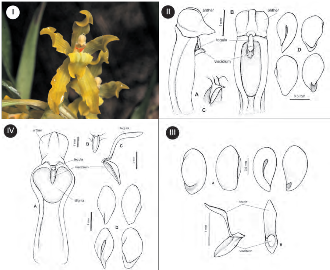
Figure 14. I. Gomesa recurva R. Br. (photo: L.F.Varella). II. Gomesa planifolia Klotzsch ex Rchb. f.: gynostemium details. A – gynostemium, side view; B – gynostemium, bottom view; C – rostellum remnant; D – pollinia, various views [Kew RBG, K 12544]. III. Gomesa planifolia Klotzsch ex Rchb. f.: gynostemium details. A – pollinia, various views; B – tegula and viscidium, various views [Kew RBG, K, cult.]. IV. Gomesa brasiliensis (Rolfe) M.W. Chase & N.H. Williams: gynostemium details. A – gynostemium, bottom view; B – rostellum remnant; C – tegula and viscidium, side view; D – pollinia, various views [Kew RBG, K 47505].