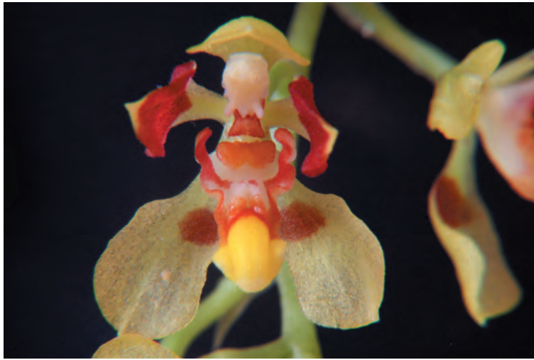
Figure 11. Carriella colorata (Königer & J.G. Weinm.) V.P. Castro & K.G. Lacerda.

and lip callus consisting of parallel keels running in the lower half, with more sophisticated pattern consisting of variously shaped projections. Additionally, lip middle lobe of Baptistonia is suborbicular to transversely elliptic. The genus Campaccia is similar in many respects to Baptistonia , but can be distinguishable from the latter by having 2–3-leaved pseudobulbs (vs 1-leaved), lip and gynostemium form an obtuse angle (vs acute angle) and apical clinandrium is obscure (vs prominent), otherwise both taxa are very similar. Therefore, we decided to amalgamate them maintaining the status of separate subgenera for both.