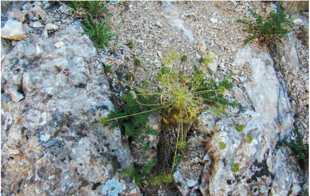
Figure 4. Schulzia tianschanica (Sandalash Range).

long, cartilaginous at the top; stem leaves 3-pinnate, 4 in a whorl with smaller leaf blades, in the axils with extra umbels, exceeding the terminal umbel. Umbels 20–34 cm in diameter, with 14–30 ribbed, unequal rays, longest of which 12–18 cm long, when fruiting bent downwards when fruiting; bracts are leaf-shaped, pinnate, on short petioles. Umbellets 1.3–2 cm in diameter, 25–40 flowers, pedicels near equally round in cross section, 3–5 mm long; bracteoles 10–15, leaf-