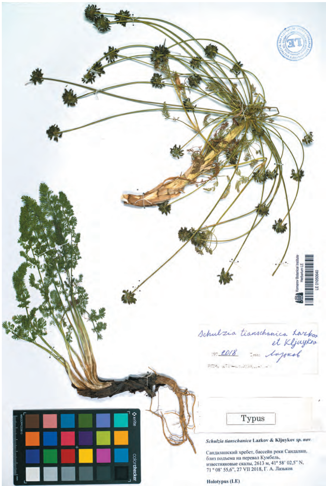
Figure 2. Schulzia tianschanica holotype [LE 01050640].