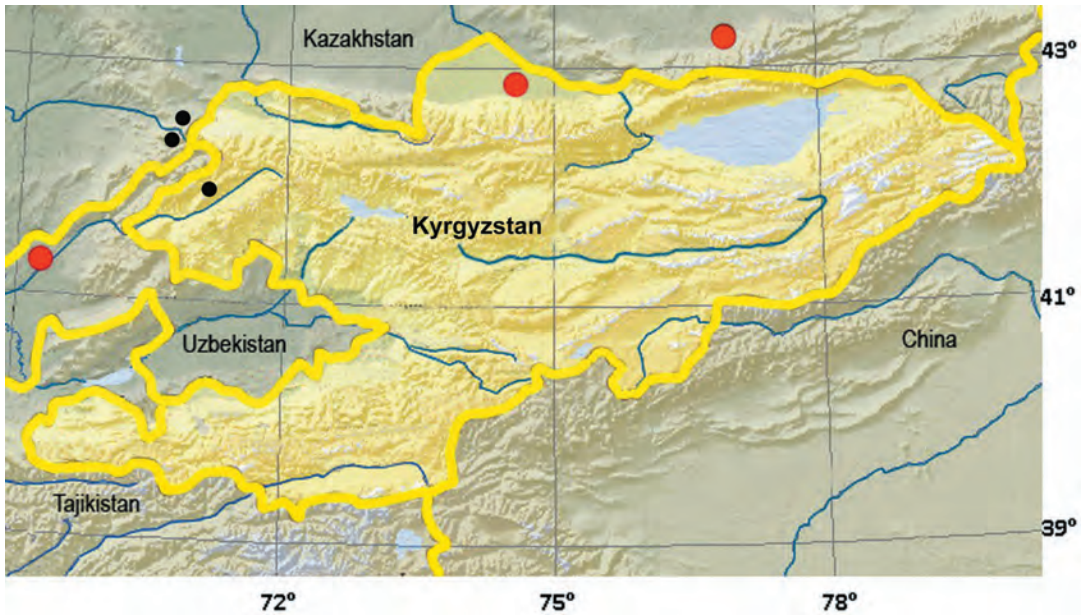
Figure 3. Distribution of Schulzia tianschanica (black dots).

long, cartilaginous at the top; stem leaves 3-pinnate, 4 in a whorl with smaller leaf blades, in the axils with extra umbels, exceeding the terminal umbel. Umbels 20–34 cm in diameter, with 14–30 ribbed, unequal rays, longest of which 12–18 cm long, when fruiting bent downwards when fruiting; bracts are leaf-shaped, pinnate, on short petioles. Umbellets 1.3–2 cm in diameter, 25–40 flowers, pedicels near equally round in cross section, 3–5 mm long; bracteoles 10–15, leaf-