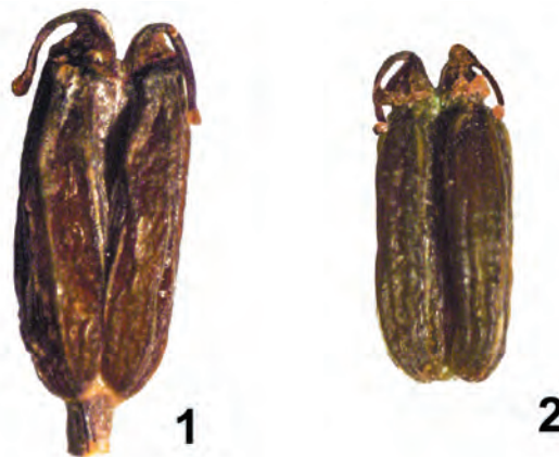
Figure 1. General views of fruits. 1 – Schulzia albiflora (immature fruit, with stylopodia merged to mericarps), 2 – S. tianschanica (immature fruit, with stylopodia separate from mericarps).

Description. Monocarpic herb, glabrous. Tap root up to 1 cm in diam., collar with black brown remnants of petioles. Stems with the pods of terminal umbel 3–13 cm long, ca. 6 mm in diameter at base, solid, finely grooved, branched from the base, internodes 1–3, short. Basal leaf blades 5–9 cm long, 2–4 cm wide, narrowly triangular or lanceolate, 3-pinnate with primary segments closely spaced and touching; terminal segments dissected on linear-lanceolate lobes 2–3 mm