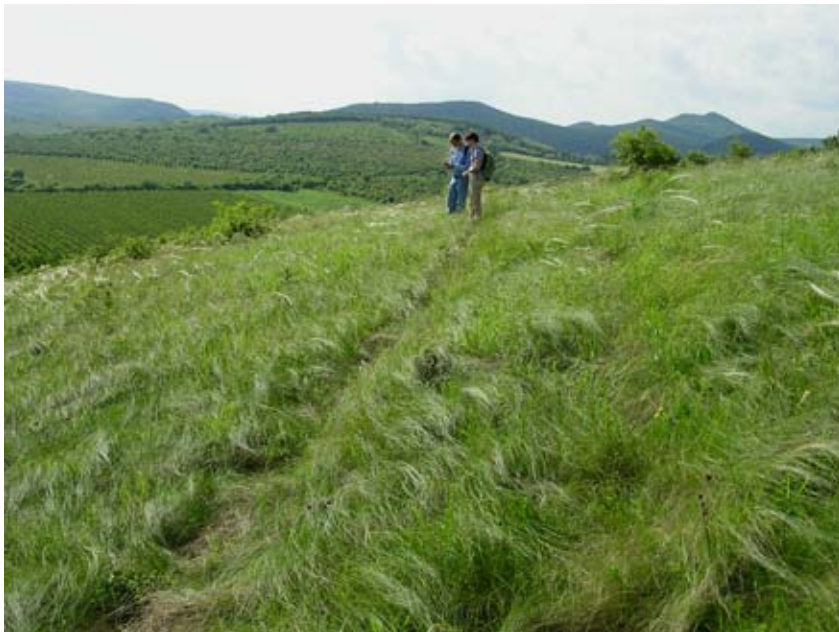
Fig. 3: Stipetum tirsae (Table 1, rel. 112). Börzsöny Mts., Ruzsás-hegy Mt.

Early stages of succession from the Festucion valesiaca towards the Cirsio-Brachypodium pinnati are documented by the relevés 116–118 (Table 1, Fig. 4). Relevés 116 and 117 are dominated by Stipa pulcherrima and most probably represent successional shifted stands