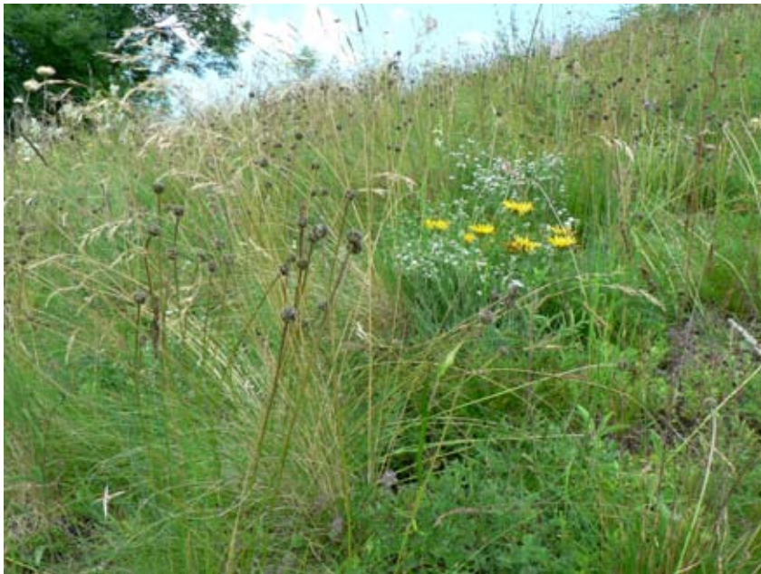
Fig. 2: Astragalo exscapi-Crambetum tatariae (Table 1, rel. 101). Pavlovské vrchy Mts., Šibeničník Nature Reserve.

Dry grasslands on acidic (quartzite) and base-poor volcanic bedrock (Table 1, rel. 105–111) represent transitions between the Festucion valesiacae and the Koelerio-Phleion