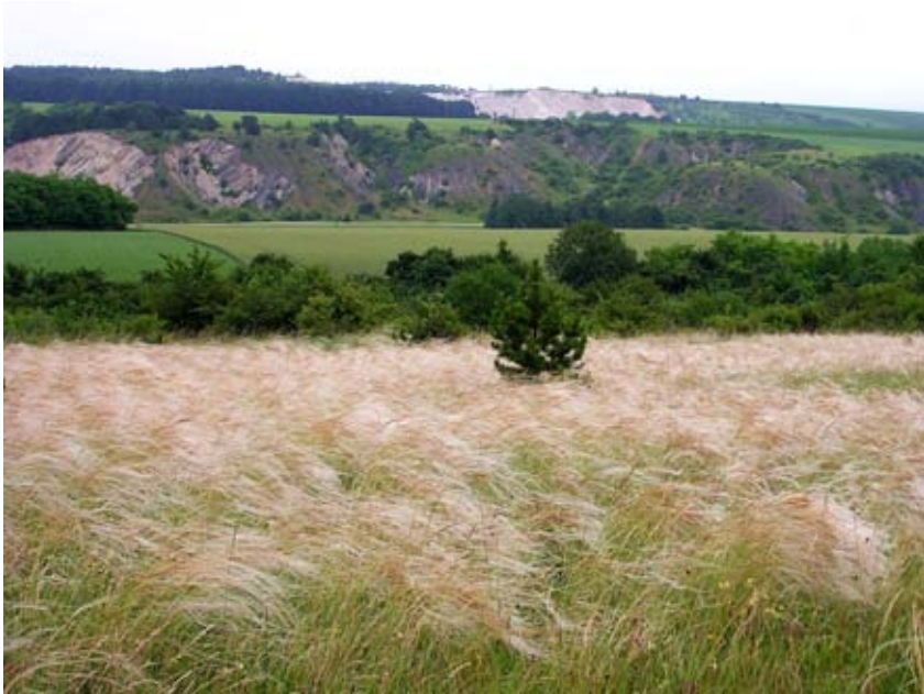
Fig. 4: Dry grassland dominated by Stipa pulcherrima (Table 1, rel. 116). Malé Karpaty Mts., Pod Holým vrchom Nature Reserve. In the background, there are scree slopes with stands of the Poo badensis-Festucetum pallentis (Table 1, rel. 19 and 30).

Abb. 4: Von Stipa pulcherrima dominiertes Trockenrasen (Tabelle 1, Aufn. 116). Malé Karpaty Mts., Naturschutzgebiet Pod Holým vrchom. Im Hintergrund erkennt man Schutthalden mit Beständen des Poo badensis-Festucetum pallentis (Tab. 1, Aufn. 19 and 30).