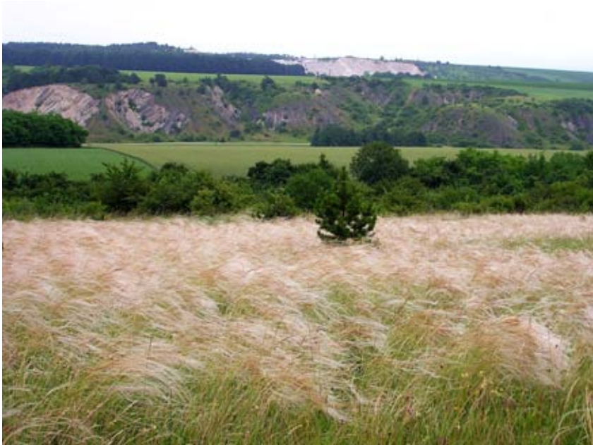
Fig. 4: Dry grassland dominated by Stipa pulcherrima (Table 1, rel. 116). Malé Karpaty Mts., Pod Holým vrchom Nature Reserve. In the background, there are scree slopes with stands of the Poa badensis-Festucetum pallentis (Table 1, rel. 19 and 30).

Abb. 4: Von Stipa pulcherrima dominiertes Trockenrasen (Tabelle 1, Aufn. 116). Malé Karpaty Mts., Naturschutzgebiet Pod Holým vrchom. Im Hintergrund erkennt man Schutthalden mit Beständen des Poa badensis-Festucetum pallentis (Tab. 1, Aufn. 19 and 30).