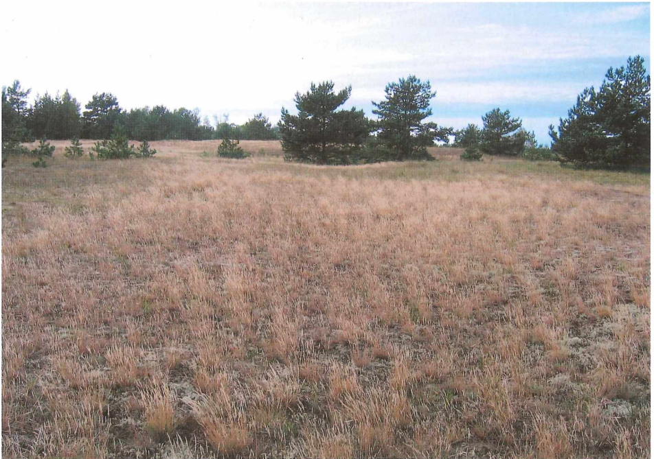
Fig. 3: Corniculario aculeatae-Corynephorum canescens in Pāvilosta.

burned, creating mobile sand areas without vegetation. However, the former land use has drastically decreased during the last 20–30 years. Many grey dunes have been overgrown with pine trees, shrubs or dense Calamagrostis epigeios stands, and only some sandy patches or belts on pathways develop periodically. As wind is a significant factor even for grey dunes, and considering that the dunes of Pāvilosta are situated towards the sea, the ecological preconditions are more or less favourable for the Corynephorus canescens habitat development. The Corniculario-Corynephorum typically colonises weakly acid to neutral soil without a humus layer or with a very thin one. A limiting factor for plants is the shingle-sandy soil substrate, which is easily leached.