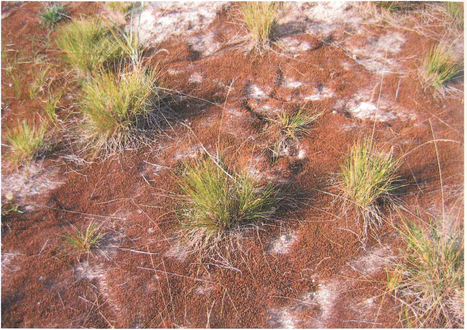
Fig. 5: Festucetum polesicae , variant of Gypsophila paniculata , in Pape.