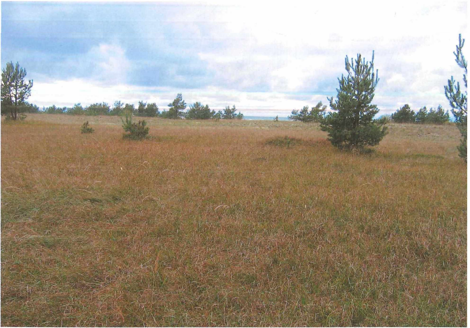
Fig. 4: Caricetum arenariae in Pāvilosta.

Stands of the Caricetum arenariae with dense vegetation mostly occur in depressions and on leeward slopes. These sites are relatively humid, eutrophic and protected by dunes from sea wind and sand drift. Often, Caricetum arenariae is like a contact community between mesophytic grasslands and the Festucetum polesicae or even primary dunes with Leymus arenarius . The main localities of the older successional stages Caricetum arenariae are the widest dune areas of, e.g., Nida-Pape, Ziemupe, Pāvilosta and Rīga. These dunes were formerly grazed or cut, but during the last 20 years this land use has nearly stopped.