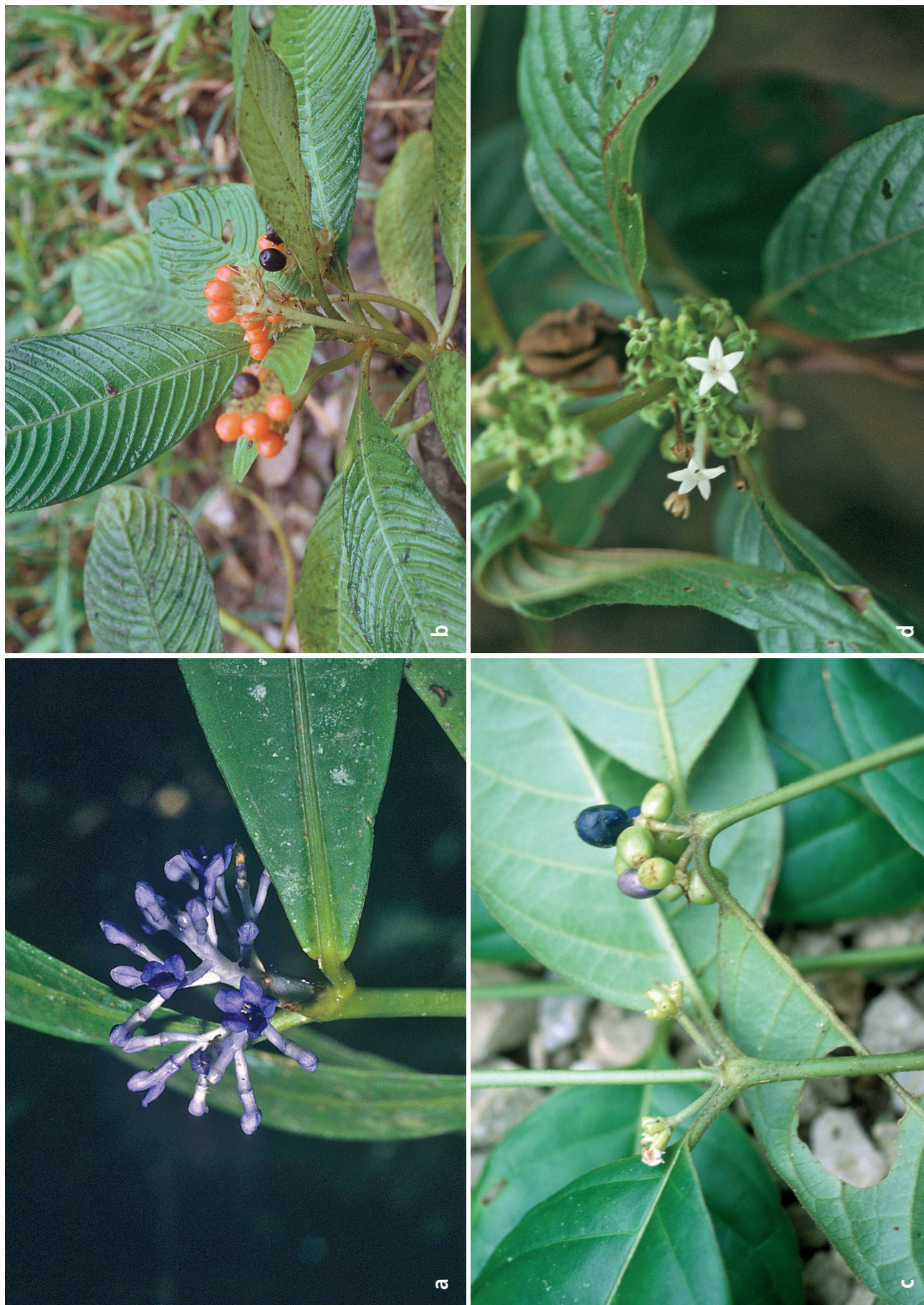
Plate 2: (a) Faramea suerrensis , (b) Notopleura polyphlebia (syn. Psychotria polyphlebia ), (c) Ronabea latifolia (syn. Psychotria erecta ), (d) Sabicea panamensis