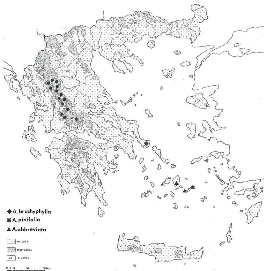
Fig. 3. Total geographical distribution of Asperula brachyphylla , A. abbreviata and A. pinifolia .

erature. However, A. pinifolia can easily be distinguished from A. brachyphylla as it has a more robust habit, glabrous or very shortly scabrid stems, with densely crowded whorls of relatively long (9–14 mm), shining leaves, longer corollas (6–10 mm long) and fruits (2.0–2.5 mm long) (see Table 1).