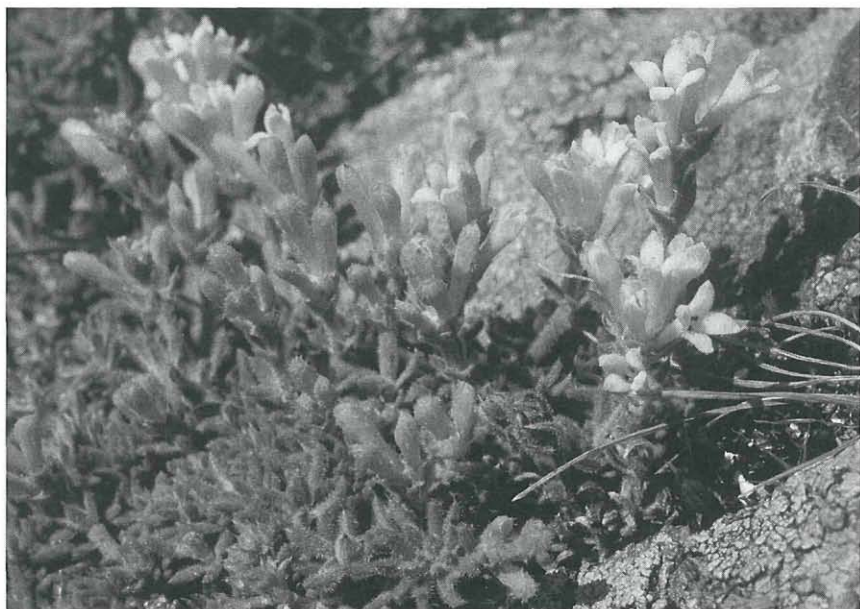
Fig. 2. Asperula brachyphylla : Habit. Mt. Ochi, summit area (Profitis Ilias), 19. 06. 1997

The largest population comprising of a few hundred individuals has been discovered on the northern steep slopes of Gioudas peak. On the southern and eastern slopes of Profitis Ilias, two more populations each of 50–60 individuals were found.