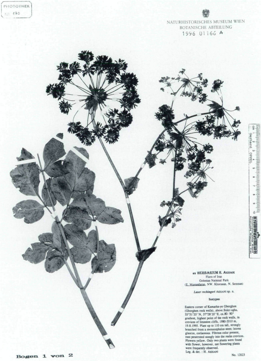
Fig. 2.: Laser rechingeri , isotype (Akhani 12023) in [W].