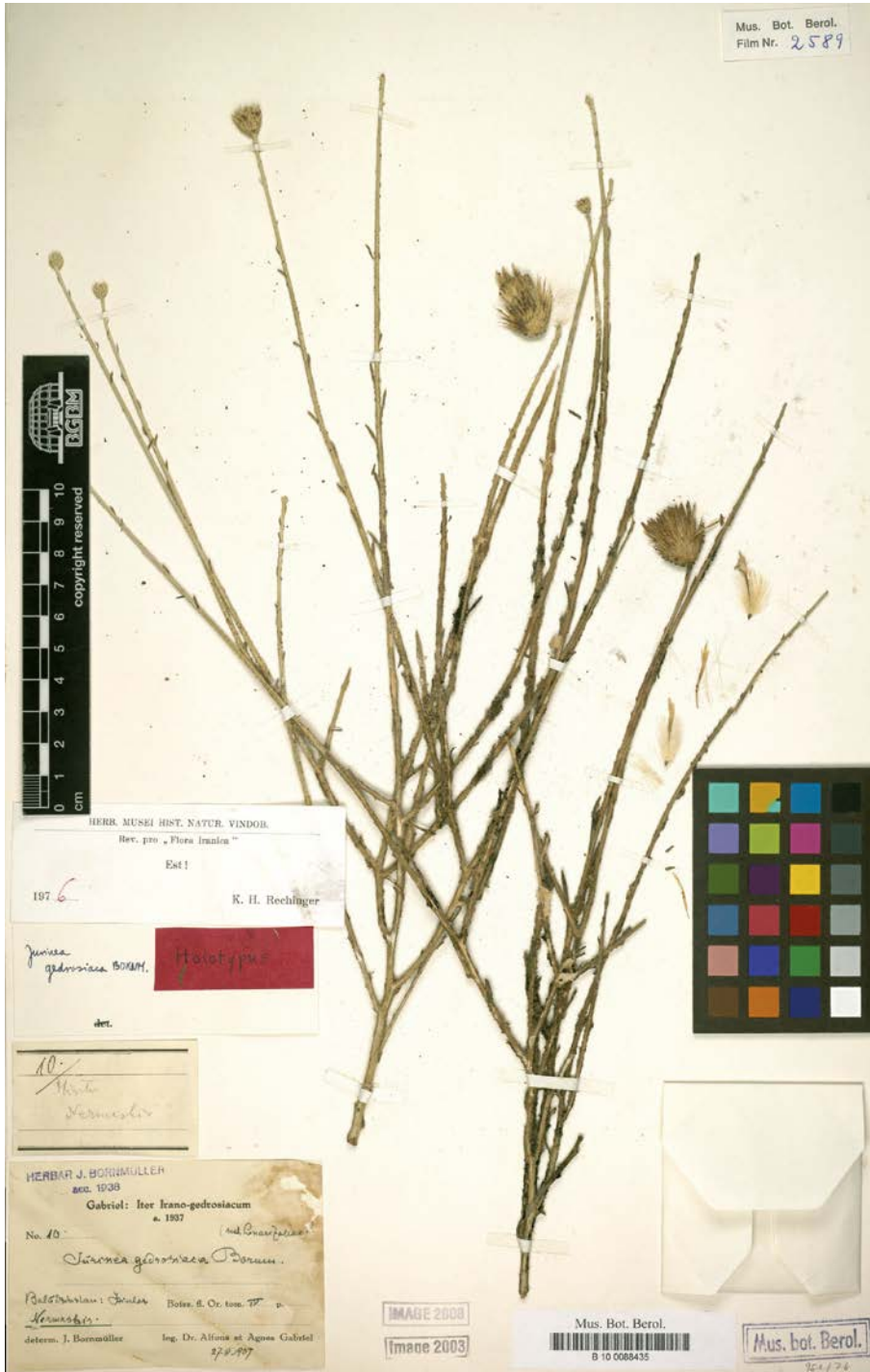
Fig. 1: Holotype specimen of Tricholepis gedrosiaca (former Jurinea gedrosiaca ), photo from BGBM online database.