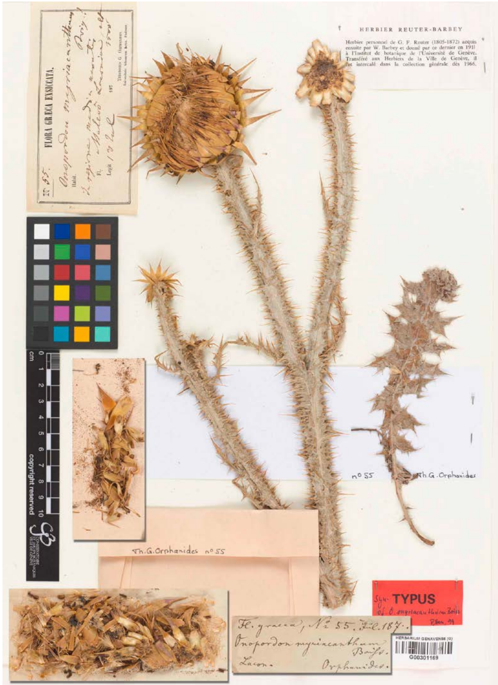
Fig. 2. Onopordum myriacanthum Boiss., Lectotype G.