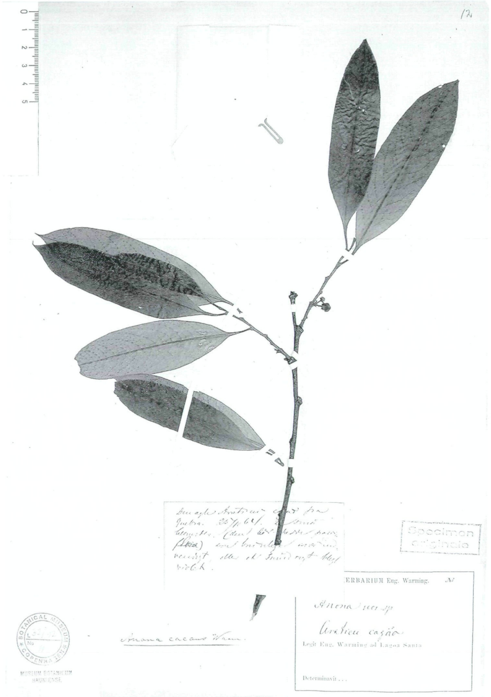
Fig. 1: Lectotype of Annona cacans WARM. (E. Warming s.n. [C])