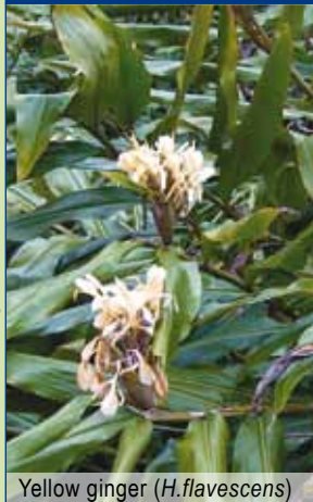
Yellow ginger ( H. flavescens )