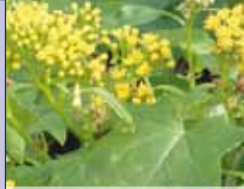
German ivy ( Senecio mikanioides )