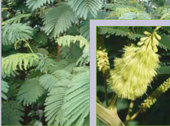
Brush wattle ( Paraserianthus lophantha )