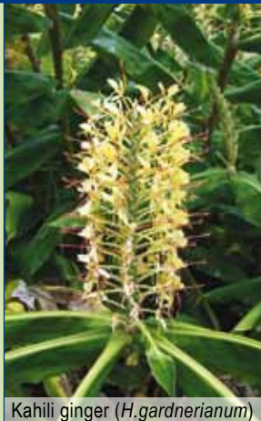
Kahili ginger ( H. gardnerianum )

Herbaceous perennials with large, branching, tuberous roots that form mats up to 1 metre thick. Hedychium gardnerianum spreads by seeds and root fragments, while Hedychium flavescens spreads only by root fragments. Forms dense colonies in natural areas smothering native plants and preventing native seedlings establishing.