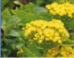
Cape ivy ( Senecio angulatus )