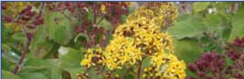
Velvet groundsel ( S. petasitis , aka Roldana petasitis )