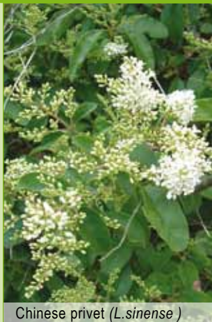
Chinese privet ( L. sinense )

Evergreen trees growing to 10 metres (tree privet - shown here in berry) and 7 metres (Chinese privet - shown in flower). Tree privet has dark green glossy leaves while Chinese privet has small, dull green leaves with wavy edges. Both species have spikes of white flowers and black, bird-spread berries. Crowds out native species in natural areas.