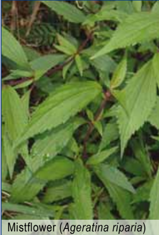
Mistflower ( Ageratina riparia )