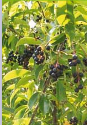
Rum cherry ( P. serotina )

Taiwan cherry is a vase-shaped deciduous tree growing to 8 metres tall with pink bell-shaped flowers emerging before leaves in spring. Rum cherry grows to 20 metres tall and has long clusters of small white flowers at the ends of the branches in spring, followed by black berries. Both cherries invade bush areas and crowd out native plants.