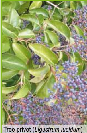
Tree privet ( Ligustrum lucidum )