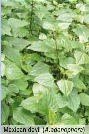
Mexican devil ( A. adenophora )

Erect, sprawling perennials to 1 metre tall with narrow, dull green leaves with serrated edges. Small white, fluffy flowers are followed by wind-spread seeds. Can completely smother native plant communities and cause sediment build-up, flooding and instability in steep gullies and streams.