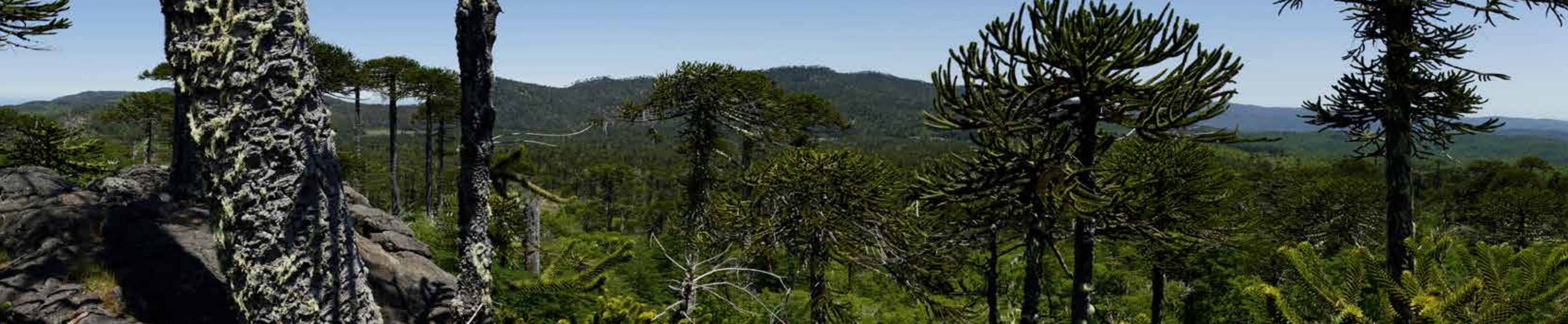
Araucaria araucana at Nahuelbuta