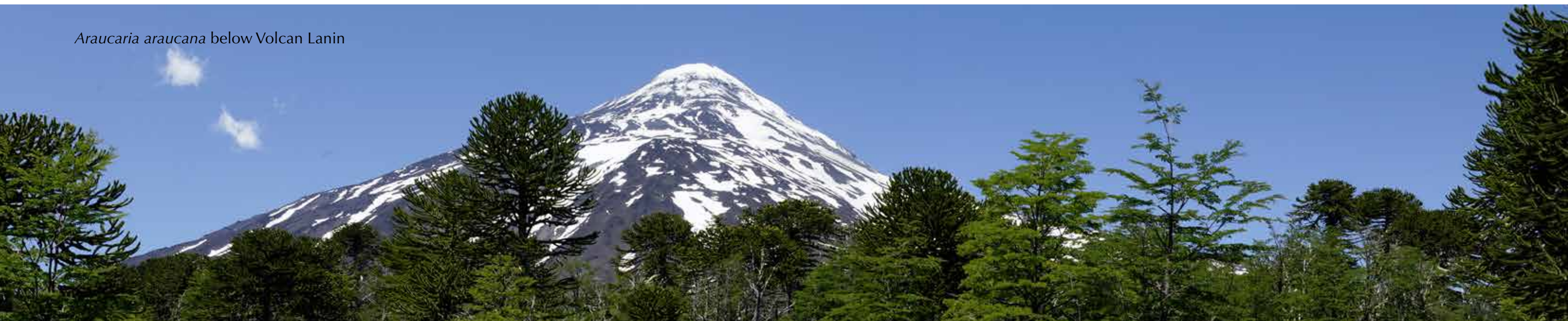
Araucaria araucana below Volcan Lanin