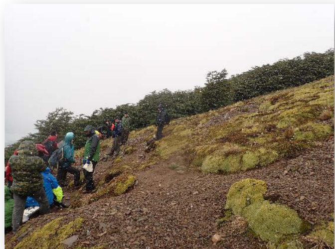
It's hard collecting when it's snowing! Alpine herbfield with cushion plants on Cerro La Bandera. Note the clearly defined line between Nothofagus forest and herbfield.