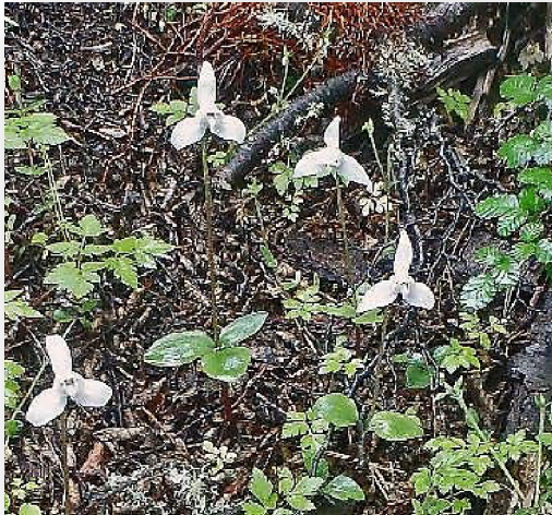
White Dog Orchids ( Codonorchis lessonii ), Cerro La Bandera Beech forest.