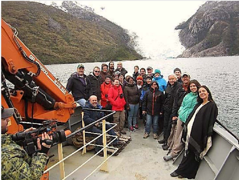
Bryologists on the Yagan ; Italian Glacier in the North Beagle Channel.