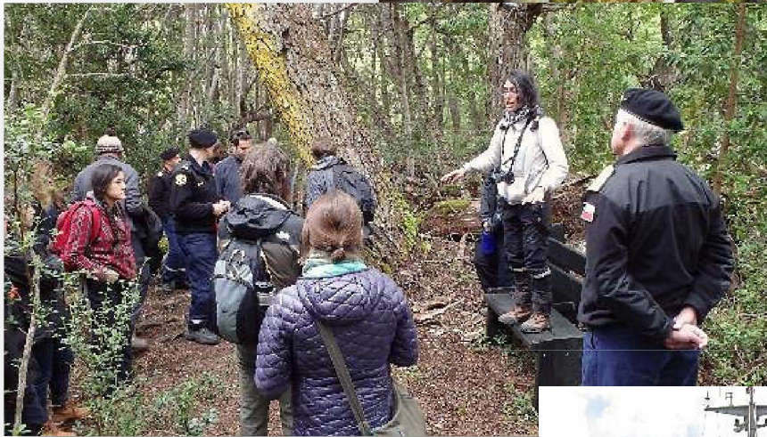
Omora Ethnobotanical Park – bryologists together with officers from the Armada de Chile and students from University of Connecticut and University of North Texas.