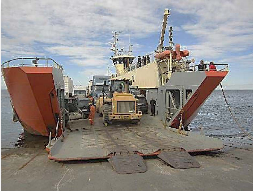
The Yagan Ferry transports goods, vehicles and people from Punta Arenas to Puerto Williams.