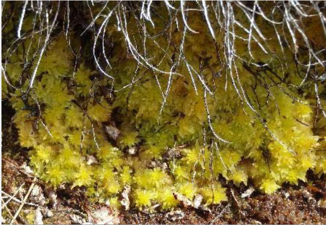
Sphagnum fimbriatum in the peatland.