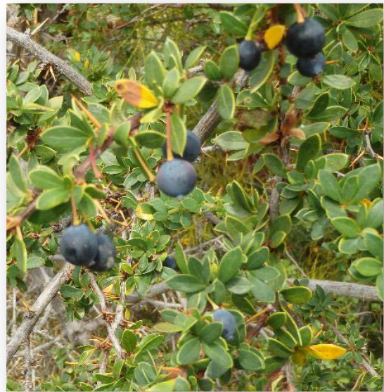
Calafate berries ( Berberis microphylla ).