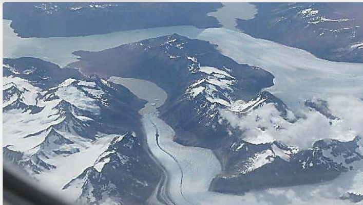
Glaciers in the Chilean Andes.