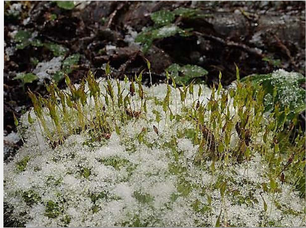
Mosses buried under sago snow in the Cerro La Bandera Beech forest.