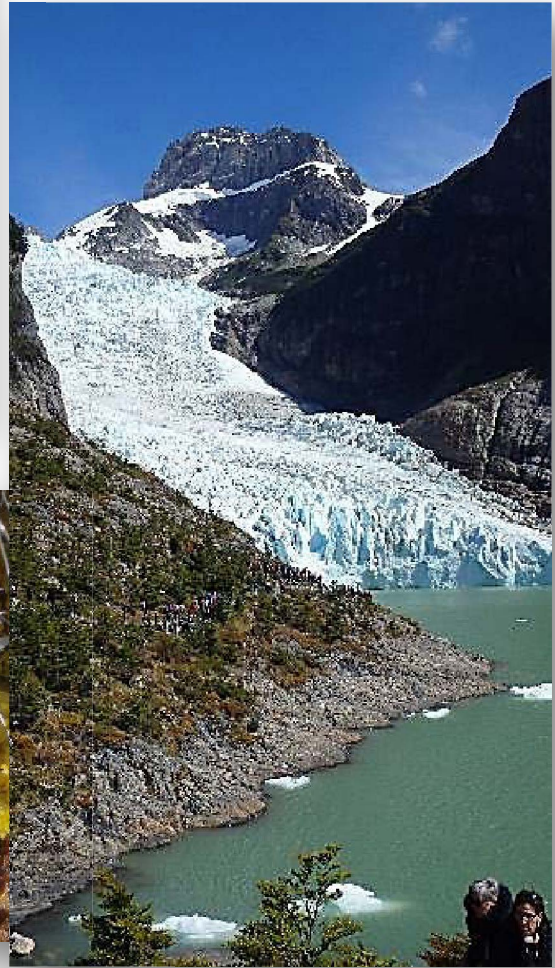
Serrano Glacier, Bernardo O'Higgins National Park.