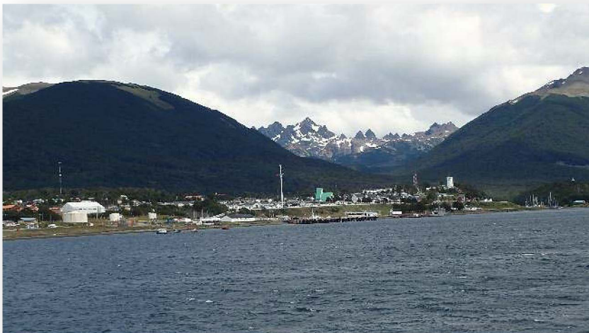
Puerto Williams, Chile, with the Dientes de Navarino in the background.