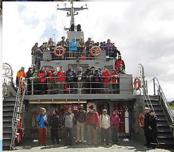
Not every day you get to do field work like this! Bryologists on board the Chilean Navy patrol boat Isaza , Wulaia Bay.