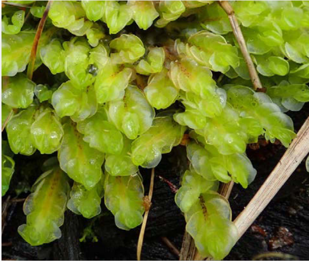
Noteroclada confluens at the edge of a stream in the peatland.