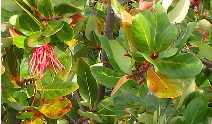
Embothrium coccineum (Proteaceae), Wulaia Bay.