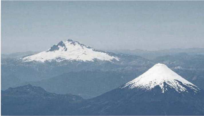
Volcanoes in the Chilean Andes.