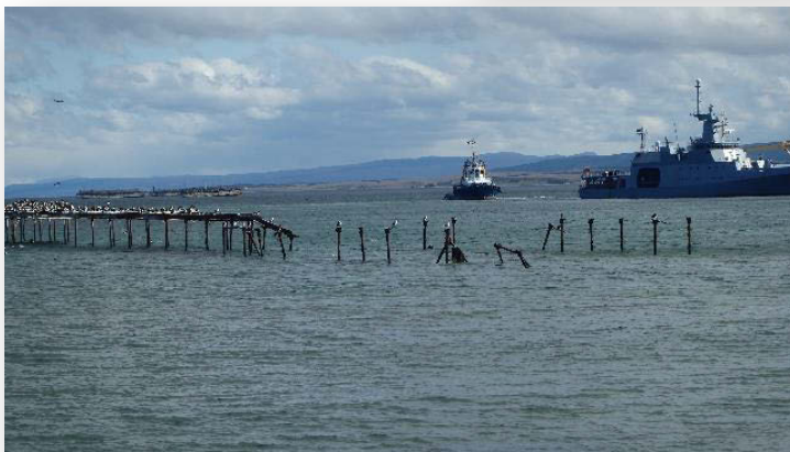
Strait of Magellan from Punta Arenas.