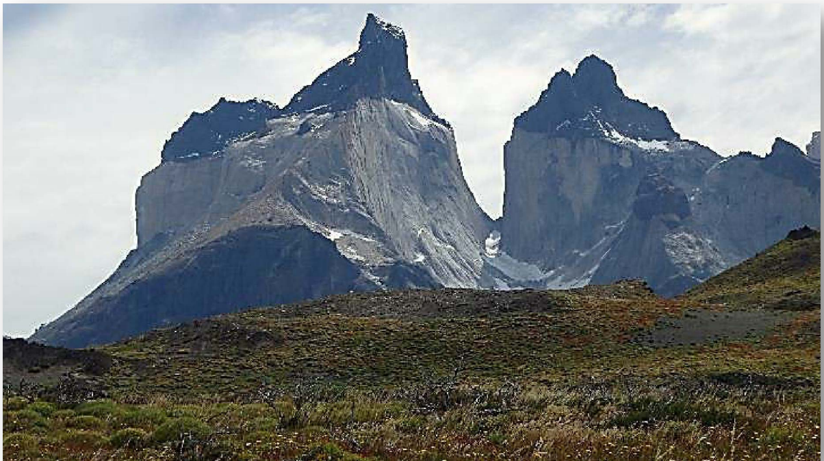
Horns of Torres del Paine Parque Nacional.