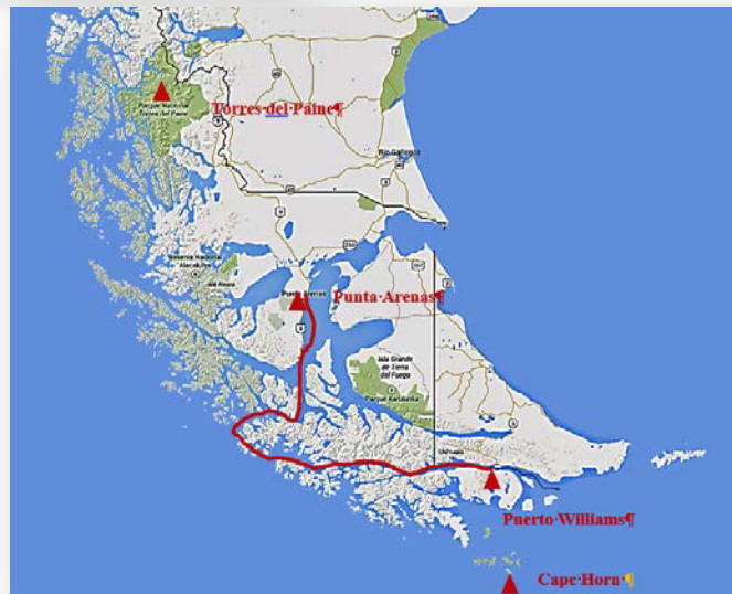
Navigation from Punta Arenas to Puerto Williams – Yagan ferry.