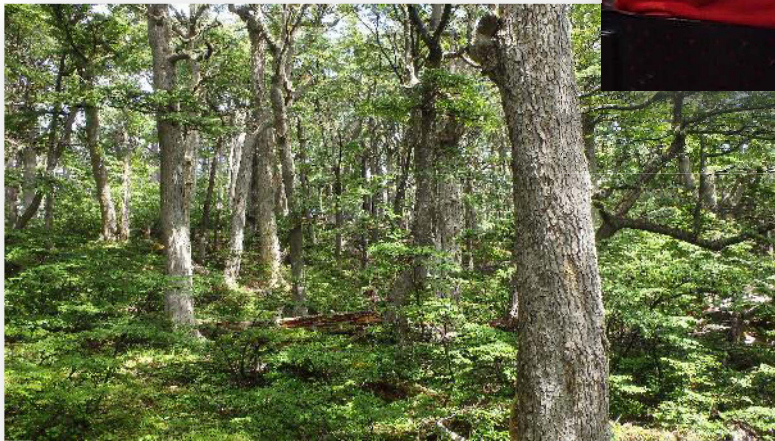
Nothofagus forest on Cerra La Bandera.