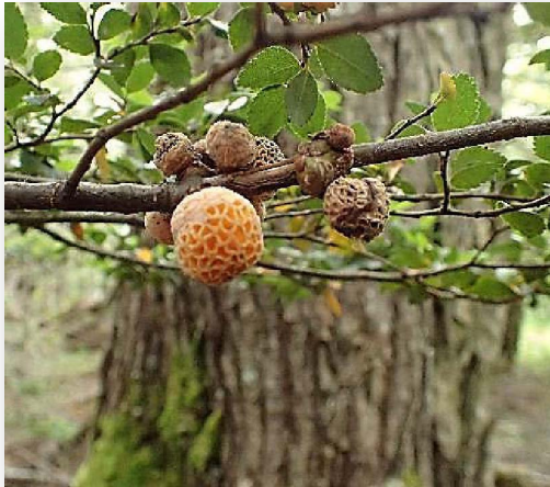
Edible Orange beech fungus ( Cyttaria harioti ), Cerro La Bandera Beech forest.