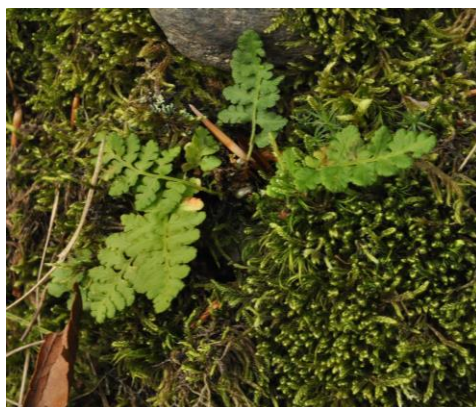
Fig. 2 Woodsia ilvensis in the Mount Kobyla (near the village of Kobyletska Poliana, Zakarpattia region).