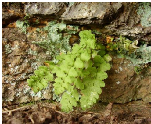
Fig. 1 Woodsia alpina in the Kam'yani Mohyly Nature Reserve (Ukrainian Steppe Natural Reserve of the National Academy of Sciences of Ukraine).

For precise and better identification of these species in the field, here we present their comparative morphological description (highlighted features of the species). Both species of the Woodsia genus are small plants with height varying from 5 to 25 cm, with a short, multi-pinnate rhizome covered with scales. Their fronds are monomorphic and summer-green, growing in a rosette. The petiole is shorter than the leaf blade and has an articulation near the middle ( W. ilvensis ) or at the base ( W. alpina ). Throughout its full length (including the rhachis), the petiole is also covered with ramenta. The most noticeable differences have been observed in the leaf blade. In W. alpina , the leaf blade is narrowly lanceolate, bipinnately-divided; in the adult state it is almost fully glabrous or covered with scattered fuzz. In W. ilvensis , the leaf blade is lanceolate, bipinnately-divided, dark green and covered with light brown fuzz on both sides, while its scales are located only on the abaxial side along the median veins. The primary segments of W. alpina are sessile, distinctly narrowed at the base, ovate or broadly ovate, pinnately-divided or pinnately-lobed, as well as rounded at the apex. In W. ilvensis , the primary segments are sessile, distinctly