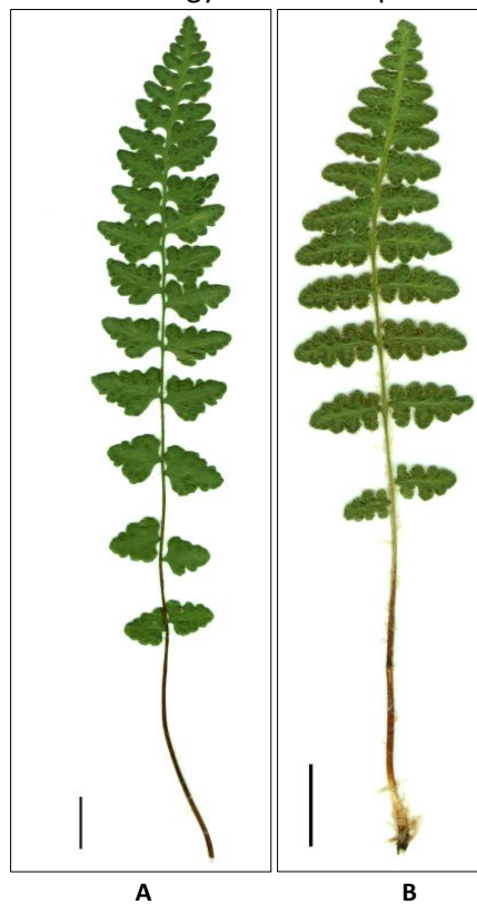
Fig. 3 General view of the fronds of Woodsia alpina (A; Kam'yani Mohyly Nature Reserve, Ukrainian Steppe Natural Reserve of the National Academy of Sciences of Ukraine) and W. ilvensis (B; Mount Obavskyyi Kamin', Transcarpathian region) (Vasheka & Bezsmertna 2012, modified). Scale bar = 1 cm.

Some Ukrainian sources noted that natural hybrids between these two species occur (Mosyakin & Fedoronchuk 1999; Chopyk & Fedoronchuk 2015). In particular, the hybrid W. ×gracilis (Lawson) Butters has been described from southeastern Canada (Tsvelev 2005a, b). Morphologically W. ×gracilis is more similar to W. alpina , but has some ramenta on the petiole, rachis and lower surface of the fronds. Its sori remain undeveloped for its entire life. However, in our opinion, this hybrid can be confused with young plants of W. ilvensis that may also have underdeveloped sori (Lawson 1864; Tsvelev l. c.). Although W. ×gracilis has been reported from Ukraine (Mosyakin & Fedoronchuk 1999; Chopyk & Fedoronchuk 2015), we have only considered the distribution and ecology of the two species W. alpina and W. ilvensis .