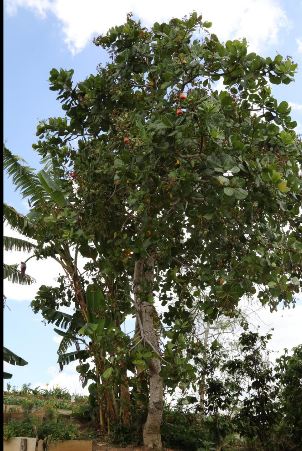
Cashew Anacardium occidentale