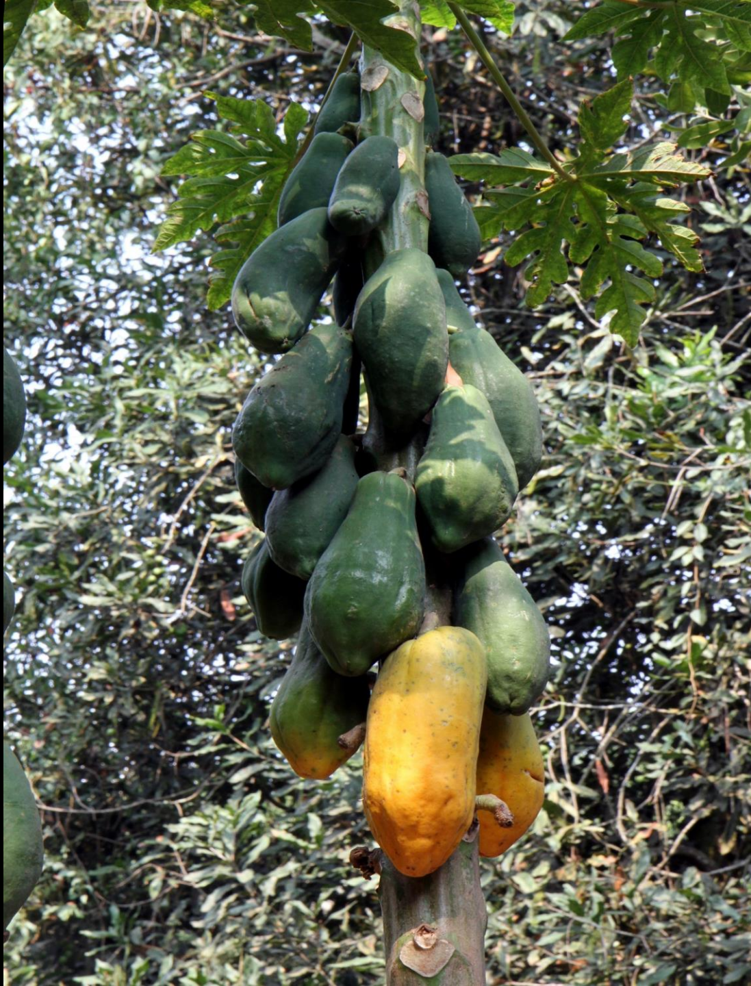
Papaya Carica papaya