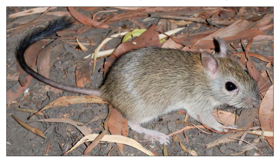
Figure 7: Brush-tailed Rabbit-rat

Brush-tailed Rabbit-rat (Figure 7), Pale Field-rat and Tiwi Masked Owl were frequently recorded during the survey and occurred throughout the study area, except the Pale Field-rat was not recorded in the far north. Butler's Dunnart was not trapped but was provisionally identified on camera trap photographs from three sites. Red Goshawk was not positively detected, although there were two uncorroborated sightings of birds and there are two previous records for this species just south of the study area.