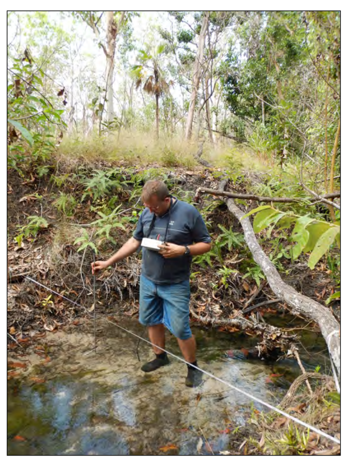
Figure 4: Stream gauging

For the three creeks with significant perennial baseflows, the absolute minimum flow rates for any year were estimated at 260 L/s, 60 L/s and 40 L/s, respectively. The longer term Bluewater Creek data were used to model expected monthly flow rates, predicting the average (50 percentile) flow rates for November (when flow is usually at its lowest) as 370 L/s, 100 L/s and 70 L/s respectively.