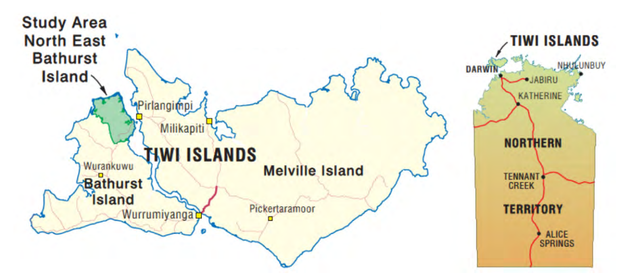
Figure 1: Location of the Study Area on the Tiwi Islands and within the Northern Territory

The study area comprised approximately 14 100 ha of terrestrial landscapes in north east Bathurst Island, with an additional 4 700 ha of intertidal environments broadly mapped for acid sulfate soils. The location of the study area in the Northern Territory and Tiwi islands is presented in Figure 1 and Figure 2.