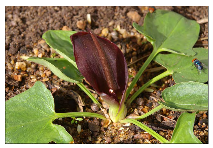
Figure 6: Typhonium jonesii

Surveys in the late dry season (October 2014) targeted monsoon forest and thicket patches. Plant species lists were compiled for 31 patches along with a population estimate for each species of conservation significance within each patch.