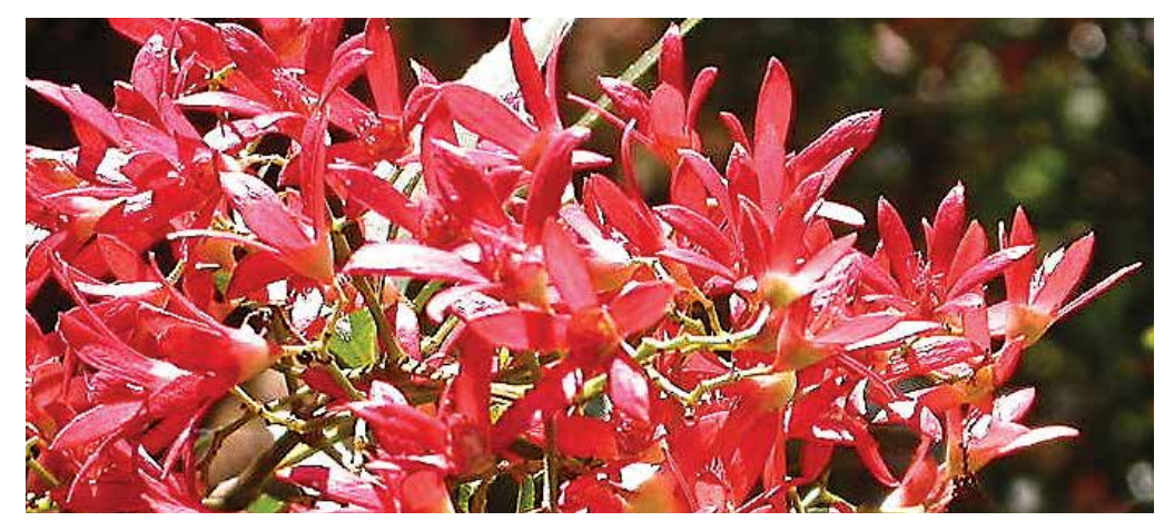
Ceratopetalum gummiferum Christmas Bush