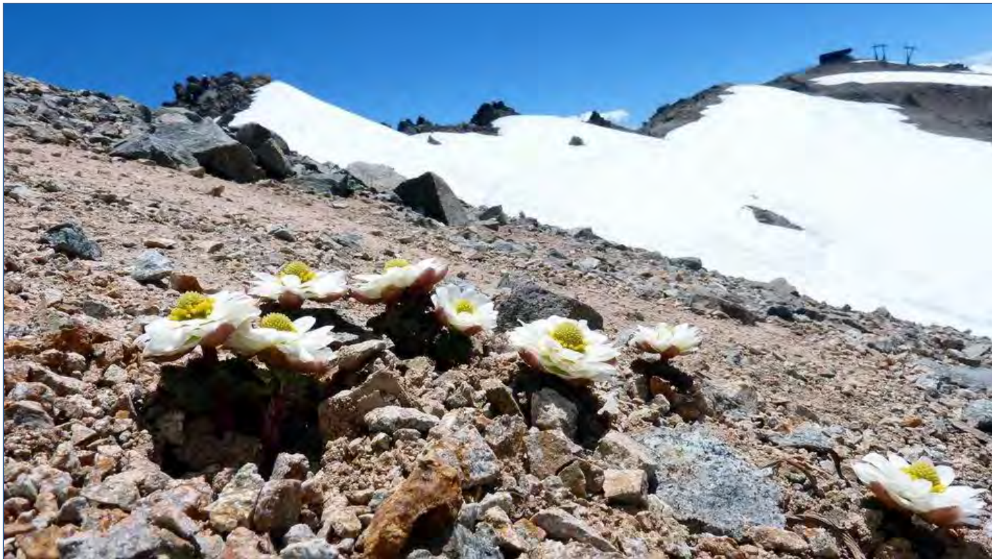
Ranunculus semiverticillatus flowering in nature.