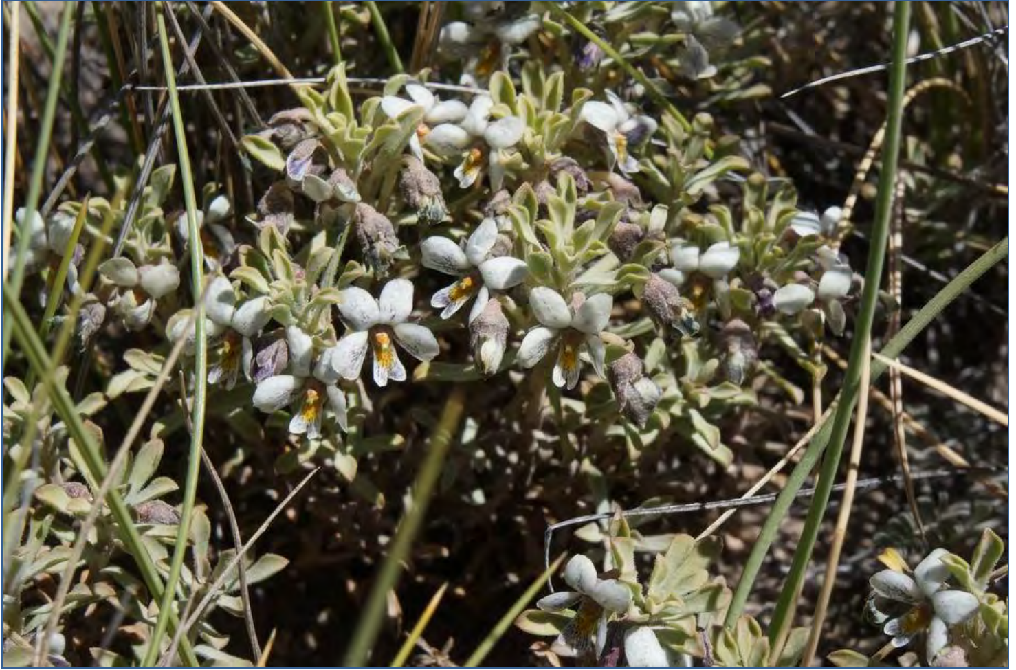
We found our third viola, Viola escondidaensis on this day.

On the 26th we went to the next town, San Martin de los Andes on the shore of Lago Lácar. The road went through Paso Cordoba, not very high but interesting. We found another population of V. volcanica . When we saw anything interesting from the bus windows we yelled to the bus driver and he had to find a place to stop. The locals certainly thought we were a bit "loco".