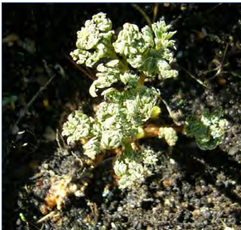
Left: R. semiverticillatus , photo by Lesley Cox of her plant.

It is a typical snowmelt species, just like the well known Ranunculus glacialis . They are both dependent on the melting water, rich in oxygen, at temperatures just above zero degrees, streaming along their rhizomes. Here in Patagonia, the surface of the soil was dry. You could easily lie down, taking pictures, without getting wet. The water was just below. The soil, eroded volcanic sand, ash and bigger stones only provides minerals. The long rhizomes have to keep the plants on this 45 degrees scree, which is always slowly moving down. They also provide water in dry periods and store food. After a short summer, the plants go dormant and during the long winter they are covered with snow.