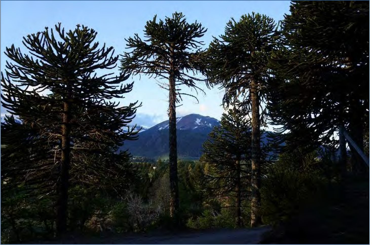
Araucaria by night