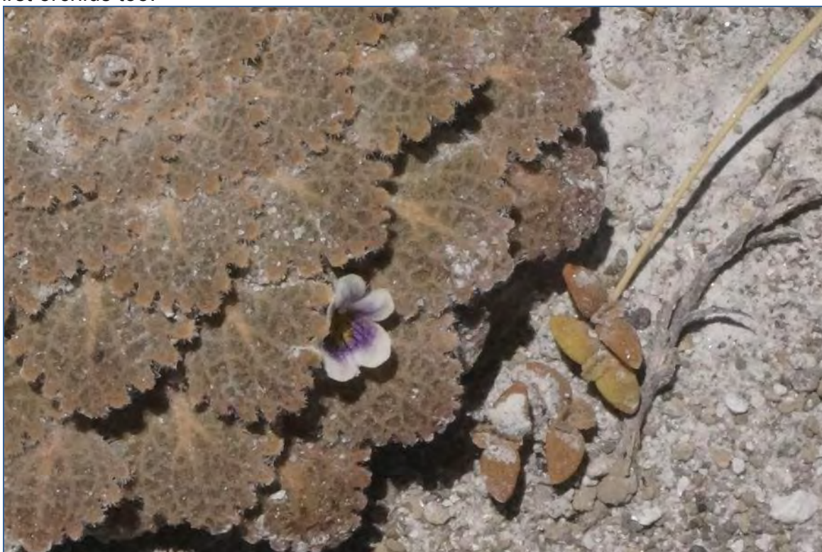
Viola volcanica , with seedlings alongside.

The next day we mostly hunted for plants along the road to Pilcaniyeu . Moving from the green, forested region by the lake and into the local steppe in the rain shadow just a few km along the road we found another viola, properly named V. volcanica growing in volcanic ash. Near a crossroad we also found our first orchids too.