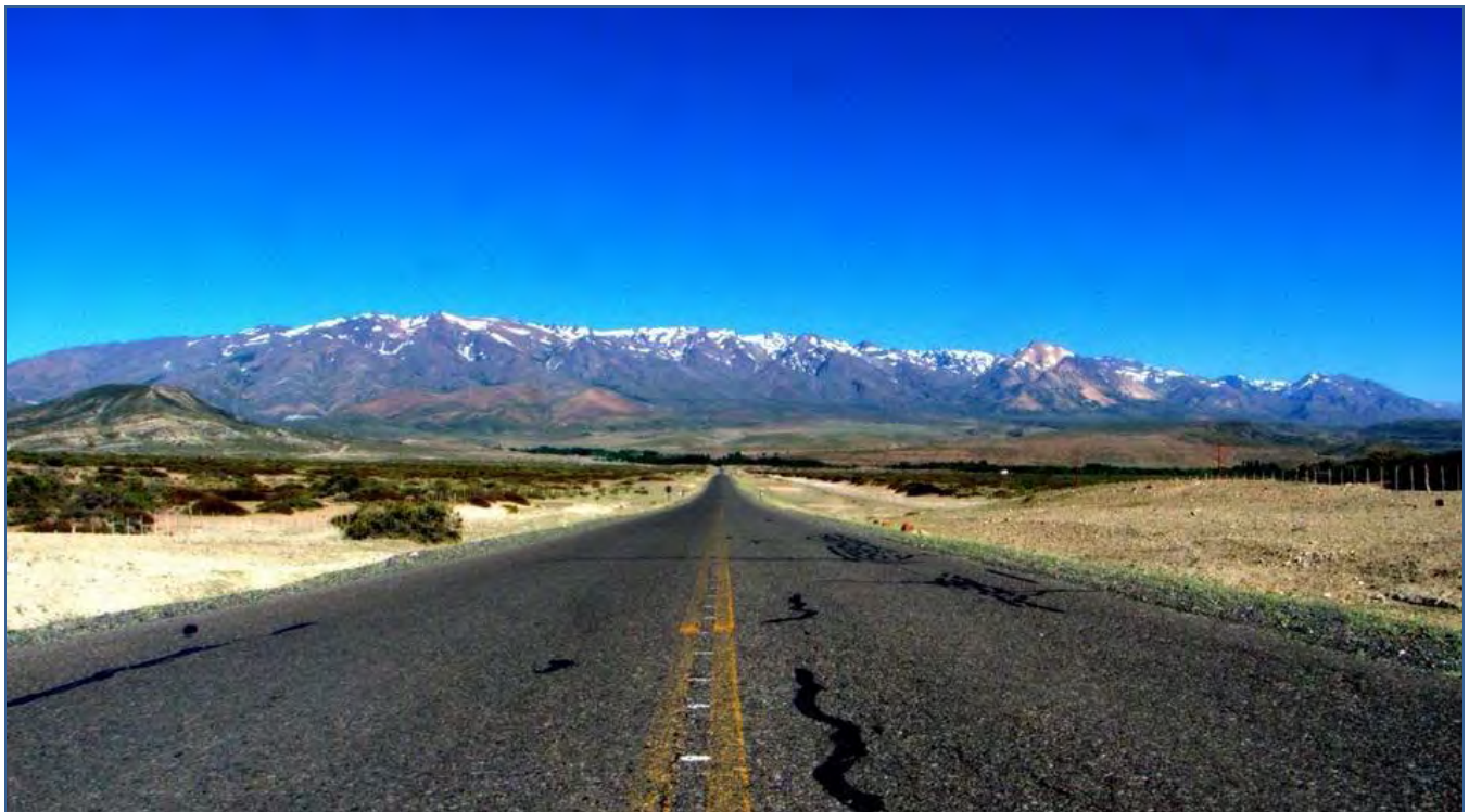
Road to nowhere.

For us, travellers, an endless paved road from north to south, thousands of kilometres. No beginning and no end. An upcoming car at the horizon, where the road meets the sky. Does it come, or does it go?