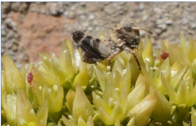
Colobanthus lycopodoides with assorted companions.