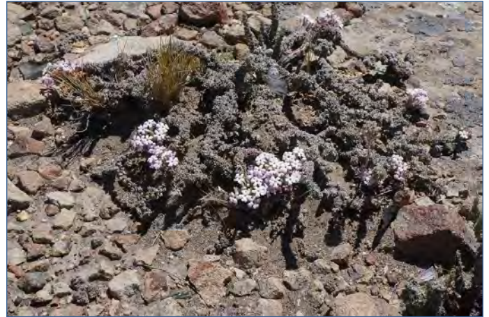
Above: Junellia patagonica Left: Viola trochlearis

December 3 rd : On the road again continuing in a northerly direction via Pino Hachado to Caviahue. Some of the main roads were paved but more often we went on unpaved dusty bumpy ones so the speed wasn't much to boast of. There was much of interest along the road of course, and as often happens, some want to stop and some don't! (Can't get to the hotel too late!)