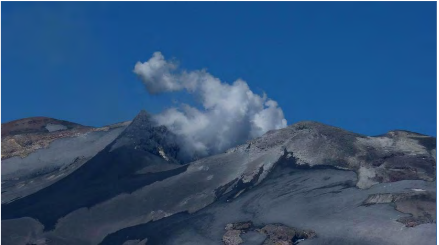
Volcán Copahue

December 3 rd : On the road again continuing in a northerly direction via Pino Hachado to Caviahue. Some of the main roads were paved but more often we went on unpaved dusty bumpy ones so the speed wasn't much to boast of. There was much of interest along the road of course, and as often happens, some want to stop and some don't! (Can't get to the hotel too late!)