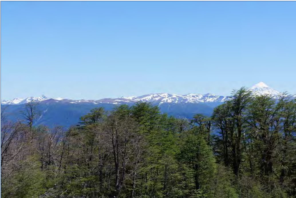
Left: Nothofagus pumilo

On the 26th we went to the next town, San Martin de los Andes on the shore of Lago Lácar. The road went through Paso Cordoba, not very high but interesting. We found another population of V. volcanica . When we saw anything interesting from the bus windows we yelled to the bus driver and he had to find a place to stop. The locals certainly thought we were a bit "loco".