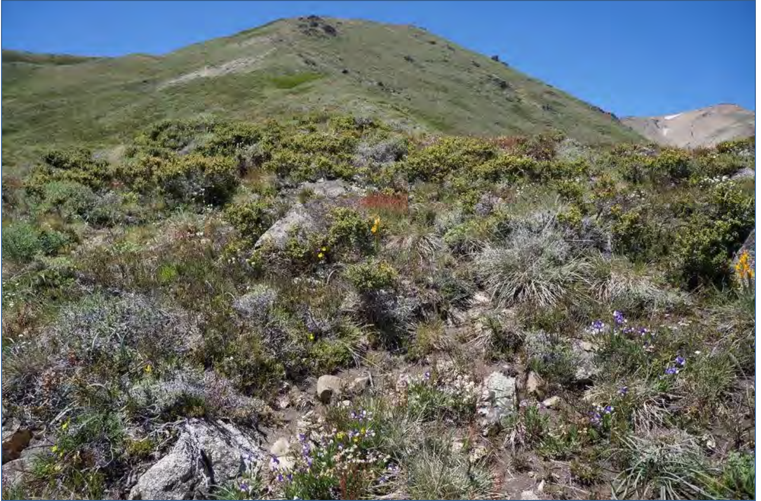
Ridge of Cerro Colohuincul