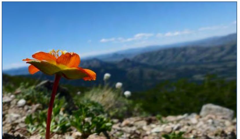
Calandrinia caespitosa subsp. skottsbergii