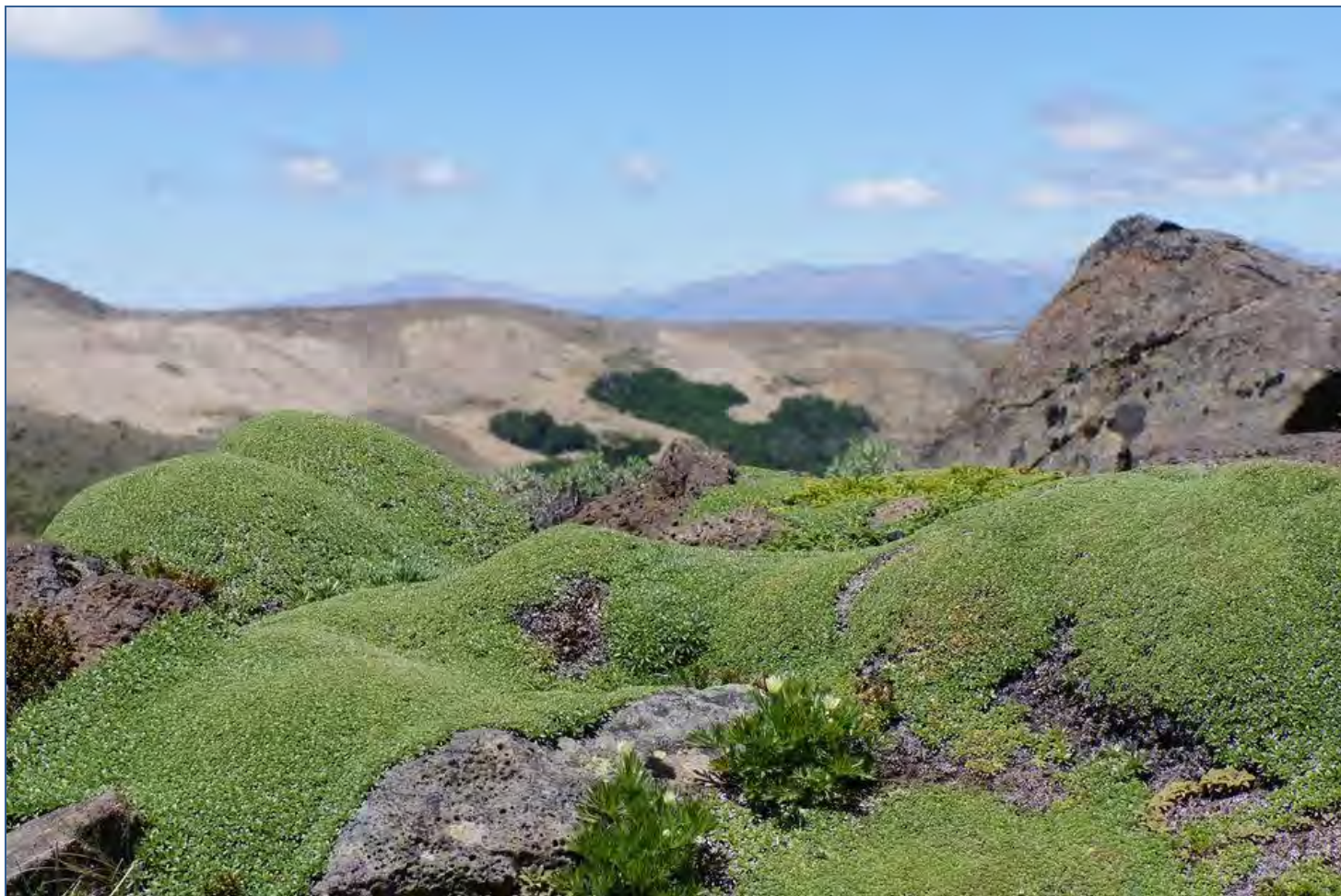
View from Batea Mauida

I have not included all the names of the plants we found but selected a few ones to give you a taste. If some plants are wrongly named it is my fault.