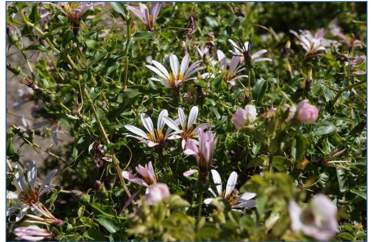
Above: Maihuenia poeppigii , right: Mutisia spinosa , above and below left. Below right: Batea Mahuida