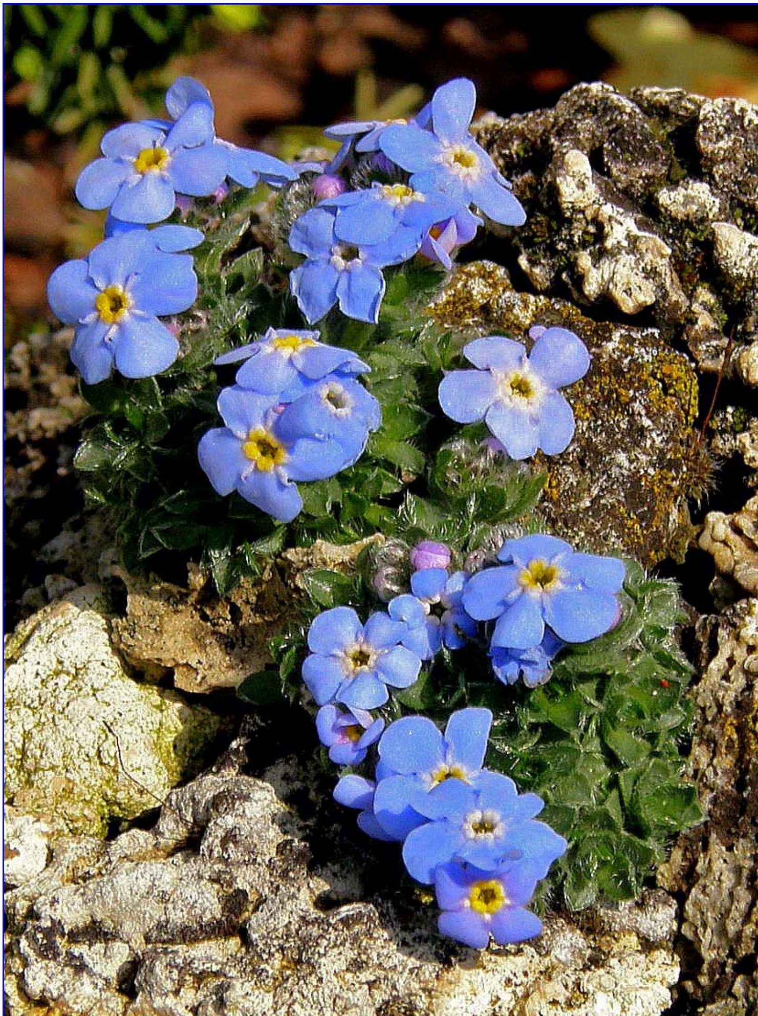
Eritrichium cushion in tufa rock