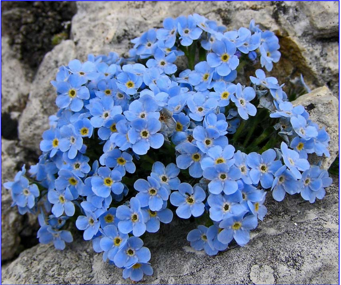
Eritrichium nanum at Passo Rolle