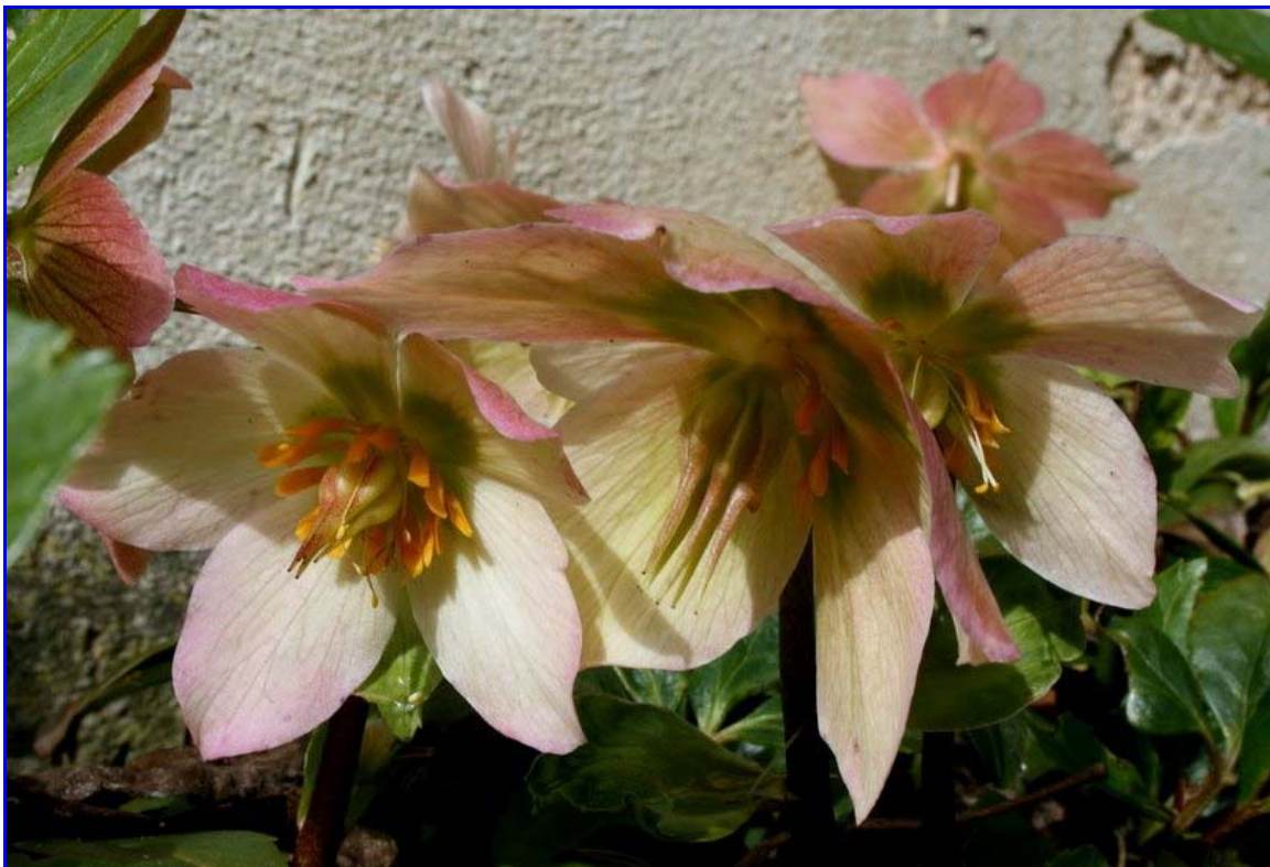
H. niger , form from seed collected under Mt. Grigna Septentrionale, Italy

Helleborus niger is able to grow and flower (from winter to spring) in a deep crevice in full sun. Last year I admired Italian form, which is changing colour of petals during their aging.