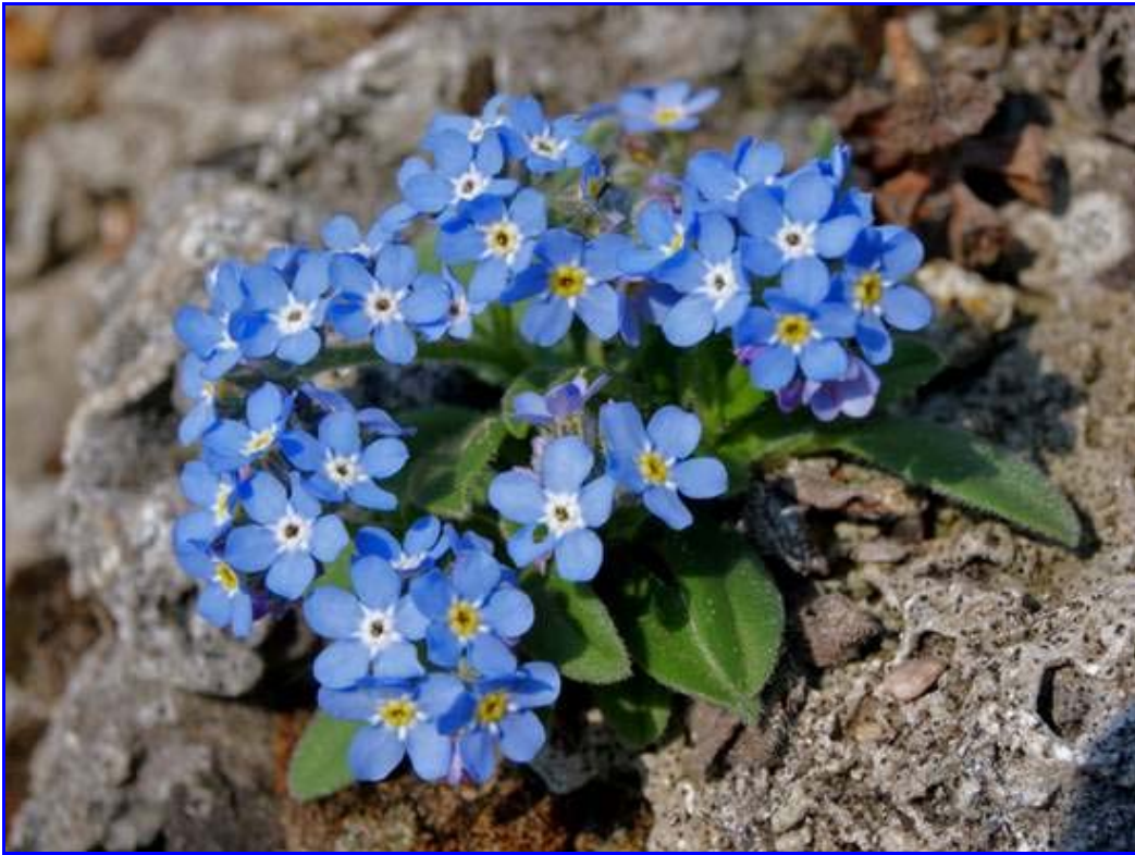
Myosotis alpestris in tufa

Ten years ago Zdenek Rehacek from the highland of Eastern Bohemia, selected one seedling of Myosotis alpestris and planted it into hole in tufa stone. Now this selected plant is stemless and up to 3 cm tall and 8 cm in diameter, looking similar to some Eritrichium . Fortunately, seedlings keep this same dwarf habit.