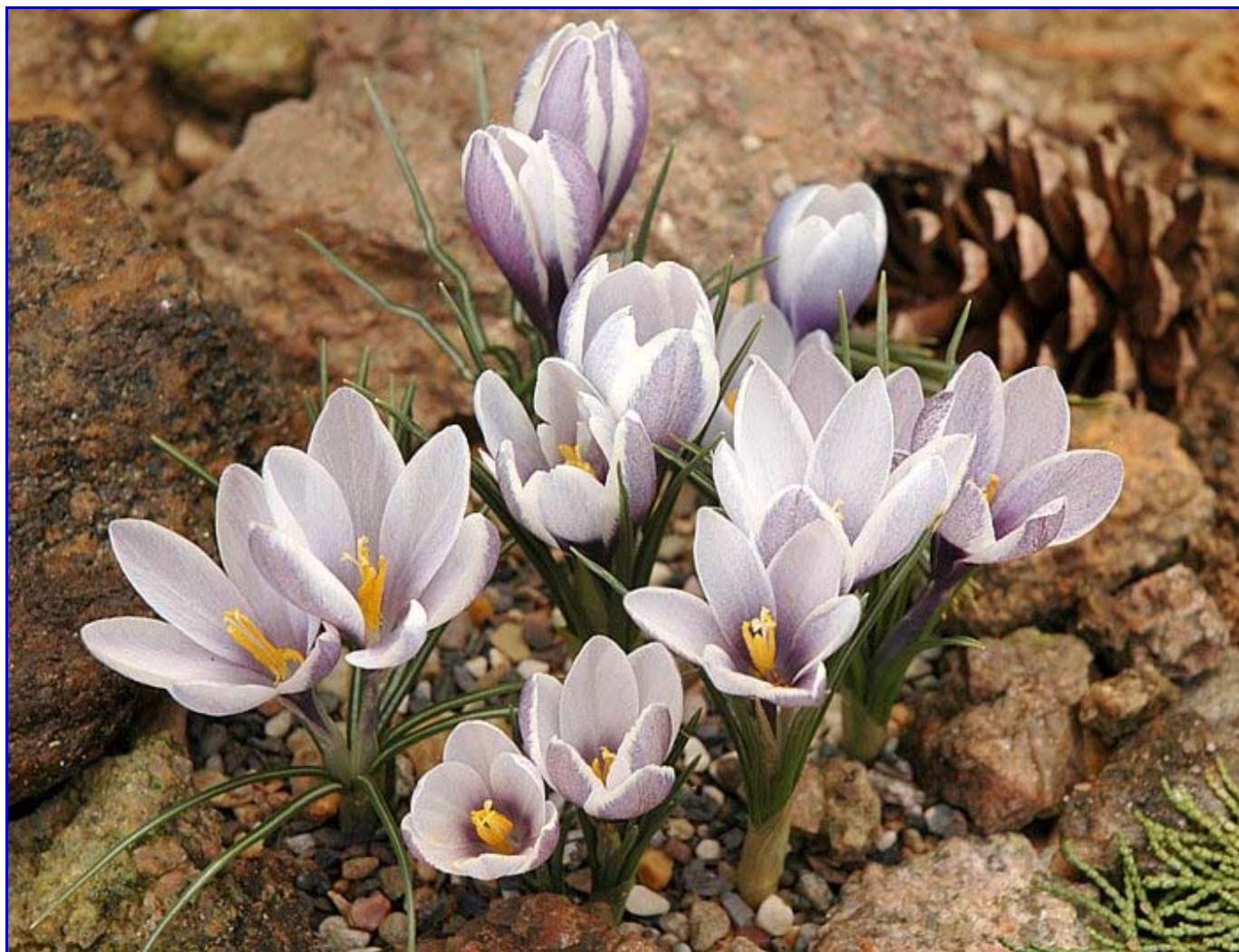
Crocus michelsonii in cultivation on 27.3.2006