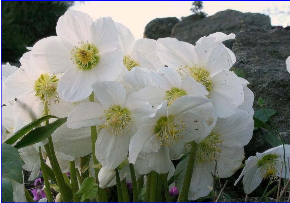
Helleborus niger - old cultivar with large 'Potter Wheel' flowers