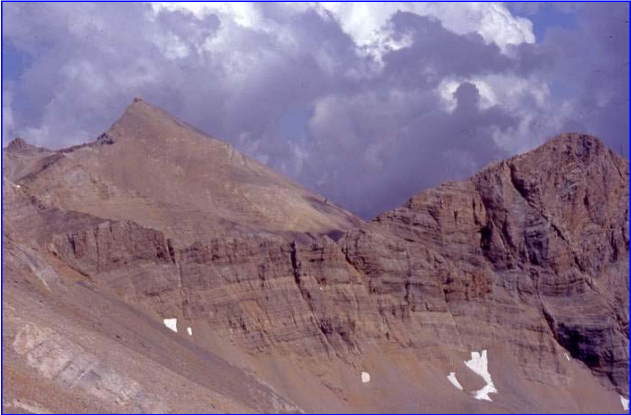
Mt. Medetsiz, highest peak of the Bolkar Dag