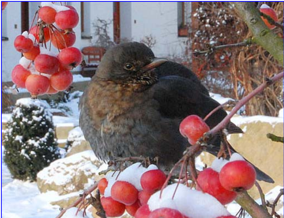
A Moravian Bird