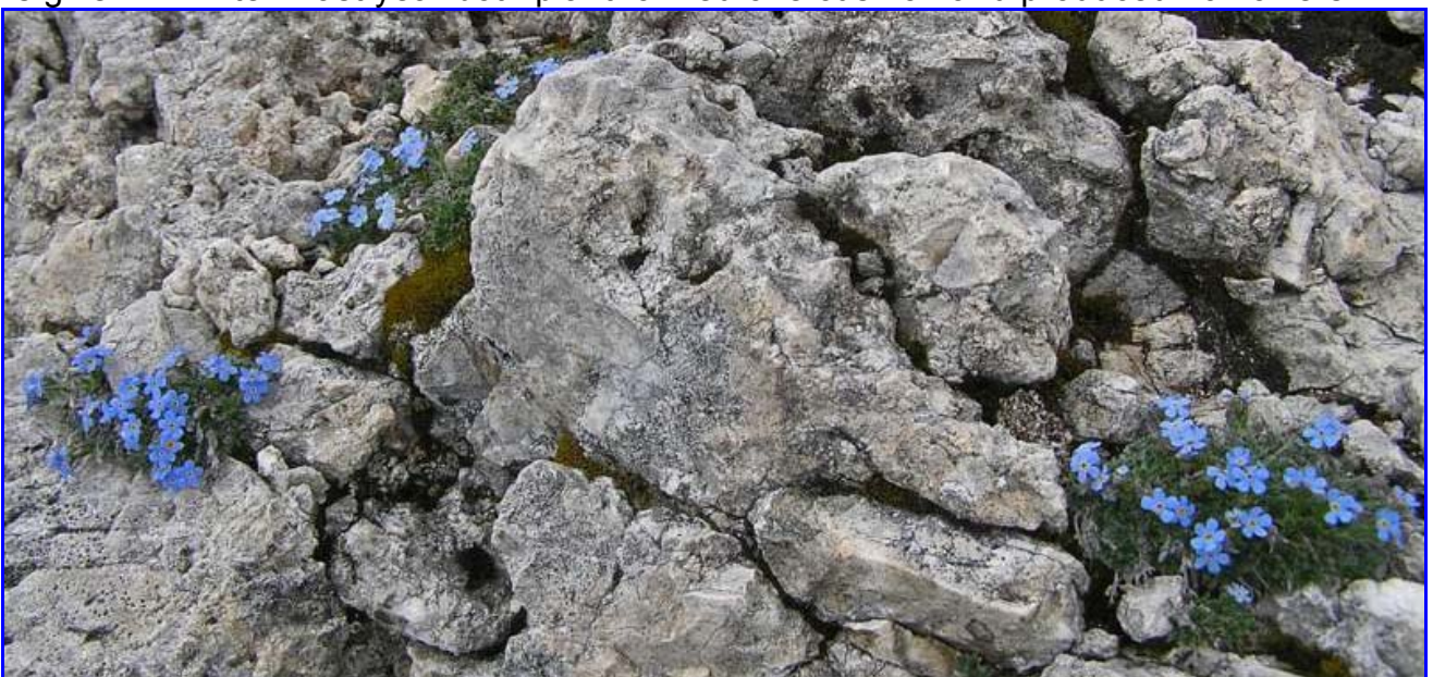
Eritrichium at the Passo Rolle

Jiří Novák gardens in the lowland of Eastern Bohemia. His Eritrichium nanum is a rooted sample from Passo Rolle. He has grown two cuttings in tufa for 4 years in north-eastern exposure in his rock garden; the stone is shaded with green net during hot summer days. A cover with a sheet of glass is given in winter. Last year both plant formed one cushion and produced 20 flowers.