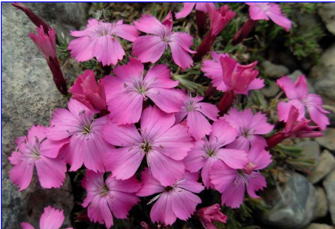
Difficult plant in lowland, the true alpine Dianthus brevicaulis Mojmir Pavelka

Higher, there was only Dianthus brevicaulis and Draba acaulis . In August 2008 he visited a more well known locality above Black Lake (Kara Gol) at 2800 m where you can see this species in three different habitats: northern slope with mineral slightly limy soil, southern slope in an association with grasses and at the banks of small brook (dry in summer) with primulas. Because of the dry season, flowers here were a paler blue. In normal conditions stems are about 5 cm long and their blue-purple flowers are 3-5cm long. Similar to all high mountains, Bolkar Dag covers itself every afternoon in clouds and the nights here are close to frost. This is the reason that the plant does not like baking in our lowland gardens.