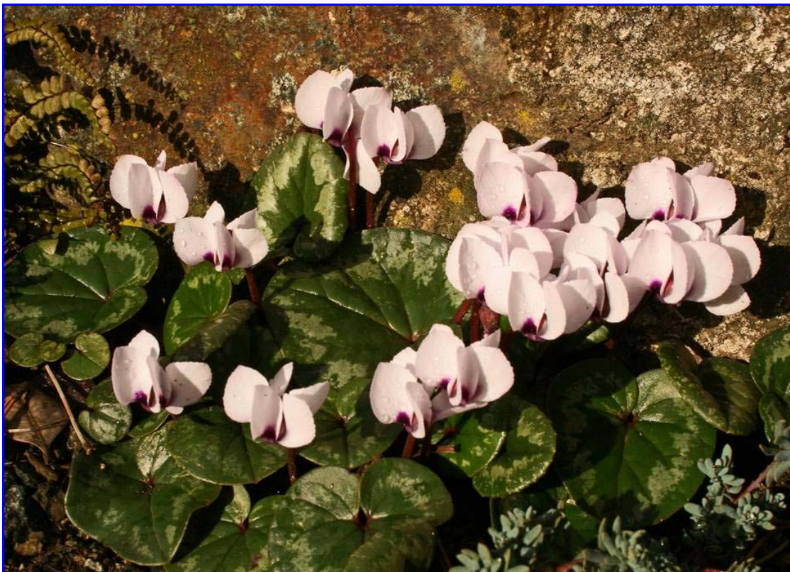
Cyclamen coum f. atkinsii

Zdenek, with help of Joyce, will inform you all year round about our rock garden plants.