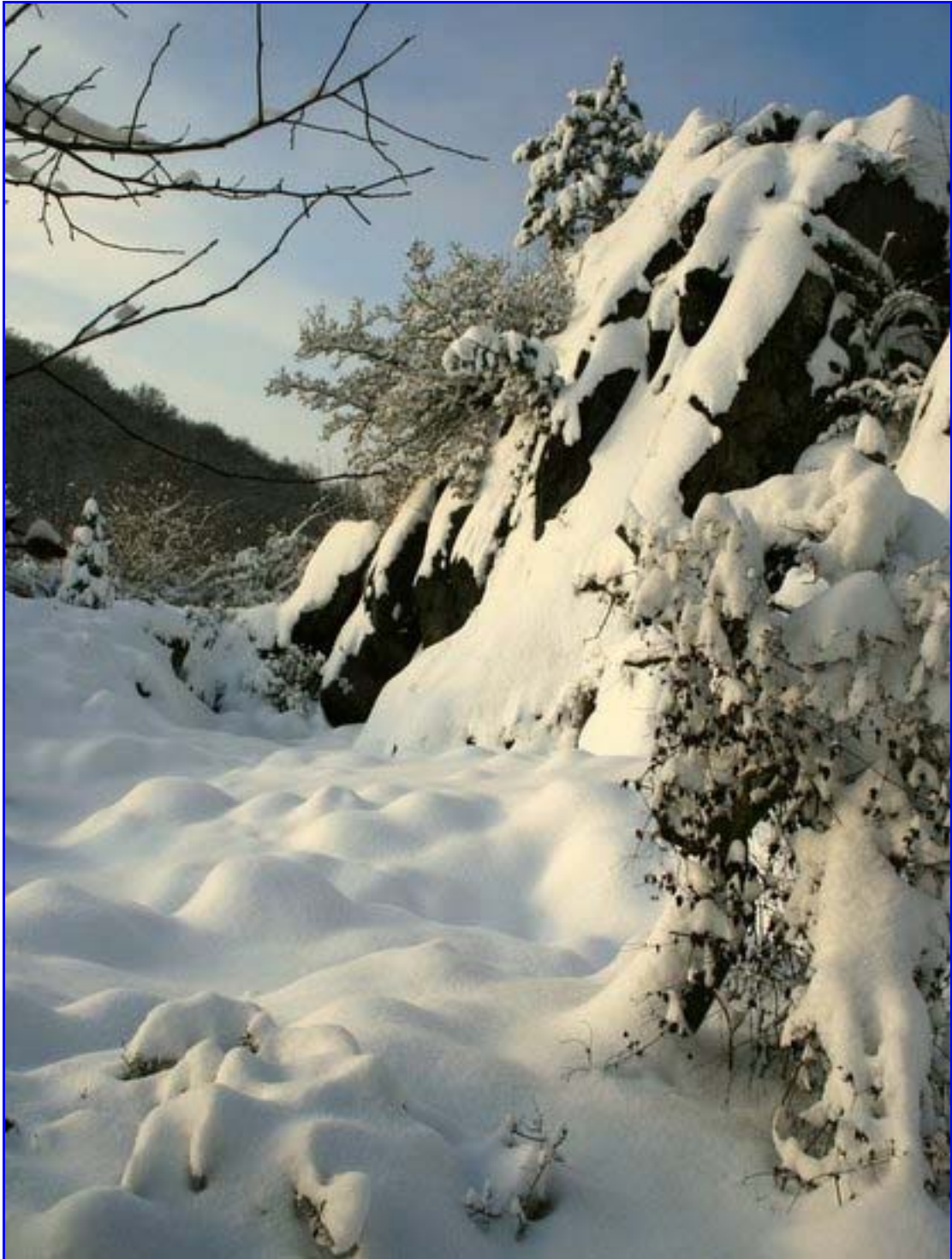
Rock Garden under snow cover

The Beauty Slope is local name for steep southern facing terrain south of Prague. In one part there was an ancient vineyard owned by monks, and in one corner the monks also had a quarry for dolerite, a fine-grained igneous rock. This corner is rented from the “Czech Forests” enterprise by Joyce Carruthers and Zdenek Zvolánek who maintain a quite extensive rock garden here.