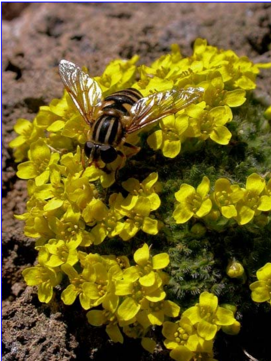
Draba acaulis on tufa, with an insect