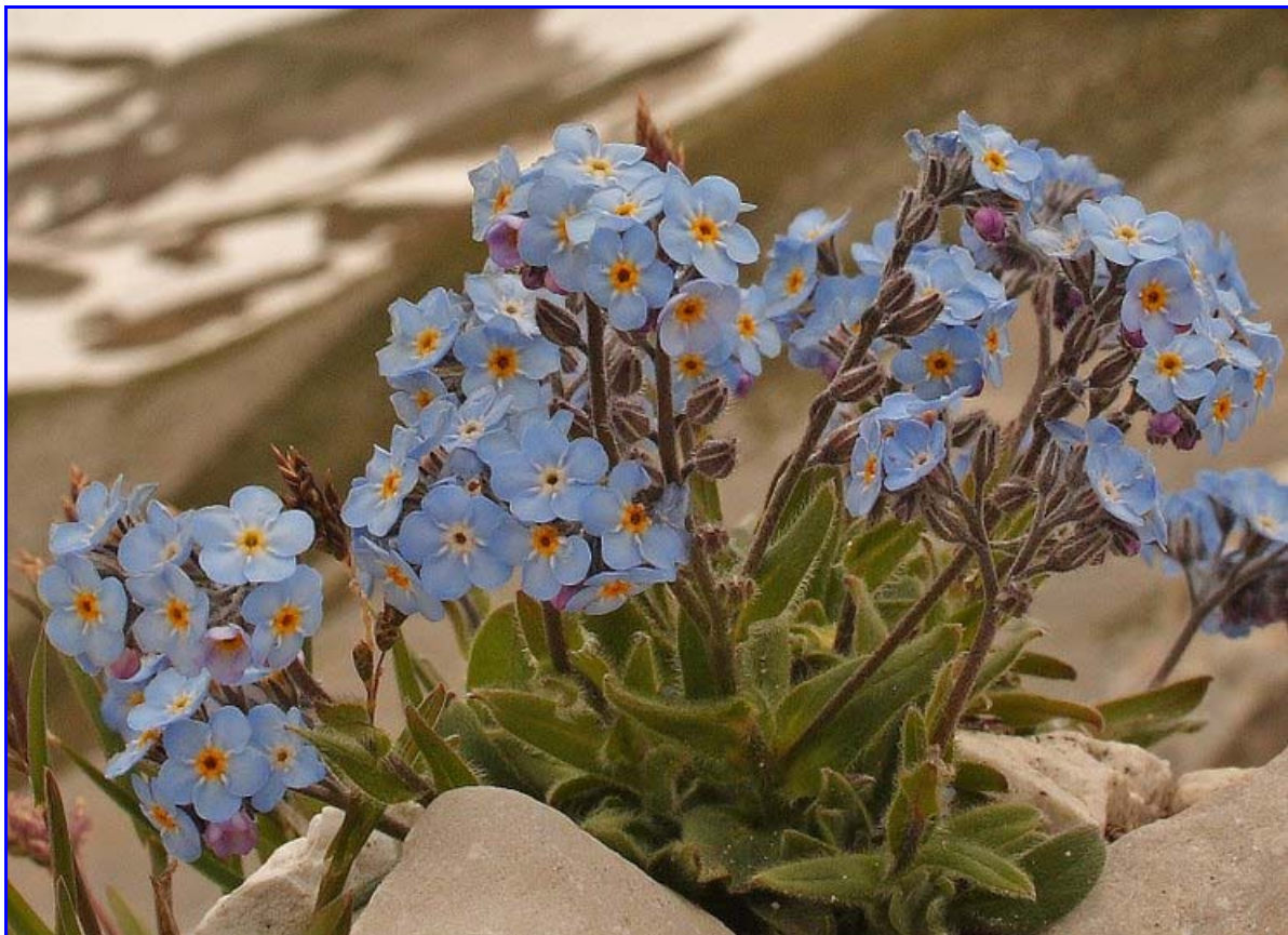
Myosotis alpestris in Gran Sasso, Italy