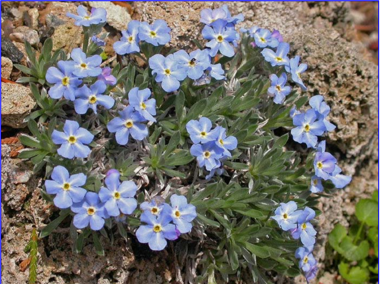
Eritrichium howardii 'Blue Sky'