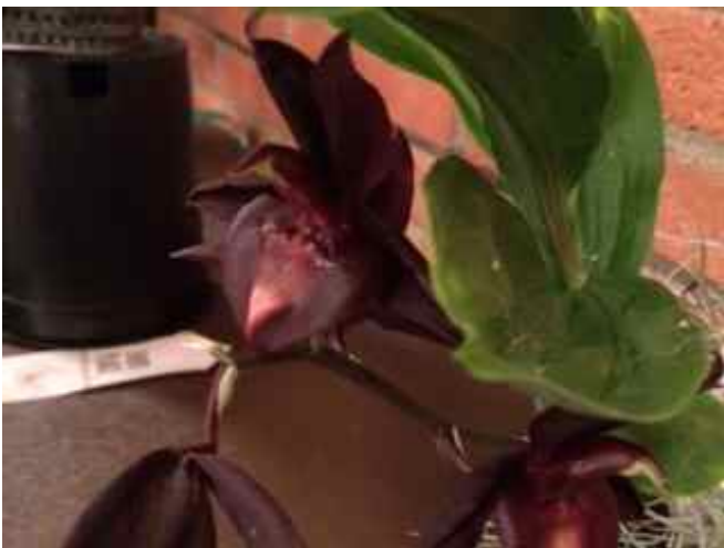
Cstm. Ten Dragons x sib