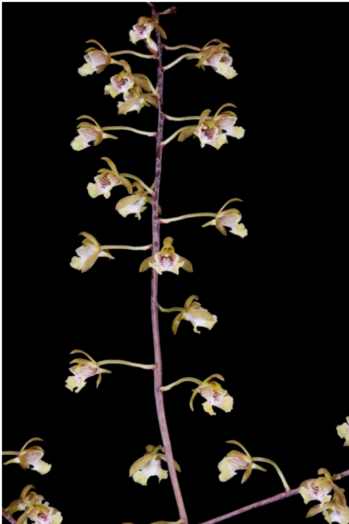
Oeceoclades peyrotii 'Huntington's Splendor'

Exhibited by Huntington Botanical Gardens