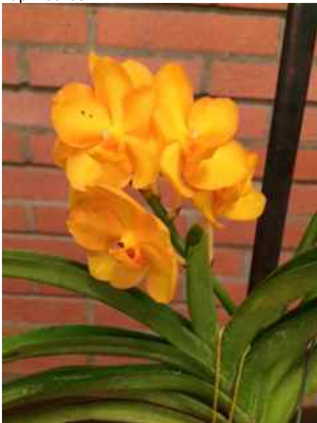
Ascda. SW Starlight