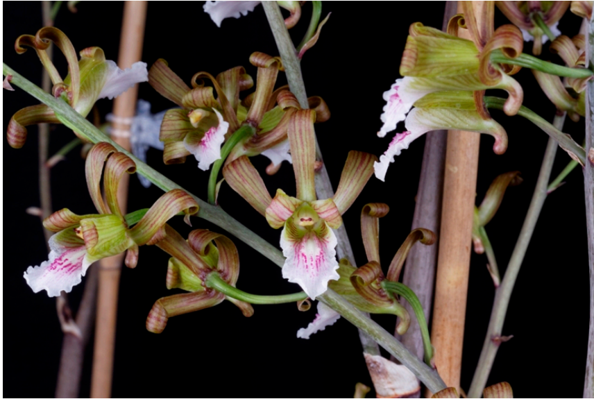
Eulophia petersii 'Kathy Nguyen'