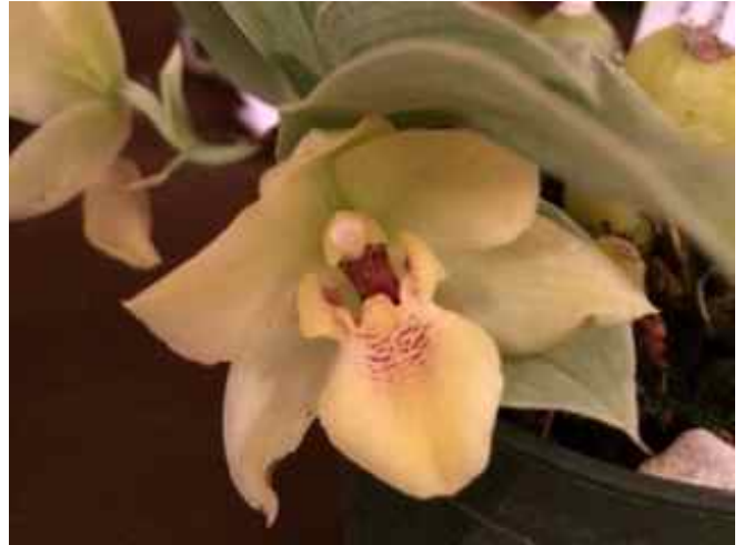
Promenaea (Limelight x Crawshayana 'Springtime')