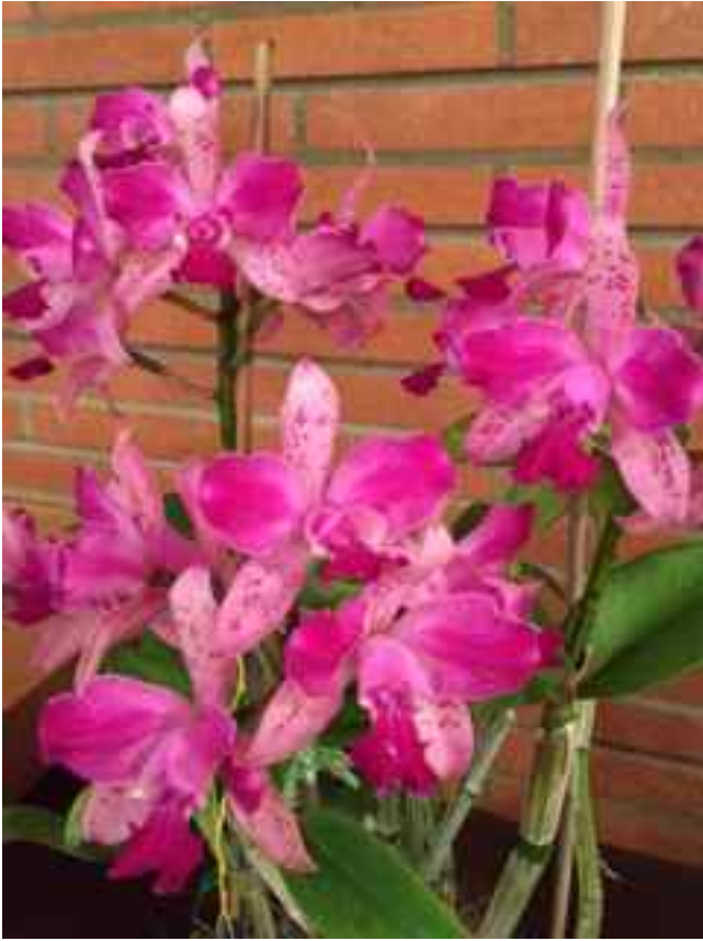
Cattleya Penny Kuroda 'Spots'