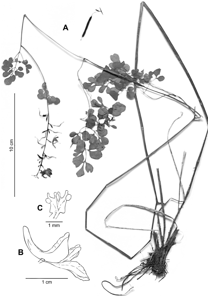
Fig. 2. Corydalis pterygoteta subsp. macrocarpa (from the holotype).— A: Flowering plant and fruit.— B: Flower.— C: Stigma.