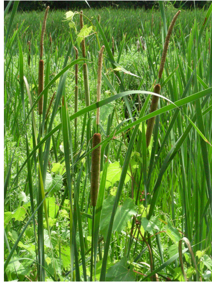
Photo of hybrid cattails on the Erie Canal

An emergent plant is a plant that grows with roots in standing water and its flowering part above the water.