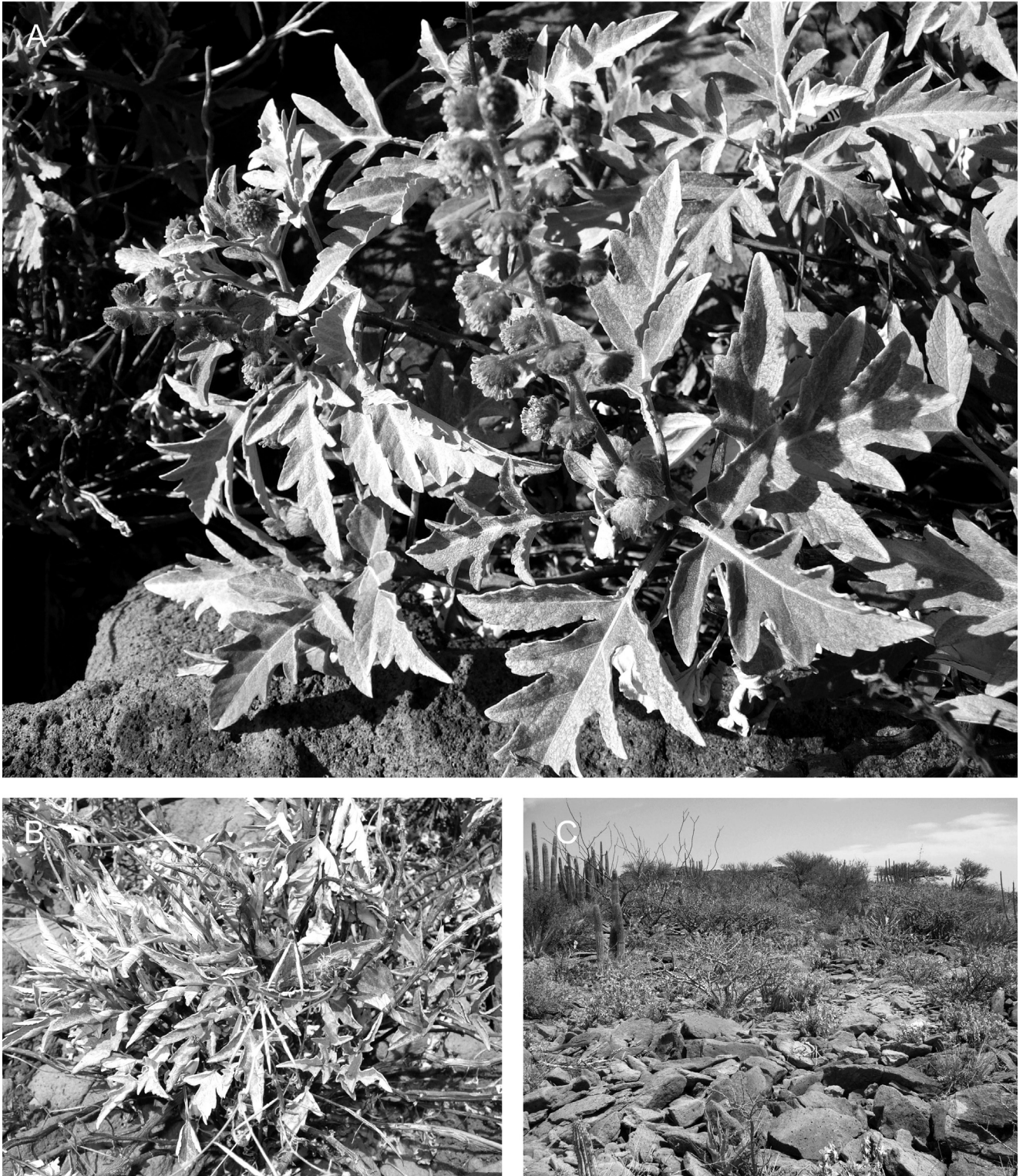
Figure 1. Ambrosia humi León de la Luz et Rebman. A. Plant in bloom (14 Jan 2008). B. Fruiting plant (20 March 2009). C. Habitat in the rocky Mesa de Humí.