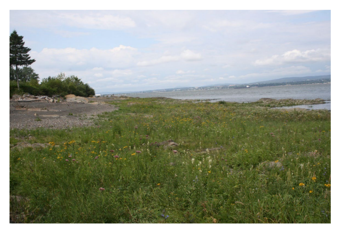
Figure 3. Typical habitat of Victorin's Gentian in an upper marsh.