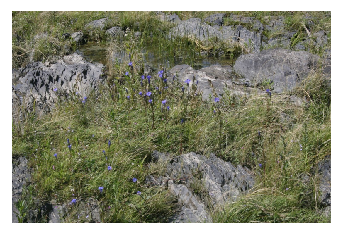
Figure 4. Rocky habitat of Victorin's Gentian.