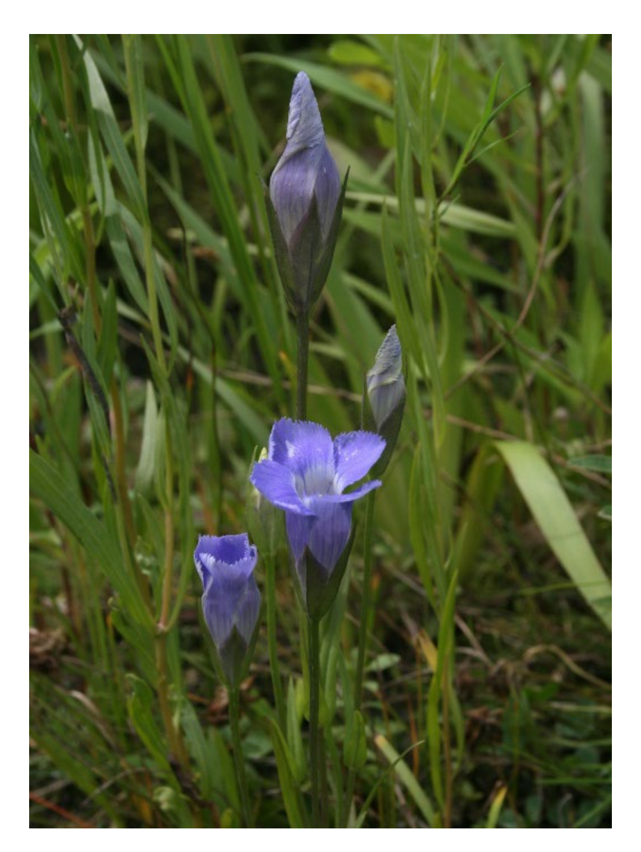
Figure 1. Victorin's Gentian in flower, with floral buds.

The subspecies is an herbaceous annual, winter annual or biennial, 10-50 cm tall, growing from a small taproot, relatively unbranched (Figure 1); stem glabrous, simple or branched 1-2 times. The stem leaves are opposite, fleshy, and linear-lanceolate. The flowers are deep blue or rarely white, 1-30; four sepals cleft for nearly half their length, two lanceolate, the other two ovate and shorter; corolla 3.5-4.5 cm long at maturity, four lobed, the lobes, finely dentate on the apex and very slightly lacerate at the margin; fruit a 3-3.8 cm long capsule with approximately 400 papillate brown seeds per fruit (Coursol 2001).