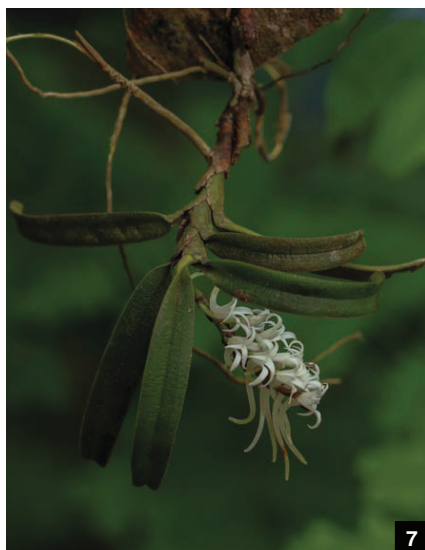
7 VINCENT DROISSART