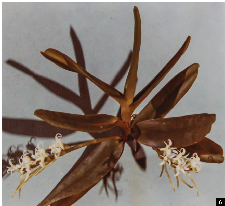
6 ROYAL BOTANICAL GARDEN, KEW