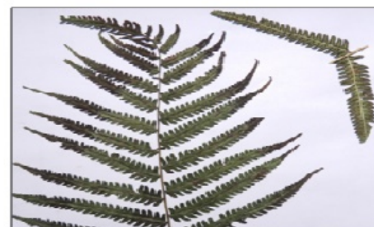
Fig. F: Thelypteris dentata (Forsk.) John