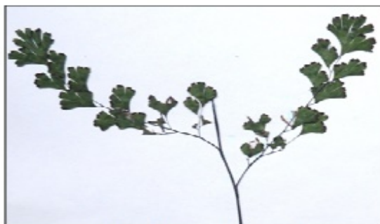
Fig. A: Adiantum capillus-veneris L.