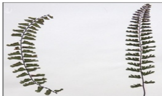
Fig. B: Adiantum incisum Forskal