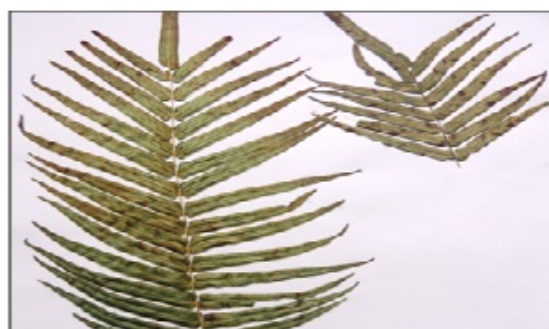
Fig. C: Pteris vittata L.