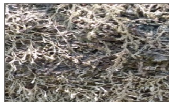
Fig. D: Selaginella chrysocephala (Hook. & Grev.) Spring