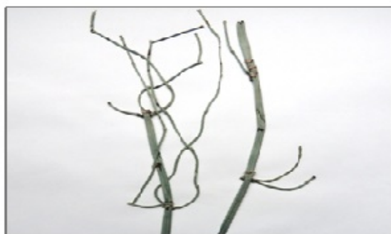
Fig. A: Equisetum ramosissimum Desf.