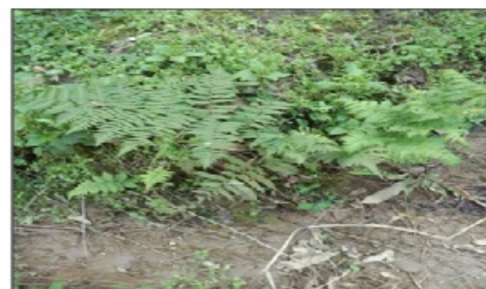
Fig. D: Athyrium attenuatum (Wall, ex Clarke) Tagawa