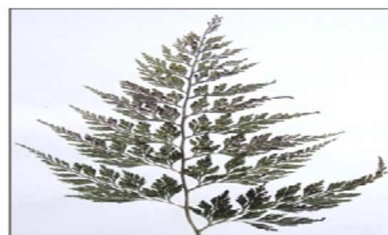
Fig. F: Onychium plumosum Ching