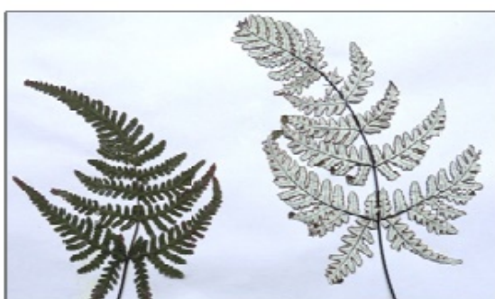
Fig. E: Cheilanthes bicolor (Roxb.) Fraser-Jenkins