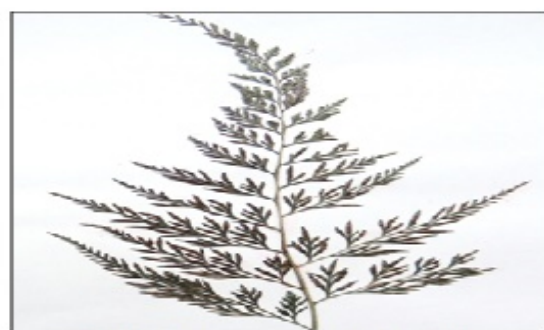
Fig. E: Onychium contiguum Wall. ex Hope