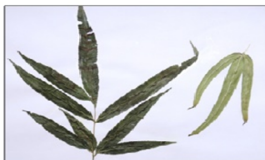
Fig. B: Pteris cretica L.