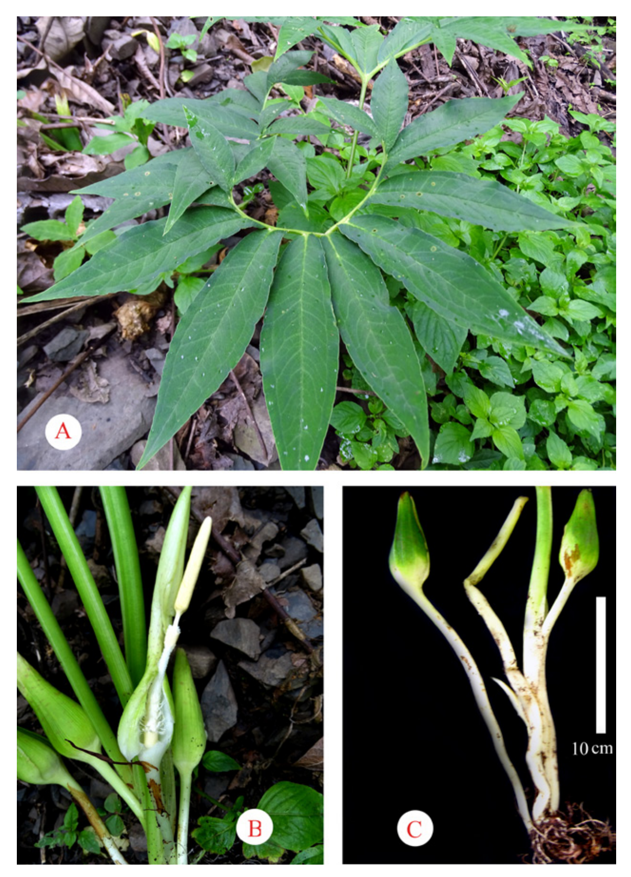
Plate 1. Sauromatum horsfieldii Miq.: A. Plant in situ; B. Inflorescences; C. Lower half of Plant.