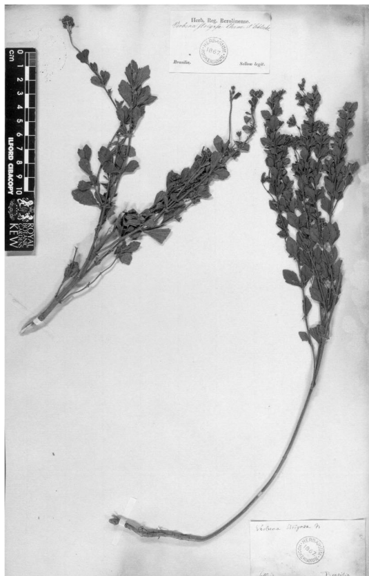
Fig. 2. Sellow collection lectotype of V. strigosa Cham.

Troncoso (the handwriting matches hers). This specimen was here chosen as neotype.