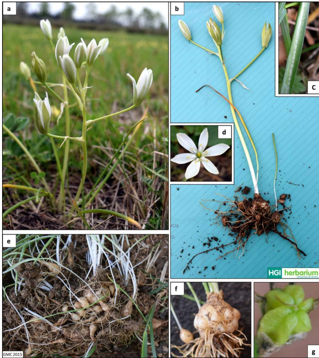
Fig. 3. Ornithogalum umbellatum : a , habit of the epigeal part with bracts longer than half of the length of the lowermost pedicels; b , habit of complete plant showing inflorescence with few flowers, basal pedicels erect and bulb with bulbils, some with well developed leaves; c , leaf bearing a central, longitudinal white or translucent band; d , apical view of flower; e , bulb with numerous bulbils bearing leaves; f , detail of the bulb surrounded by numerous bulbils; g , apical view of capsule showing six equidistant ribs [a, b, HGI 22702; c, e, HGI 22701; d, f, g, HGI 22699].