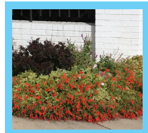
Great non-invasive groundcover