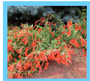
Thrives in dry, rocky soils