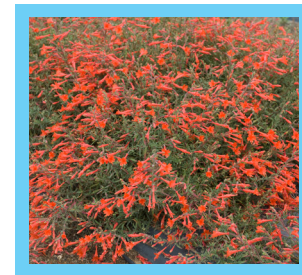
Wonderful low-growing mounding habit