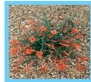
Scarlet orange trumpet shaped blooms