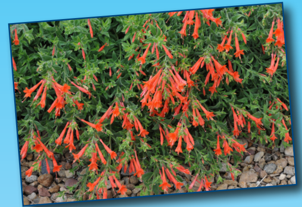
Creeping Hummingbird Trumpet Groundcover (Zauschneria garretti Orange Carpet®)