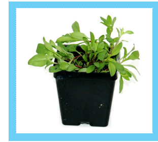
Orange carpet® Shipped as Shown