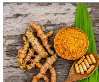
Fig 1: Turmeric

Kingdom: Plantae Subkingdom: Tracheobionta Superdivision: Spermatophyta Division: Magnoliophyta Class: Lilliopsiada Subclass: Zingiberidae Order: Zingiberales Family: Zingiberaceae Genus: Curcuma