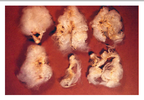
Figure 6. Infection of cotton bolls causes premature opening, resulting in discoloration of cotton from entry of secondary saprophytic microorganisms.