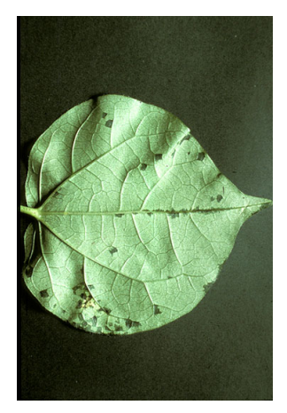
Figure 1. Early stage of disease on a cotton leaf with water-soaked leaf spots and water-soaking along the veins.