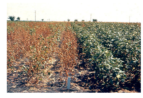
Figure 4. Cotton field exhibiting black arm stage of the disease of susceptible (left) and resistant (right) varieties.