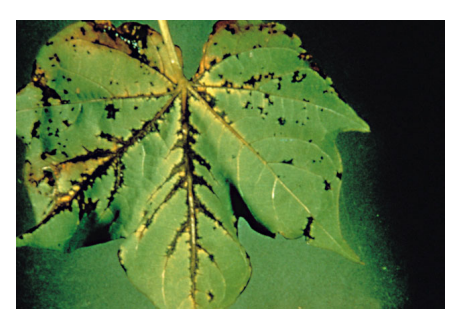
Figure 2. Angular leaf spots and blackening along midribs.