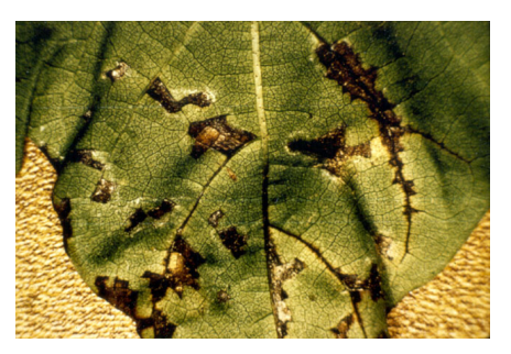
Figure 3. Late stage of angular leaf spot.