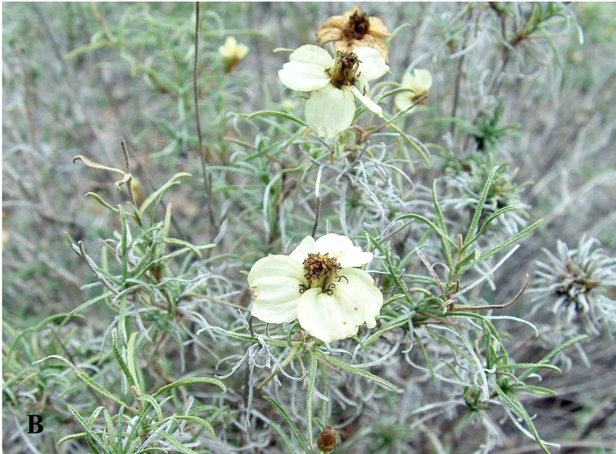
Figure 3a, b. Zinnia austrotexana at the type locality in Starr County, Texas.