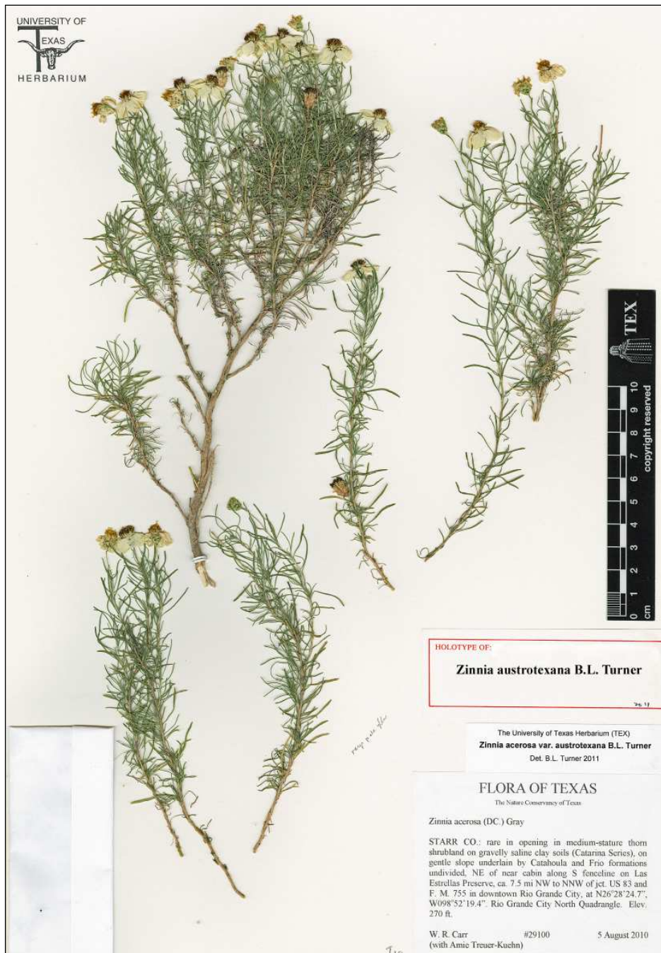
Figure 2. Zinnia austrotexana , holotype TEX.

In the fall of 2011, in company with Jana Kos, I revisited the two sites from which specimens of Zinnia austrotexana were gathered much earlier, but we were unable to relocate the taxon, perhaps due to the unusual drought conditions of that year but surely also to the considerable disturbances at the sites concerned. The Starr County location is now an assemblage of roadside houses.