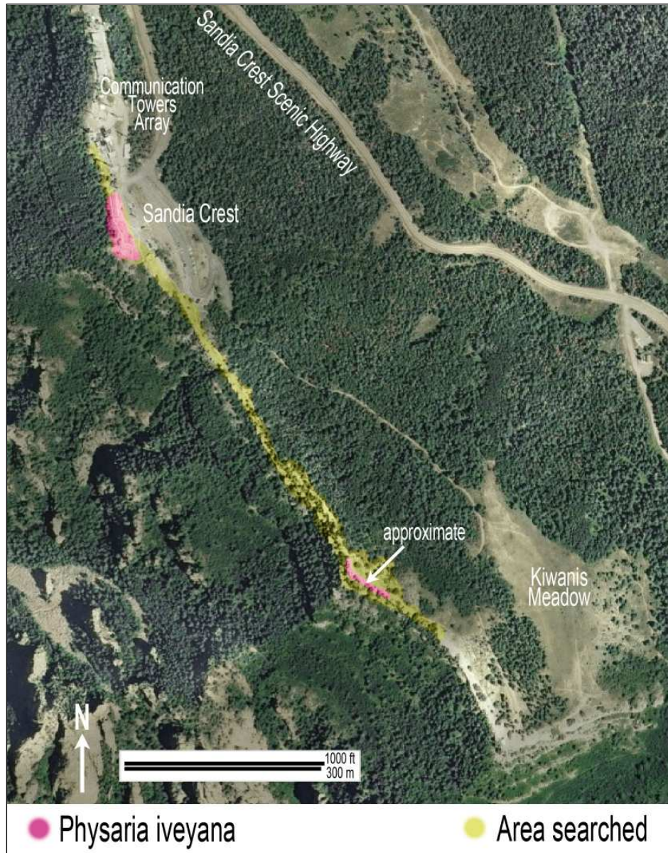
Figure 2. Locality of type collection and additional local area searched. Image from Google Earth

of drawing of species which cleverly focused in on the most important characters for identification. In 2008 the greatly expanded fifth edition was published, illustrating more than one third of the species known for the state. Flowering Plants of New Mexico is likely the most consulted plant identification reference in the state and is used as a text in the Flora of New Mexico course at the University of New Mexico. Ivey has given numerous talks, workshops, and field trips throughout the state. His work has done much, perhaps more than any other, to stimulate interest in the plants of New Mexico and their appreciation and preservation.