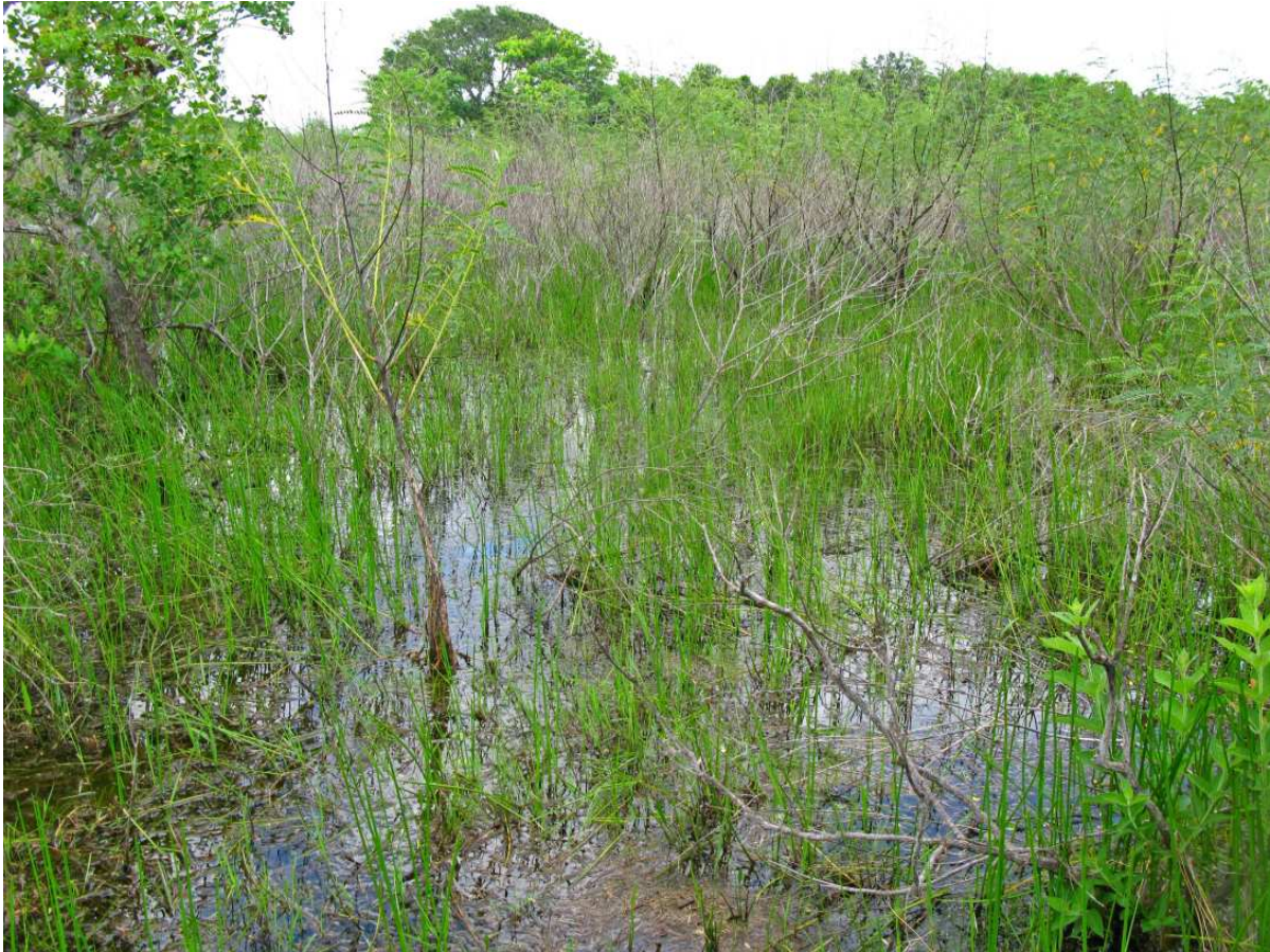
Figure 4. Freshwater depression pond at the type locality on the Falcon Point Ranch in Calhoun County.

Presently, Isoetes texana is known only from Aransas and Calhoun counties. It is limited to freshwater ponds and interdunal swales in neutral to moderately alkaline sands of Pleistocene and to Holocene barrier islands in the Gulf Coastal Bend of southern Texas. The vegetation is dominated by Rhynchospora spp., Fuirena spp., Eleocharis spp., and Cyperus spp. The dominant species include Fuirena scirpoidea , Fuirena longa , Rhynchospora microcarpa , and Rhynchospora divergens . Other characteristic and common species include Rhynchospora nitens , Cyperus oxylepis , Cyperus polystachyos var. texensis , Eleocharis geniculata (= Eleocharis caribaea ), Eleocharis flavescens , Eleocharis montevidensis , Eleocharis parvula , Xyris jupicai , Agalinis fasciculata , Bacopa monnieri , Buchnera americana (= Buchnera floridana ), Oldenlandia uniflora (= Hedyotis uniflora var. fasciculata ), Spiranthes vernalis , Drosera brevifolia , and Utricularia subulata . This plant community association occupies sandy depressions of variable hydrology. Some ponds draw down and desiccate in drier periods, but Isoetes texana seems restricted to those that hold water throughout the year (based upon limited observations). Structure varies with depth of water (or depth to water table) and frequency of inundation, and composition ranges from a sparse cover of tufted annuals to complete coverage by rhizomatous perennials.