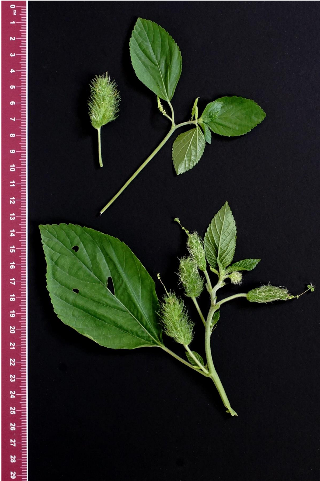
Figure 1. Acalypha arvensis from a greenhouse in Madison Co., Kentucky (Adanick 586, EKY).