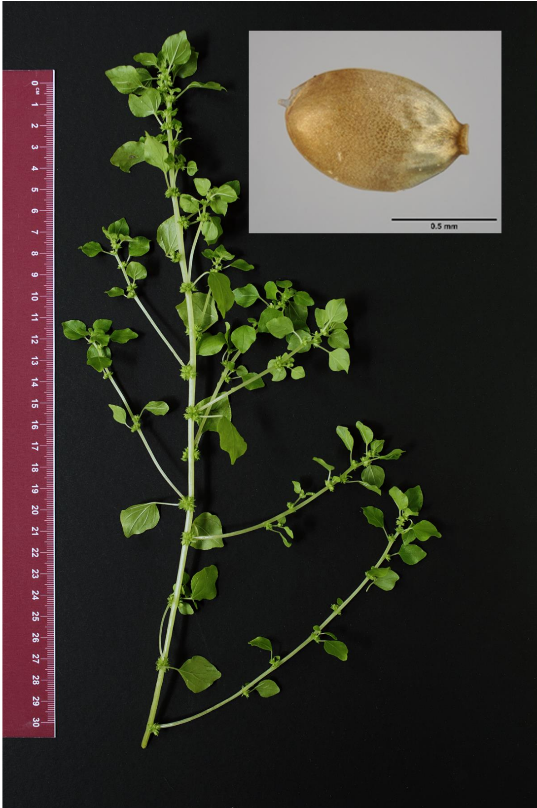
Figure 3. Parietaria floridana from a greenhouse in Madison Co., Kentucky (Adanick 20.100, EKY). Inset: achene with flanged stipe.