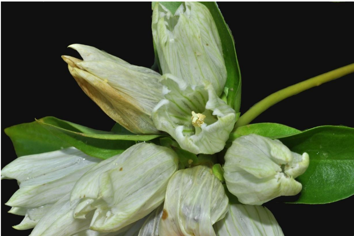
Figure 6 Gentiana flavida terminal inflorescence of partially open corollas adapted to bumblebees (Thompson 17-480, BERA).