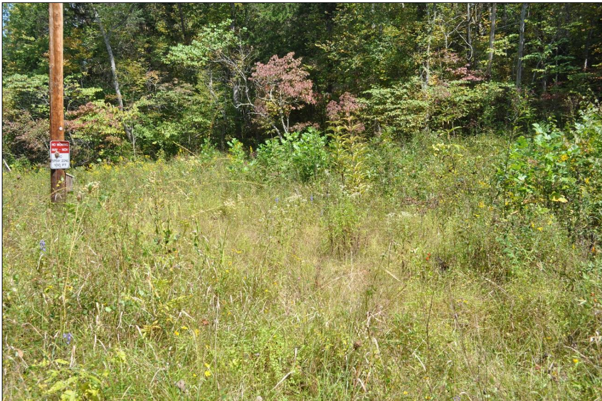
Figure 1. Gentiana flavida in Jean's Glade, among foreground mesic prairie inclusion meadow and background subxeric mixed hardwood-red cedar forest edge.

Gentiana flavida is native to eastern North America in the midwestern and eastern USA and Ontario, Canada (Pringle 1963, 1967, 2017; Kartesz 2015; NatureServe 2017; Figure 2). Cream gentian populations are imperiled throughout much of their distribution range because of extreme habitat losses primarily from anthropogenic disturbances, forest expansion, absence of fire, and invasive grasses and forbs. The overall decline of eastern populations has been affirmed, and the continued existence of peripheral populations surviving as isolated prairie remnants has significantly decreased in recent years (Pringle 1963, 1967, 2017).