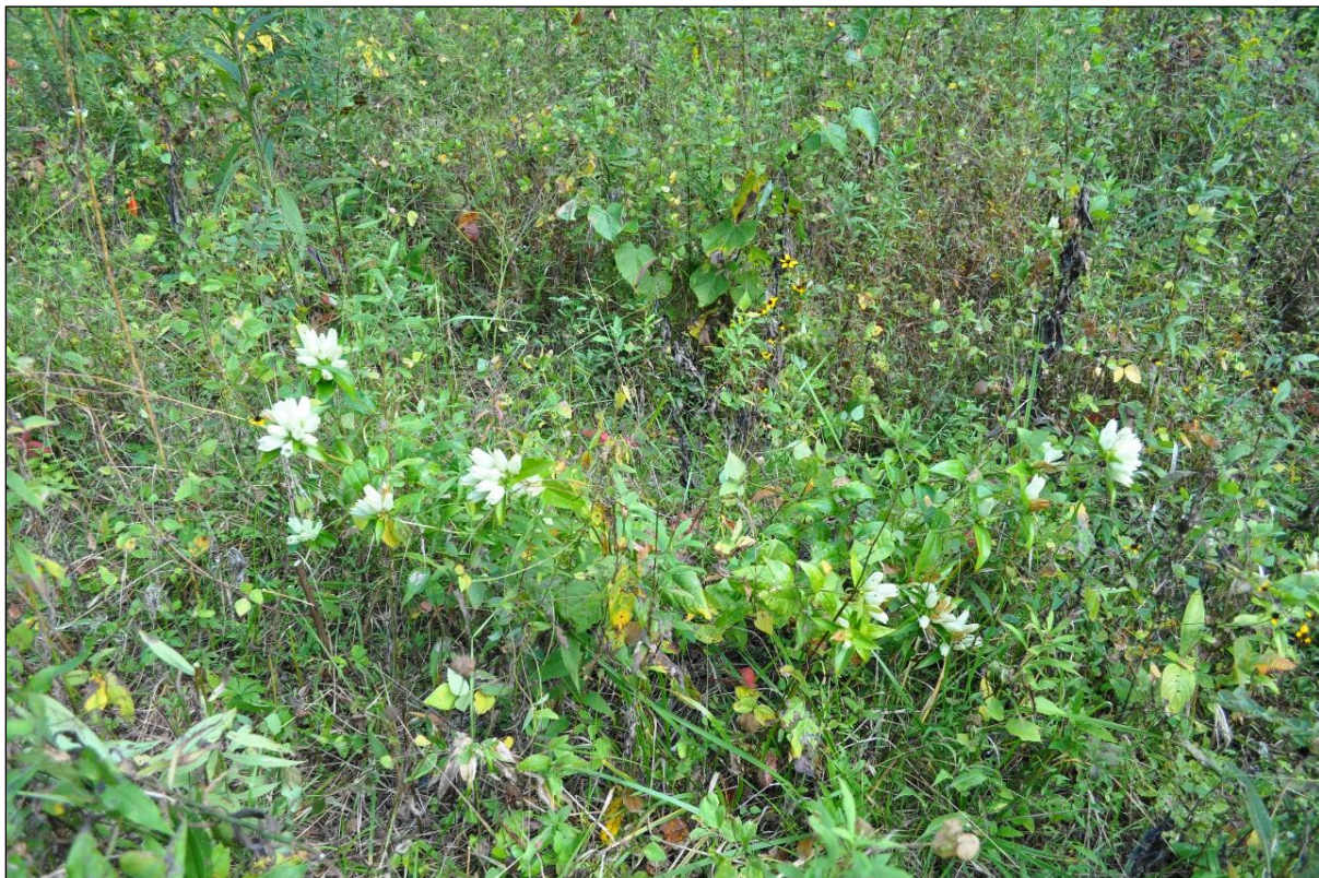
Figure 3. Gentiana flavida genet with several unbranched, sprawling ramets in the mesic prairie inclusion meadow.