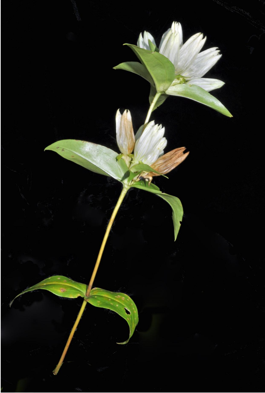
Figure 4. Gentiana flavida with simple, opposite cauline and whorled terminal leaves (Thompson 17-480, BERE).