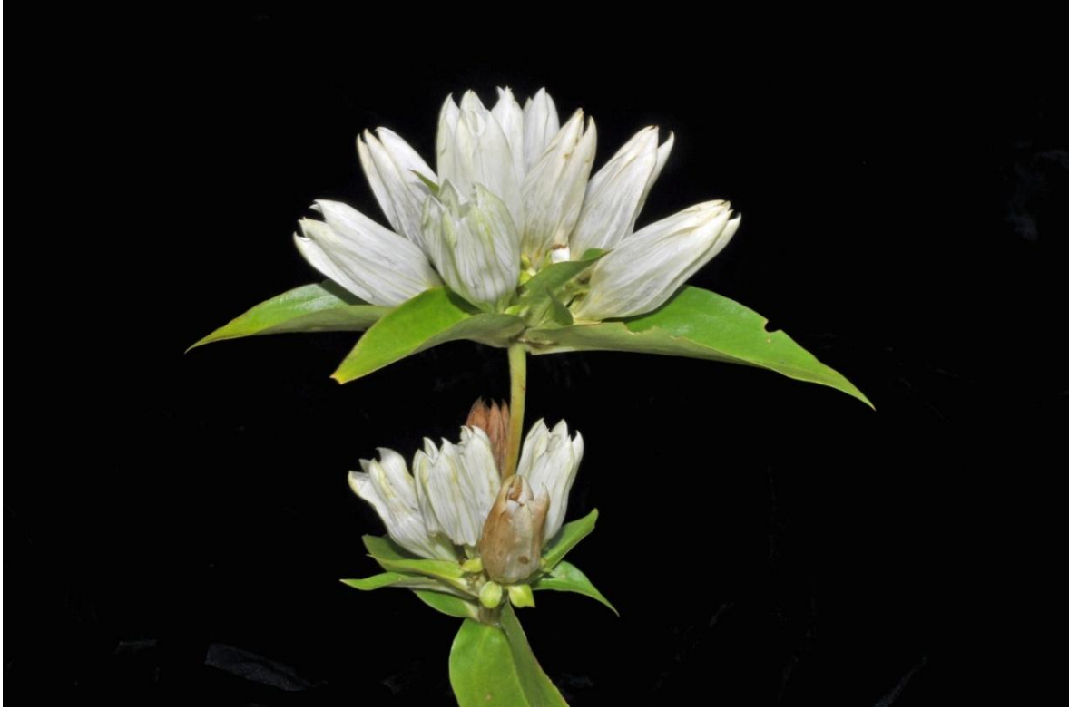
Figure 5. Terminal and axillary inflorescences of Gentiana flavida with two brown marcescent axillary flowers (Thompson 17-480, BERA)