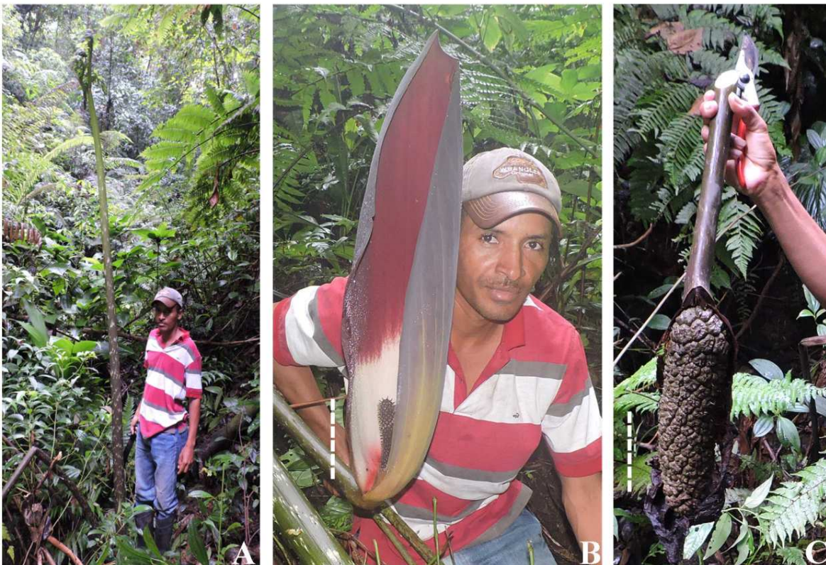
Figure 3. Dracontium pittieri . (A) Habit. (B) Inflorescence (scale= 11 cm). (C) Infructescence (scale= 15 cm).