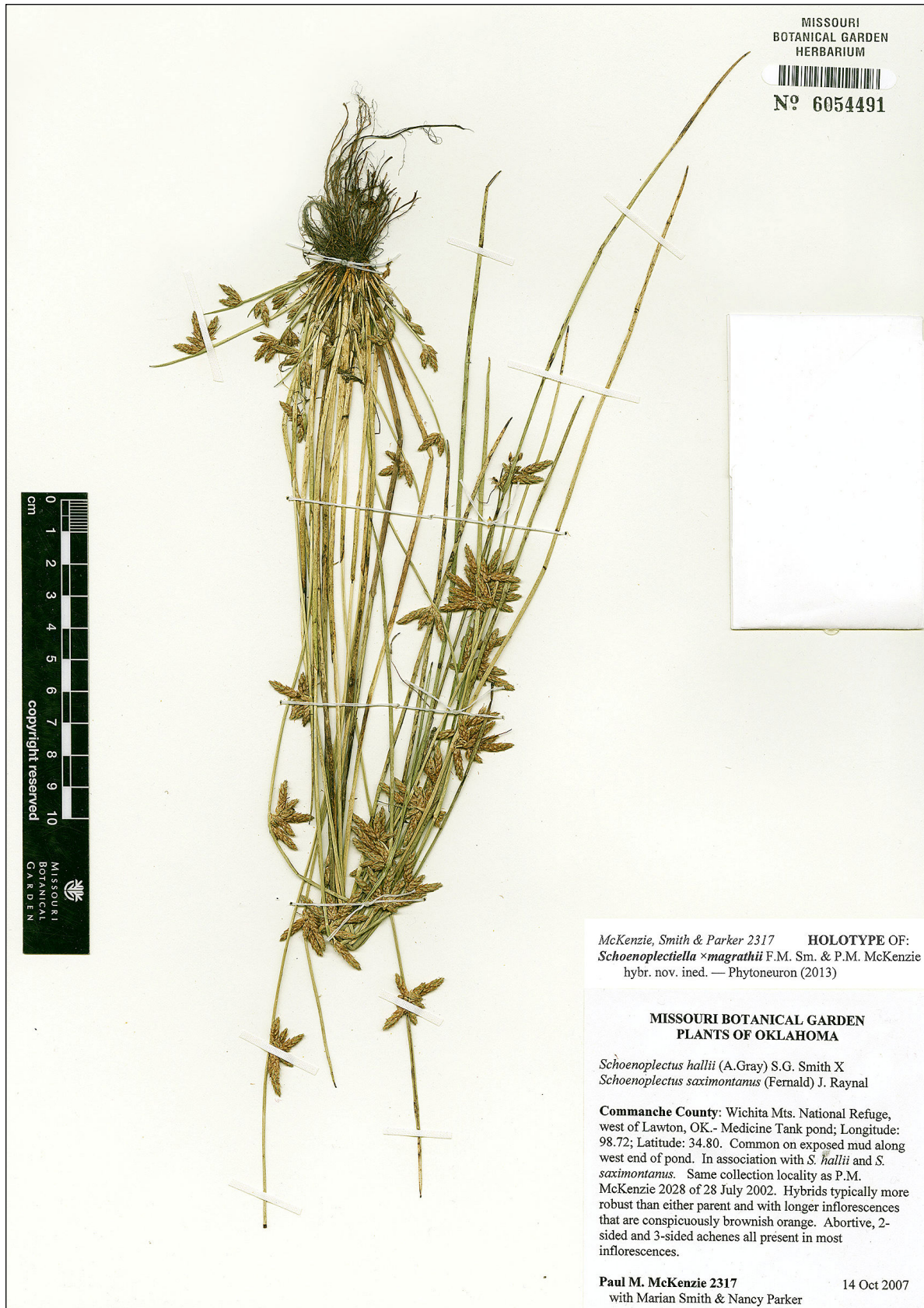
Figure 1. Holotype of Schoenoplectiella x magrathii Smith & McKenzie.