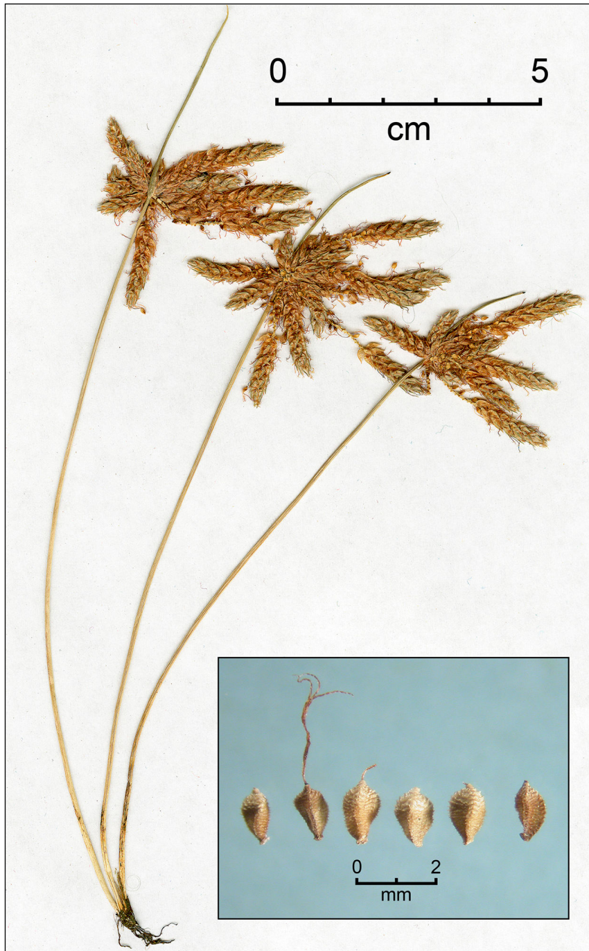
Figure 3. Unmounted specimen of Schoenoplectiella x magrathii . Inset contains abortive 3-sided achenes, one bearing a characteristic 3-fid style, produced by this individual. Approximately 4% of the achenes produced by this plant were fertile (Smith et al. 2004).

In addition to variation in achene shape, texture, and development, individual hybrids exhibited variability in style lobe-number. In 2004, Smith et al. reported that of the 56 spikelet flowers they examined, 2-lobed styles were associated with 2-sided achenes while 3-lobed styles were present on all trigonous achenes, regardless of whether they were collected from Schoenoplectiella saximontana or the putative hybrid. This condition appears to be common, if not universal, among the hybrids examined thus far.