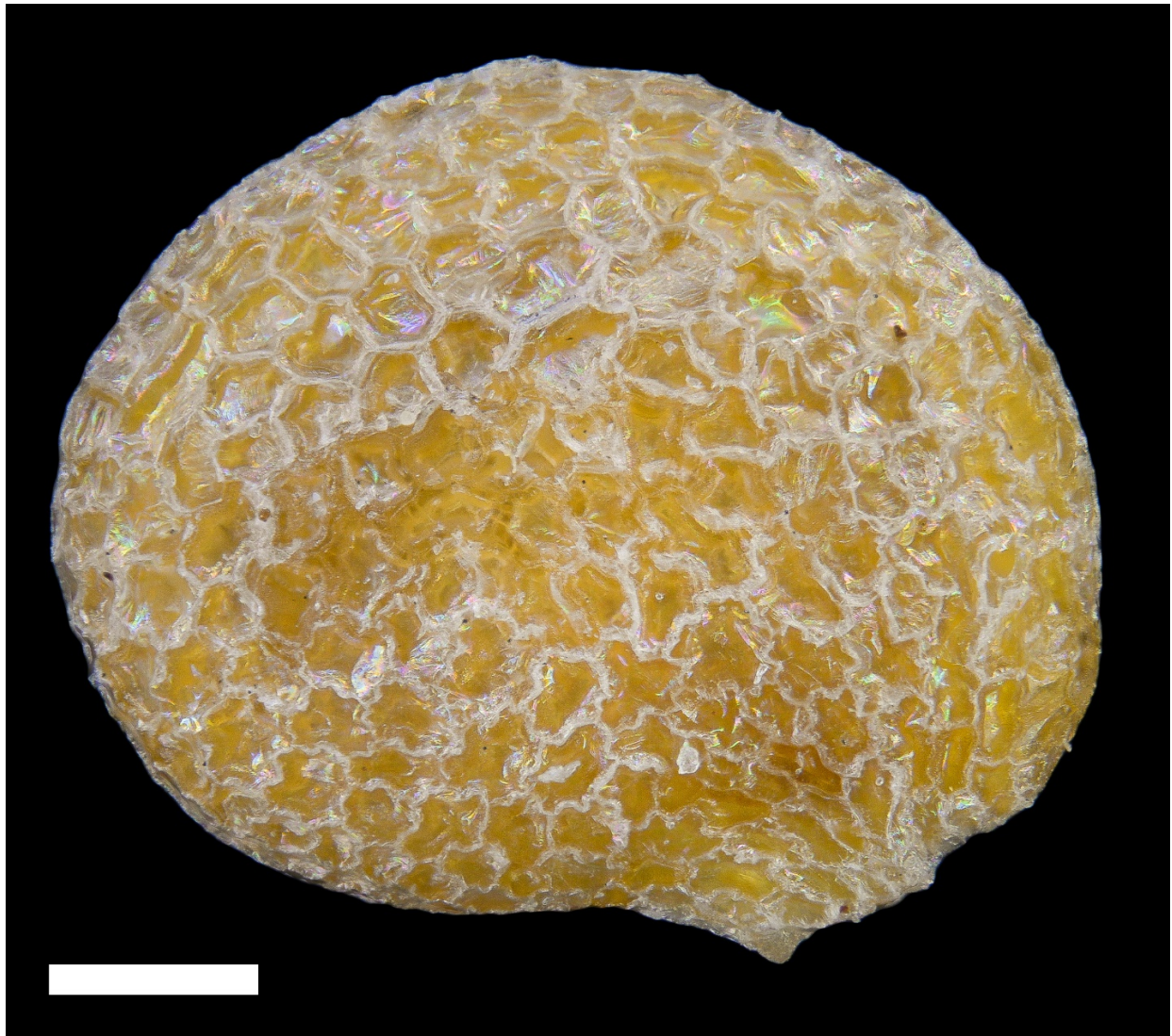
Figure 2. Seed of Lycianthes textitlaniana (taken from the holotype Alma Zárate Marcos AZM-274 (MEXU-1229513)); scale bar equals 0.3 mm. Photograph, by D. McNair, produced by stacking 45 images taken with a 10x objective lens attached to a Nikon DSLR. Use of specimen courtesy of the Herbario Nacional de México, Universidad Nacional Autónoma de México.