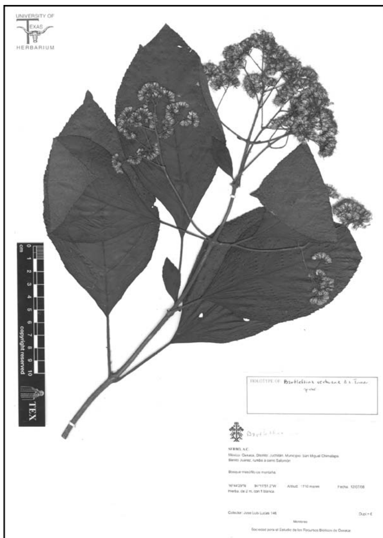
Fig. 2. Bartlettina serboana . holotype.