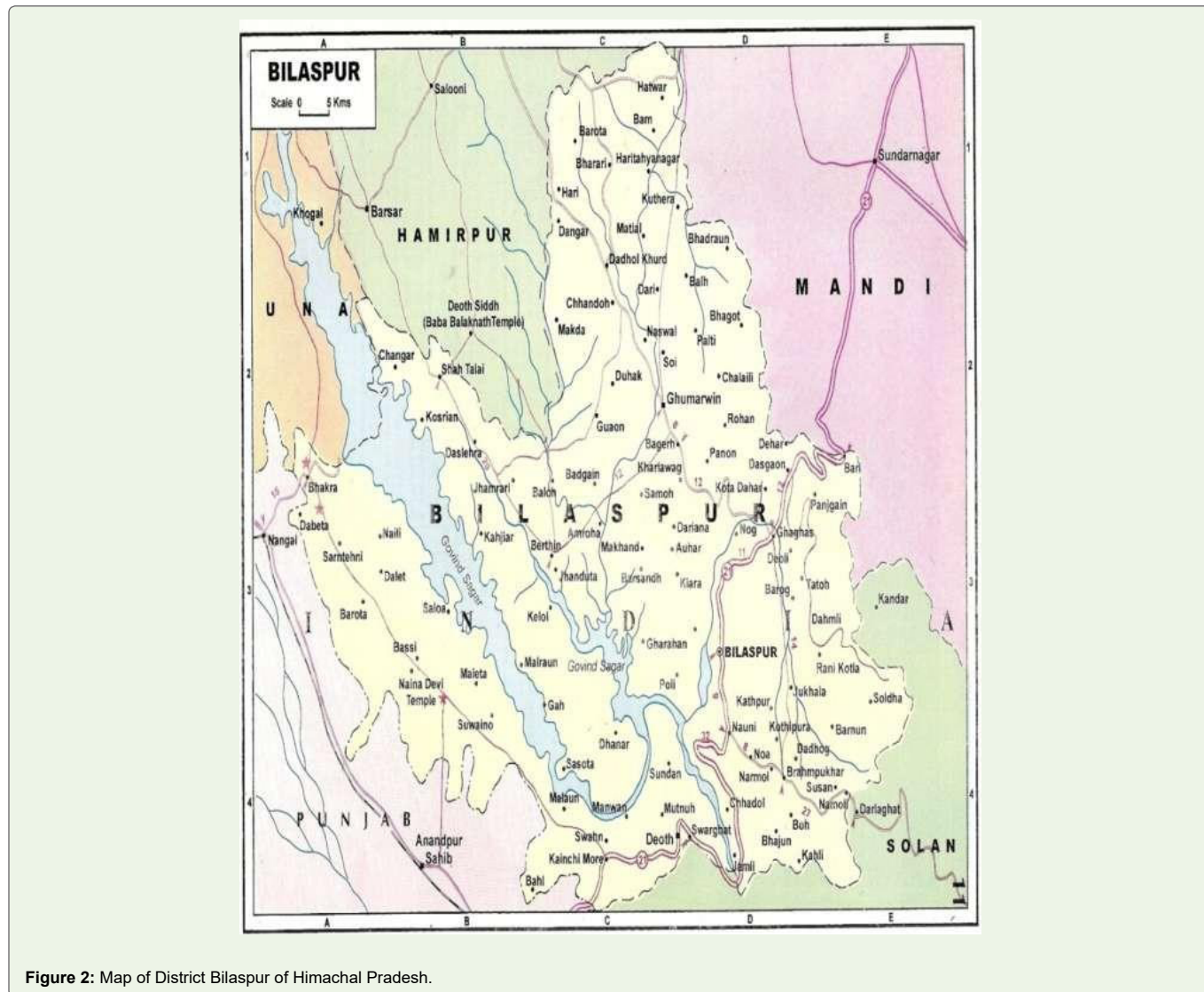
Figure 2: Map of District Bilaspur of Himachal Pradesh.

In order to study the diversity of bamboos of the district Bilaspur, its survey has been carried out during different seasons. A total of six species belonging to two genera, all included in lone family i.e. Bambusaceae are reported from the territory of Bilaspur. All the species of bamboos are abundant in Sadar, Ghumarwin, Bharari and Jhandutta Forest Ranges. However the species of bamboos are less abundant in Swarghat and Kalol Forest Ranges. Bambusa vulgaris has been reported from the nursery garden of ACC Limited at Barmana.