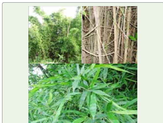
Figure 3: Bambusa bambos (L.) VOSS. syn. Arundo bambos L., Bambos arundinacea Retz., Bambusa arundinacea Retz., Bambusa arundinacea Willd. INDIAN THORNY BAMBOO, SPINY BAMBOO, THORNY BAMBOO. Vern.: Bans, Kantabans, Kattang, Kirhya, Magae, Magarbans, Malbans. Nal..

It is a tall thorny bamboo with crowded culms arising from stout and branching rootstocks. Clump is graceful and curving. Culms: 20-30 m in height, 15-18 cm in diameter, bright green shining; nodes prominent, the lowest nodes rooting, the lower nodes with leafless, spinescent, zigzag horizontal branches; internodes up to 45 cm long, somewhat depressed near the base of the branches, 2.5-5 cm thick wall; cavity small. Culm-sheaths: 30-38x22-30 cm, striate, orange-yellow, thickly ciliated with golden hairs when young, otherwise glabrous, rounded at the apex; blade 5-10 cm long, triangular, acuminate, glabrous outside, matted with dark bristles within, margins wavy, involute, thickly ciliate, auriculate; ligule narrow, entire or fringed with pale hairs. Leaves: 18-20x2.5 cm, linear or linear-lanceolate, glabrous above, glabrous or puberulous beneath, margins scabrous, tip sharp and stiff, base rounded or oblique and ciliate near the petiole; secondary longitudinal nerves 4-6 on either side of midrib, with pellucid glands at intervals; petiole 2.5 mm long, swollen; leaf sheath with short auricles, thickly ciliate when young, ligule short. Inflorescence is an enormous panicle, occupying the whole culm.