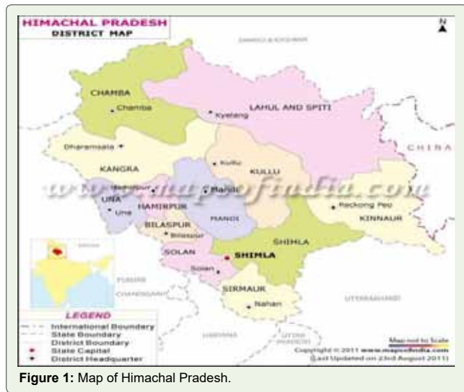
Figure 1: Map of Himachal Pradesh.

of Bamboos, we strictly adhered to the terminologies used by Haris and Haris (1994), Jain and Rao (1977), Polunin and Stainton (1984), Stainton (1988) and Womersley (1981)[2-6]. Their nomenclature is in accordance with the International Code of Nomenclature (ICN) or MELBOURNE CODE, 2012, International Plant Names Index (IPNI)[7], The Plant List (2013)[8] and Bannet (1987)[9]. The Natural System of Classification of plants with latest amendments has been followed in this paper.