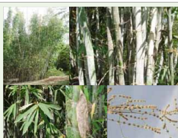
Figure 7: Dendrocalamus parishii Munro. Vern.: Faglu.