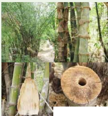
Figure 6: Dendrocalamus hamiltonii Nees & Arn. Ex Munro. HAMILTONS BAMBOO. Vern.: Kaghsi bans, Maggar.

Habitat: Wild or Cultivated. Distribution: Tropical Himalaya, India, Burma, SE. Asia, Nepal. India: Himachal Pradesh to Arunachal Pradesh, E. Himalaya, Assam. Himachal Pradesh: Hamirpur (DD), Kangra (DD). Altitude: Up to 2000 m.