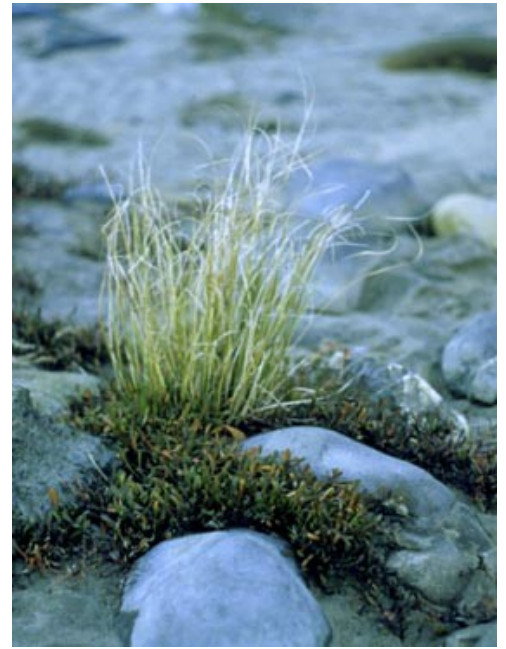
Carex litorosa .