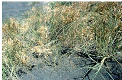
New Chums beach, Whangapoua, February.