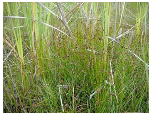
Wairarapa coast. Jan 2011.

Rhizomatous, tufted rush-like sedge. Rhizomes lignaceous, up to 1.5 mm diameter, loosely covered by large, membranous, overlapping scales. Culms 10-400 mm long, slightly greater than 0.5 mm diameter, dark green, red-green to greenish brown, wiry, erect, striated, unbranched, densely tufted or widely spaced along rhizome. Leaves less than culms, upper leaves alternate, rigidly setaceous, semi-terete, margins rarely scabrid towards leaf apex; basal leaves reduced to red-purple, grooved, mucronate sheaths. Inflorescence terminal, capitate with crowded sessile spikelets, subtending bract greater than inflorescence. Spikelets (2-)4-many, 2-5 mm long, 2-3-flowered. Glumes 5-7, bright chestnut-brown with green median nerve, 2-3 lowest smaller, empty. Hypogynous bristles 6, usually > nut, yellow-brown and scabrid towards the apex, often branched and basally plumose with long white hairs. Stamens 3. Style Branches 3. Nut ovoid to elliptical-oblong, 1.5 mm long, light grey-brown to red-brown, smooth, glossy, surface cells minute (appearing as dimples), angles scarcely thickened.