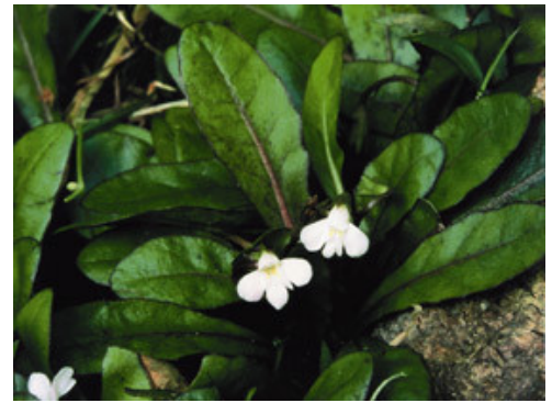
Dwarf musk.