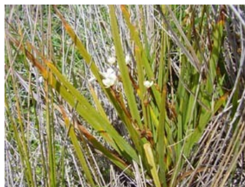
Puponga Farm Park, NW Nelson Coast.