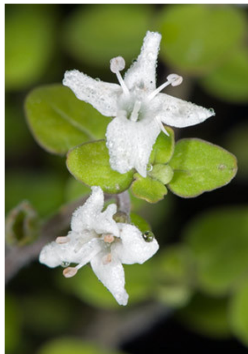
In cultivation. Mar 2007.

Gynodioecious, rhizomatous to ± stoloniferous, perennial forming loose patches up to 300 mm across; stems sparse to numerous, very slender, purple to purple-red, puberulent (especially on angles), initially ± creeping, subscandent or ascending at tips, usually much branched. Leaves bright green to yellow-green, sessile or with short hairy petioles 2-4 mm long. Lamina 2-15 × 2-15 mm, broad-ovate to suborbicular, smooth, entire or shallowly crenate, gland-dotted, mostly glabrous except for nerves on lower surface; base broad-cuneate or truncate; apex rounded. Flowers axillary, fragrant, solitary or in clusters of 1-3; pedicels prominent, puberulent. Calyx 3-4 mm long, narrow-campanulate to campanulate, villous, gland-dotted; teeth narrow-triangular, ciliate, much < tube, acute. Corolla c.6 mm long, white, glabrous; tube not exerted; lobes spreading, subequal; uppermost lobe ± 2-fid. Stamens scarcely exerted. Nutlets 1.0-1.3 mm long, ± broad-ellipsoid, slightly angled, smooth.