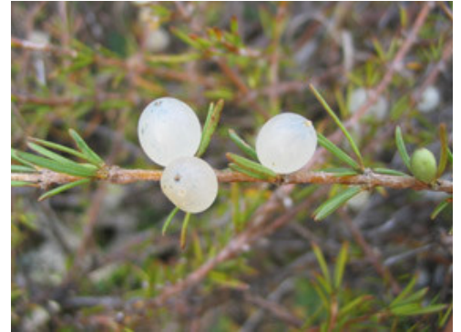
An image of sand coprosma in fruit.