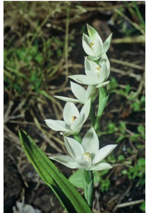
Thelymitra longifolia .