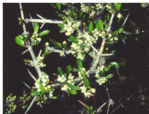
Danseys pass, November.