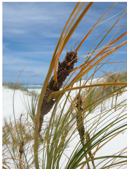
Parengarenga Harbour, East Beach.

Coastal sand dune systems. It favours sloping and more or less unstable surfaces, growing mostly on the front face of active dunes but also on the rear face and rear dunes, provided that there is wind-blown sand. It can also grow on the top of sand hills. It is effective at trapping sand.