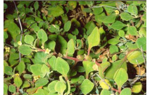
Tetragonia implexicoma.