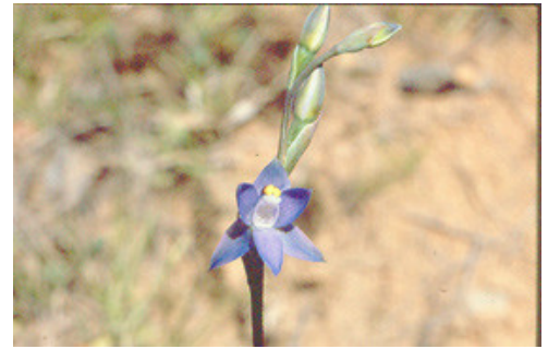
Flowering plant, Kennedy Bay (January).

Mostly coastal to lowland, rarely lower montane. Usually in very open shrubland, on clay pans, gumland scrub, forest margins, in ultramafic scree and in open grassland. This species is also commonly found in urban areas along street verges in bark gardens and wasteland.