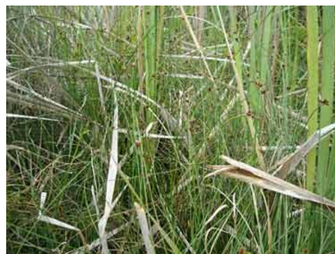
Wairarapa coast. Jan 2011.