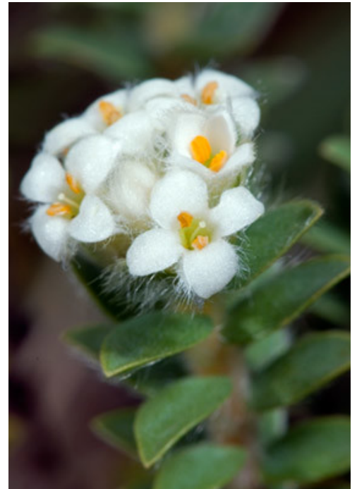
Riversdale. Nov 2006. Southern variant.