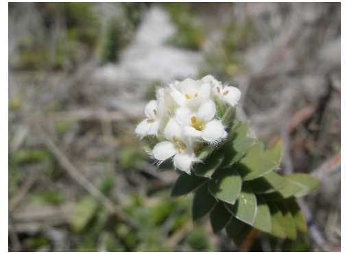
Pimelea arenaria .

Confined to sand dunes and associated swales and flats - usually in free draining sites but sometimes bordering streams in places prone to sudden flooding. On Rekohu (Chatham Island) this species often extends outside these habitats onto the sandy peat soils that were once forest and are now mostly pasture, and in these places it sometimes extends into dune forest remnants. It can be very common in pasture there probably because the soils are free draining and sandy and also because it is toxic and so cattle and sheep will not eat it. On the southern tablelands it is sometimes found within clears (on shallow peat soils) where it grows with other plants typical dune country such as Coprosma acerosa . Unusually for this species around Te Whanga it sometimes grows on limestone outcrops.