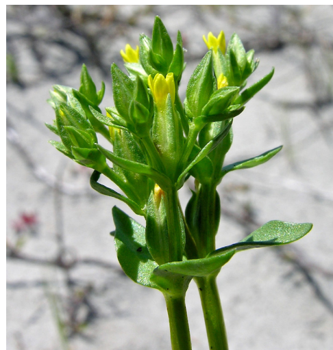
In cultivation ex Whanganui.

Coastal. Associated with damp, sparsely-vegetated dune slacks, depressions, and associated sand plains. In Australia more widespread, ranging from the coast inland to montane forest, often but not exclusively in seasonally damp ground.