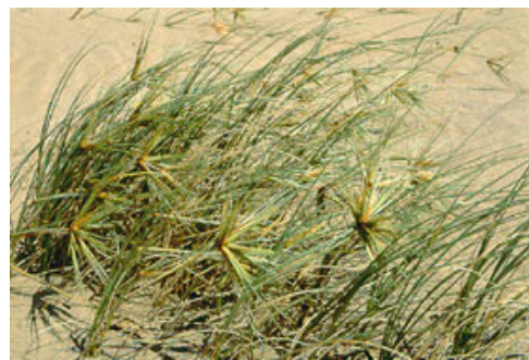
New Chums beach, Whangapoua, February.

Strictly coastal where it is confined to sandy beaches. This is the main dune forming indigenous plant in New Zealand. It is usually found at the front of actively accumulating foredunes. It does not tolerate stable dune systems and does not compete well with other introduced dune plants.