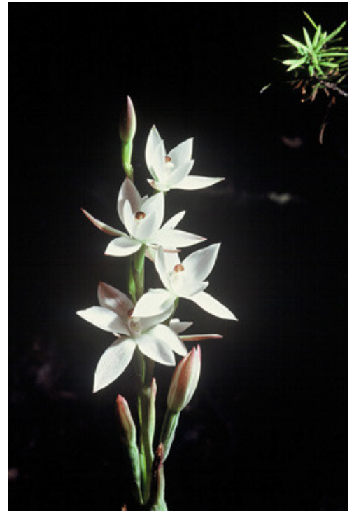
Thelymitra longifolia .

Coastal to subalpine (up to 1200 m a.s.l.). Occupying a wide range of habitats from open ultramafic talus to dense forest. However, it is most common in shrublands. This species is extremely variable and it is likely that following taxonomic revision, a number of forms, some with distinct ecologies, may be formally segregated.