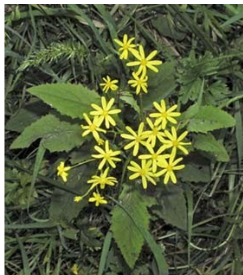
Near Marton. Dec 2007.