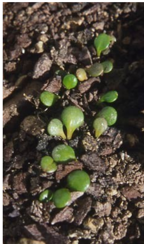
At Waikawa dunes. Nov 2004.

Rhizomatous, mat-forming herb, forming dense patches up to 700 mm diam., or diffuse patches when trailing through other vegetation. Stems 1-2 mm diam. Petiole 3-7(-17) x 0.5-1 mm, distinct from leaf. Leaves dark green, glabrous, alternate, appressed to ground, lamina 3-7 x 3-5 mm, rotund, orbicular, leathery, entire, apex obtuse, base obtuse. Flowers single, arising in leaf axils. Pedicel 3-9 mm, glabrous, green to red-green, erect or spreading; bracts 1.5-2 x 0.7-0.9 mm, lanceolate, falcate, green, erect. Sepals 1-1.4 x 0.7-0.9 mm, narrow-triangular, distal part flushed red, apex subacute. Corolla 7-8 x 8-9 mm, 5 petals fused in proximal part, inner surface white, outer pale red. Petals 3-4 x 1.5-2 mm, lanceolate, falcate. Ovary 1.4-1.6 mm, green, glabrous. Style purple-red, stigma glabrous, orange brown. Stamens 3, orange-brown. Fruit 2-3 x 2-3 mm, ovoid, green. Seeds 1.5 x 1 mm, cream-white, compressed.