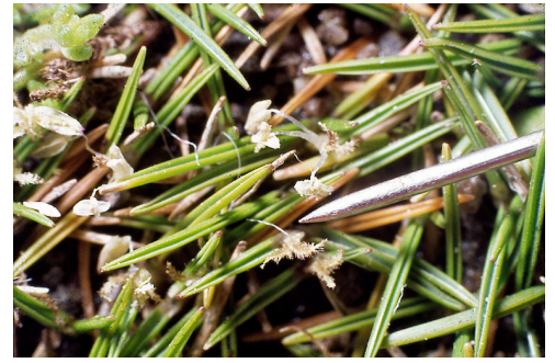
Flowers. Pihama. Nov 1975.