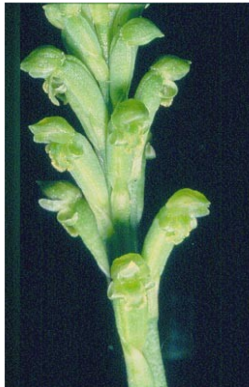
Kennedy Bay, November.