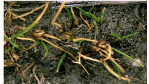
Close up of plants.