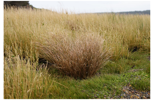
Awarua Bay, Southland.

December to April (but seedheads long persistent)