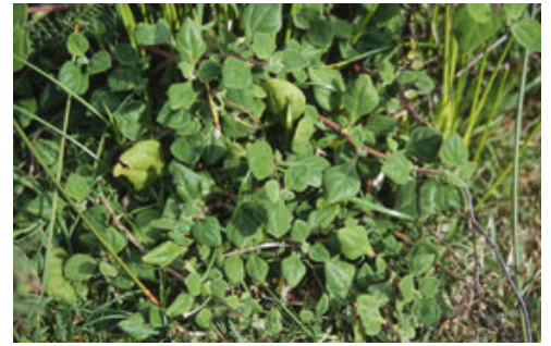
Kapiti Island. June 2005.

Coastal to montane. Mostly found in coastal areas occupying a variety of habitats from cobble and sand beaches through coastal forest and shrubland, also found in exposed windshorn vegetation on cliffs and rock stacks. Occasionally found growing well inland, sometimes in farmland where it grows in barberry ( Berberis spp.) hedges or on limestone and calcareous sandstone outcrops in otherwise dense forest.