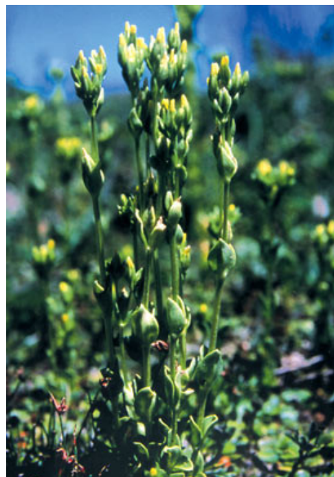
A mature plant of Sebaea ovata .