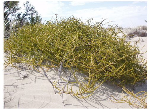
Pouto, Northland. December.

acerosa: From the Latin acus 'sharp', meaning sharp or pointed