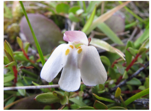
Wanaka.