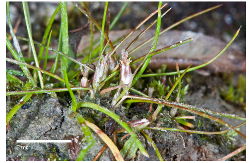
Lake Wairarapa. Nov 2011.

Minute, moss-like, densely tufted plant forming circular patches 10–100 mm diameter and up to 60 mm tall, bright green above, reddish brown below. Rhizome < 1 mm. diameter, much branched; sheathing bract at each node loose, membranous, with red nerves. Culms < 1.5 rarely up to 30 mm long, < 0.5 mm diameter. Leaves 1–2 on each branch, much > culms, 5–60 mm long, < 0.5 mm wide, setaceous, plano-convex; sheath membranous, red-nerved. Inflorescence an apparently lateral, single spikelet, or rarely 2, hidden among the leaves, pale green, occasionally with red markings; subtending bract leaf-like, channelled, very much > culm from which it arises and almost = leaves. Spikelets 2.5–3.5 x 1.5–2.0 mm, elliptical or oblong. Glumes 1–2 mm. long, ovate, elliptical, obtuse, white and membranous, or with patches of red on the sides; keel thick, green, occasionally slightly excurrent. Hypogynous bristles 0. Stamens 2–3. Style-branches 2–3. Nut c.0.5 x 0.5 mm, c. 2/3 length of glume, obovoid to suborbicular, plano-convex, dorsally rounded, noticeably apiculate, red-brown to dark brown, almost black, surface often shining but distinctly reticulate.