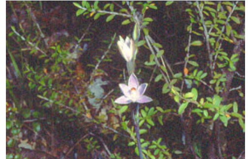
Flowering plant, Kennedy Bay (January).