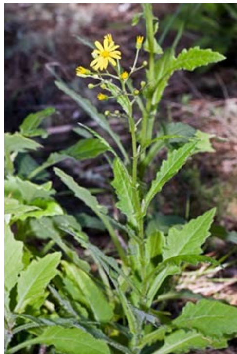
In cultivation ex Waitakere. Oct 2007.