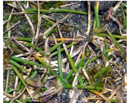
Taranaki coast. Oct 2005.