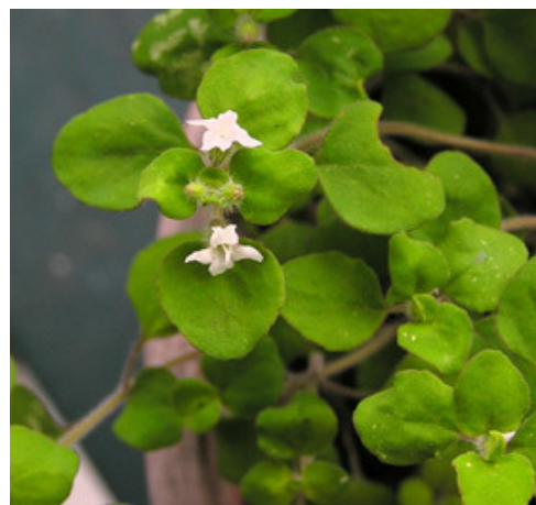
cult. ex Awhitu Peninsula, 11 Dec 2004.