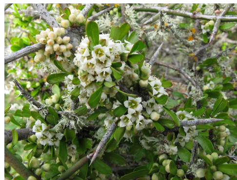
Quail Island.

Seeds are dispersed by ballistic projection and water (Thorsen et al., 2009).