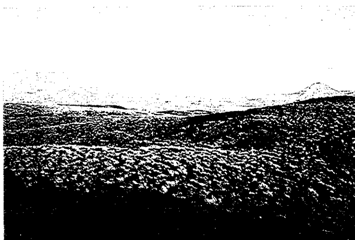
Volcanoes Ruapehu and Nguaruhoe from Kaimanawa Ranges.

From the Desert Road to Kuripapango - a five day vegetation reconnaissance via the Moawhango, Kaimanawa and Kaweka Mountains (March 2001). Peter van Essen gave a slide show of a fast paced 5 day trip (covering over 80 km) to have a quick look at the tussock grasslands in the Moawhango area (feral horse country) and beech forest health in the southern Kaimanawa and Kaweka Ranges, exiting at Kuripapango on the Taihape - Napier Road.