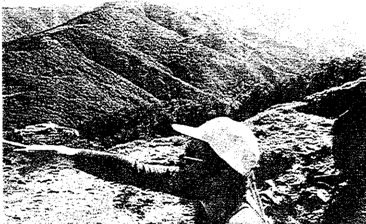
Peter contemplates his efforts from the ridge above Kiwi Saddle.

Looking at the impact of sika on these forest was one of the objectives of this trip. In some areas the sika browse is so intense that not only are all the palatable species removed from the undergrowth but all the beech saplings as well. The natural stand dynamics of mountain beech relies on these 'advance growth' saplings to provide new cohorts of beech trees to replace the adults when they invariably synchronously die back over sometimes quite large areas. These dieback events triggered by storm damage, drought or other disturbance, commonly occur in cycles of around 80-120 years but if the saplings are missing then, instead of beech regenerating, the areas are taken over by grasses or unpalatable shrubs. DoC is currently investigating the extent of this problem using exclosure and other monitoring plots and will use this information as the basis for a long term management plan for sika control.