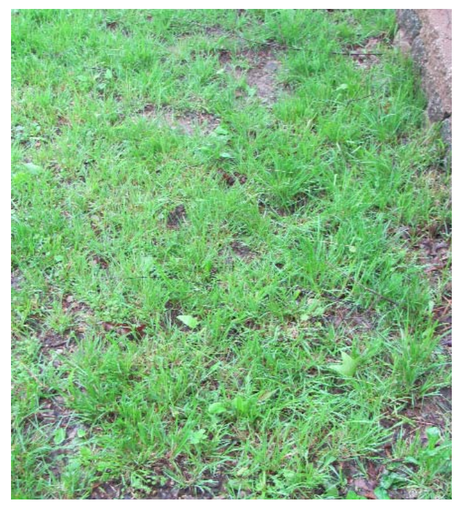
Demonstration plot established with poverty grass seed in a lawn.

For the second experiment, four sources of seed collected in Missouri were established under five light levels (20, 50, 70, 80, and 100% of sunlight) at Lincoln University's George Washington Carver Research Farm located in Jefferson City in spring 2009. At this site, plots were established on a well drained loamy alluvium. Planting site was sprayed with glyphosate in fall 2008 and twice in