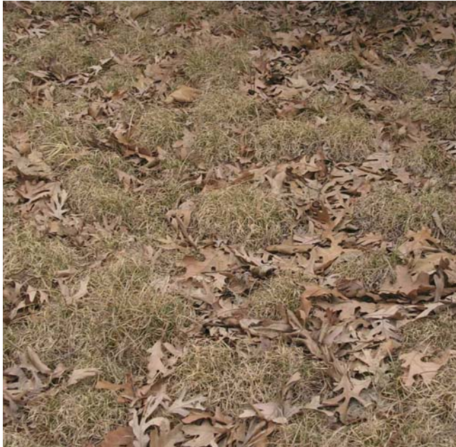
Poverty grass is usually found in full sun to moderate shade environments in upland forests, upland prairies, and glades. It tolerates dry and acidic soil and also grows in rocky soils.

According to Audubon International, tall grasses can provide several benefits including golf course beautification, greater plant and animal diversity, and reduced costs for maintenance by reducing the use of fuel, pesticides, and other chemicals (1). Several of the major challenges with using native grasses, especially native coolseason grasses, include limited amounts of high quality seed and limited knowledge as to identification and propagation techniques for these grass-