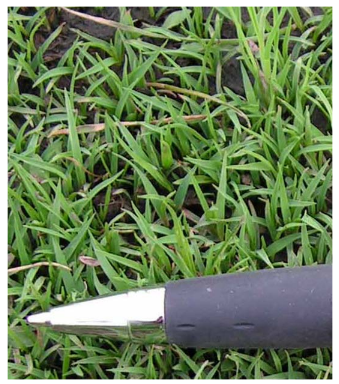
Fifteen day-old seedlings of poverty grass growing in the field in early spring.

air temperatures averaged 14° C. Seedlings remained green until the first killing frost in November. Percent ground cover in late April for plots seeded with 1000, 2000, and 3000 PLS/sq. ft. was 21, 21, and 30%, respectively, and in late May, it was 24, 25, and 27%, respectively.