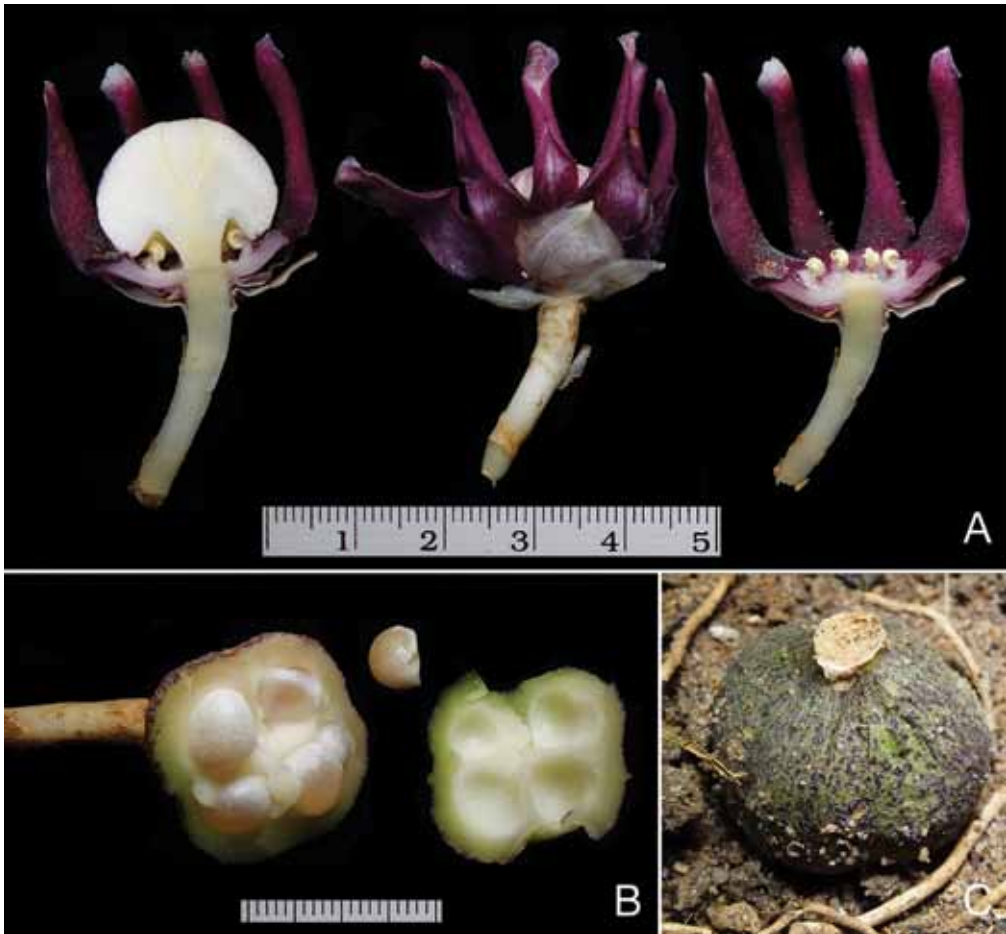
Fig. 4. Aspidistra connata Tillich var. radiata Tillich & Škorničk. A. Dissection of the flower & detail of the basal part of the flower (scale in mm). B. Dissection of fruit (scale in mm). C. Fruit. From type JLS-2594 .

c. 2 mm long; pollen cream white. Pistil mushroom-shaped; style 4–5 mm long, cream-coloured; stigma dome-shaped, 15–20 mm in diameter, cream-coloured with purple mottling on the upper exposed side, cream-white on the lower side facing anthers. Fruit almost spherical, up to 2.3 cm diam., green with fine purple-black mottling, mildly irregularly verrucose; seeds c. 8, light brown.