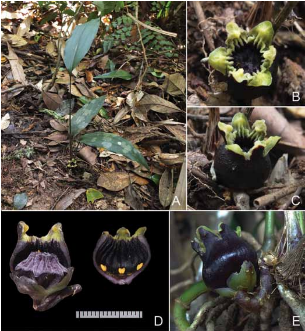
Fig. 5. Aspidistra mirostigma Tillich & Škorničk. A. Habit. B. Flower (top view). C. Flower (semi-side view). D. Dissected flower. E. Flower arising from rhizome (side view). From type JLS-1571 .

velvety appearance; style inconspicuous; stigma subsessile, lower half obconical, with 6 prominent longitudinal ridges in contact with the tube wall, ending in 6 triangular teeth (in upper view), upper half a truncated cone with numerous longitudinal grooves. Fruit echinate (only a very young fruit seen).