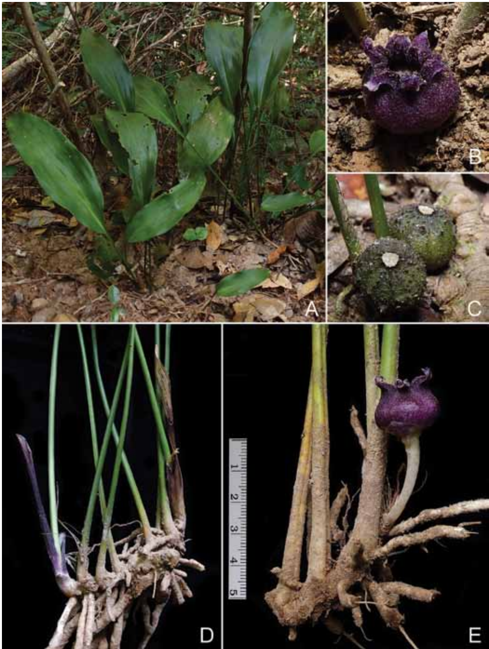
Fig. 1. Aspidistra ventricosa Tillich & Škorničk. A. Habit. B. Flower. C. Fruit. D. Rhizome and basal part of the plant showing young purple cataphylls. E. Basal part of the plant with flower rising from the rhizome. From type JLS-2581 .