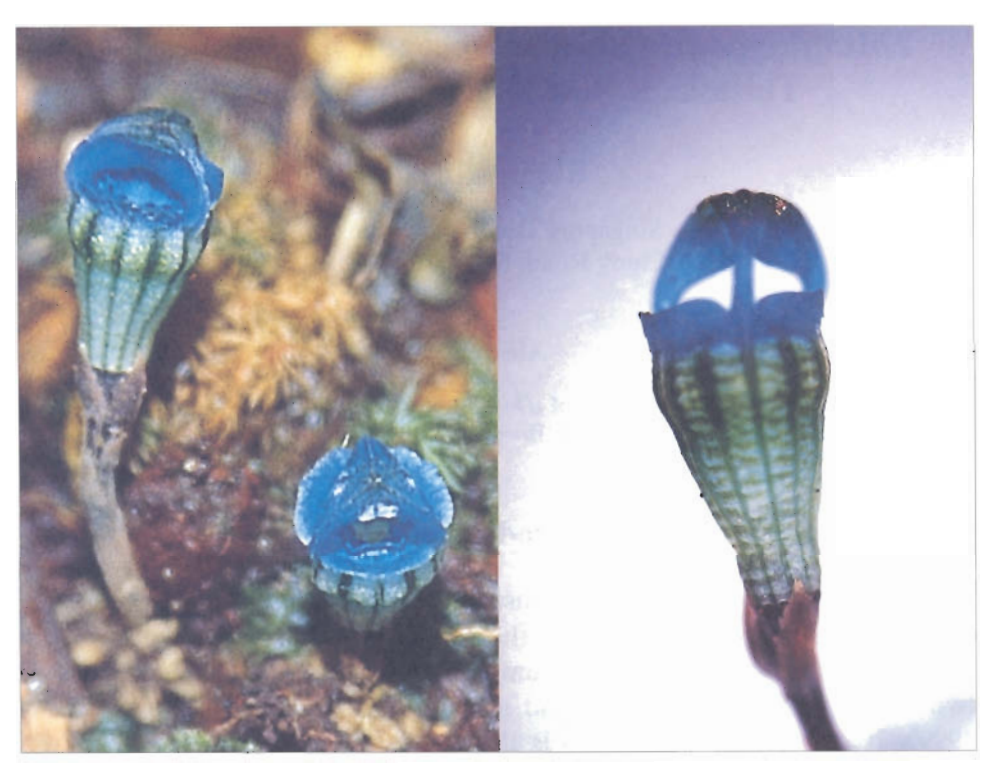
Figure 1. a. Thismia goodii growing on leaf litter, b. the flower.

Typus : Ruth Kiew RK 4611 , Borneo, Sabah, Sipitang, Ulu Maligan, 19 March 1999 (holotypus SAN, isotypi L, SING).