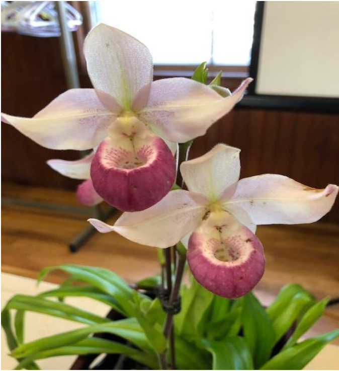
Phrag. Cardinale 'Wilcox'