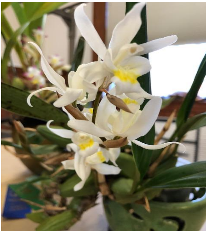
Celogone Unchained Melody