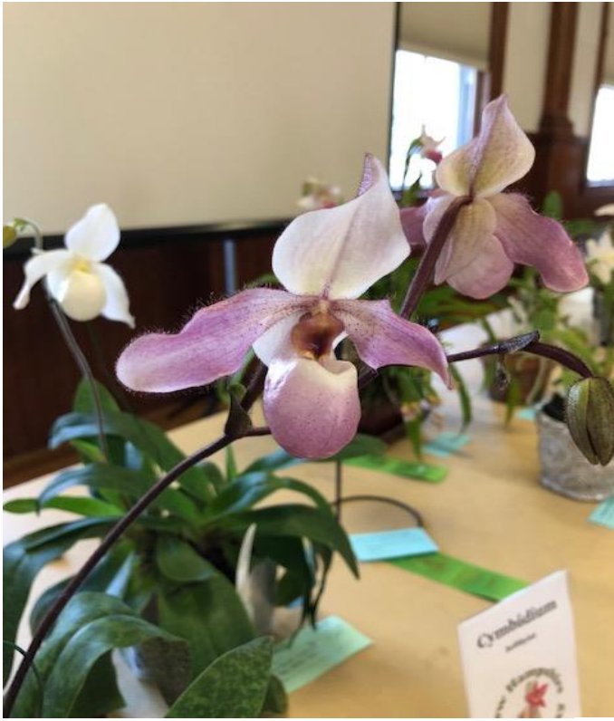
Paph. delenati f. vinicolor 'DePerle'