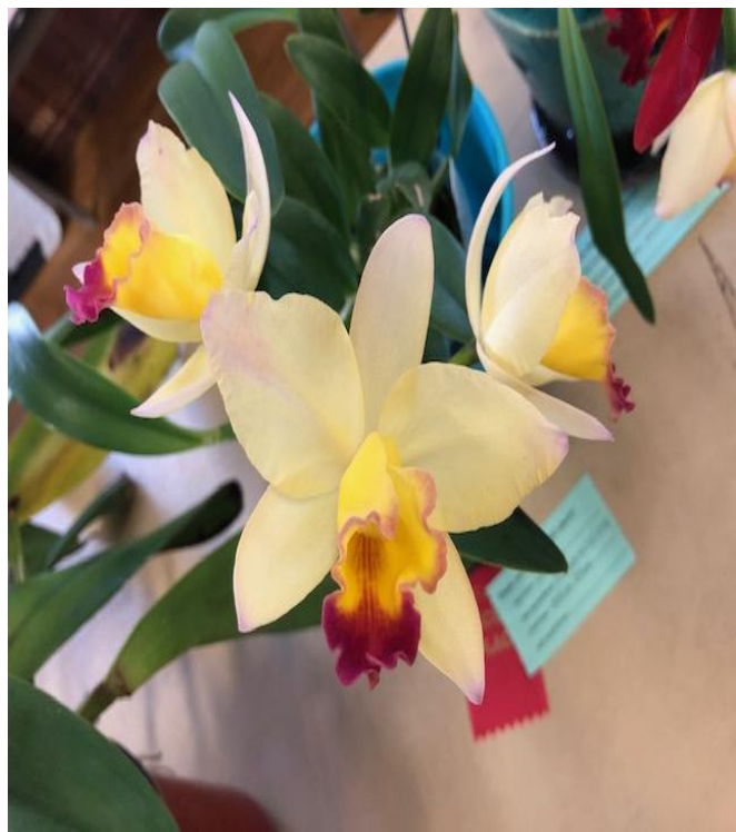
Pot. Eye Candy 'Mellow Yellow'