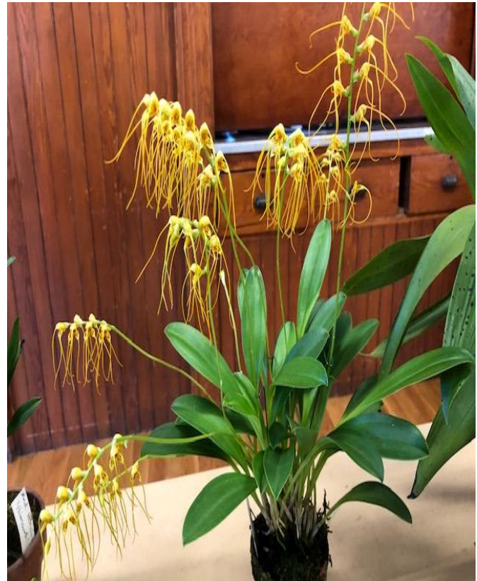
Masd. lehmannii 'Mountainside'