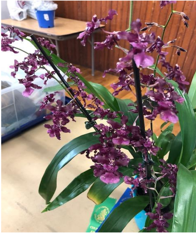
Onc. Heaven Scent 'Sweet Baby'