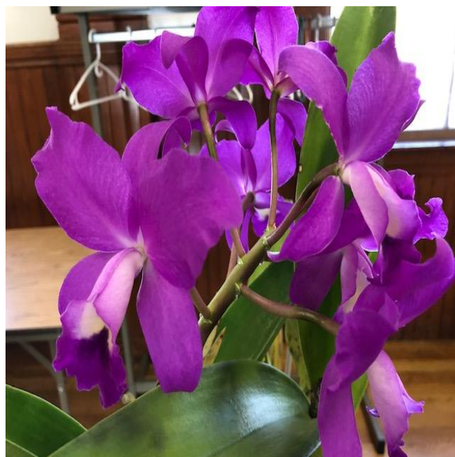
C. Portia (C. Bowringiana x C. labiata)