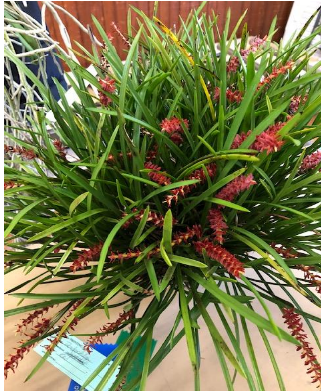
Dendrochilum wenzellii 'Red'